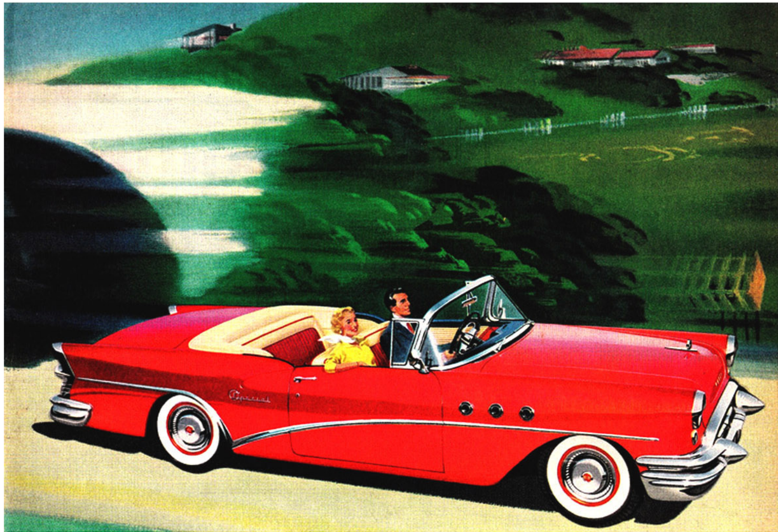
Shown here is the Buick SPECIAL Convertible, with a doozing 188-hp V8 engine, and a price that puts this big beauty just a whisper away from similar models of the "low-price three."