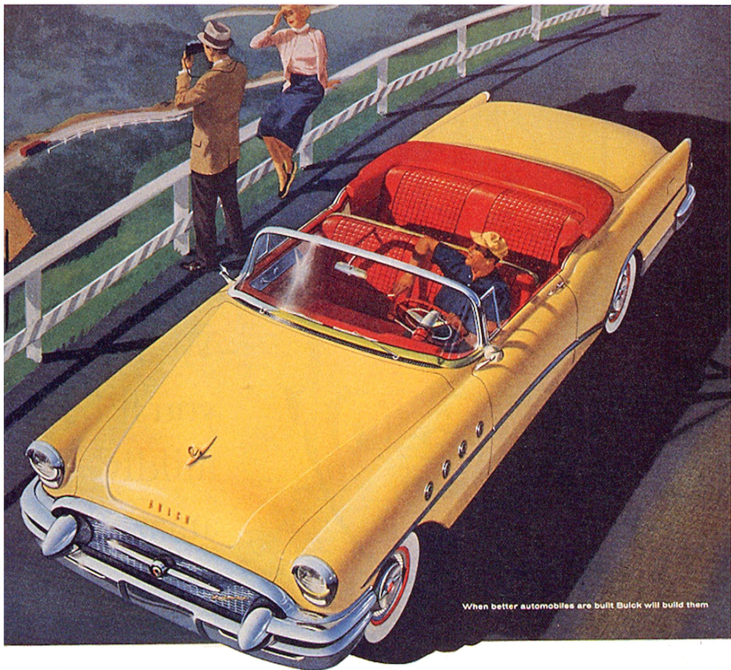
When better automobiles are built Buick will build them