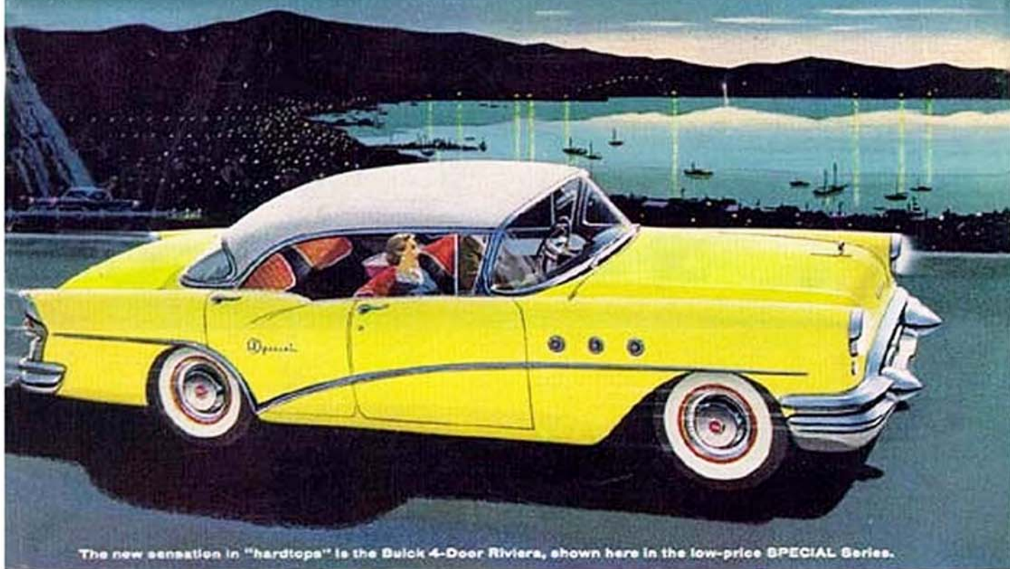
The new sensation in "hardtops" is the Buick 4-Door Riviera, shown here in the low-price SPECIAL Series.

Y OU CAN'T buy a car like this one just anywhere.