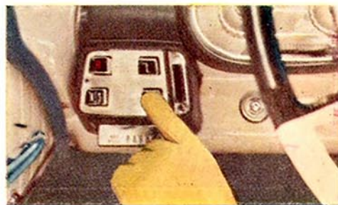
EXCLUSIVE KEYBOARD CONTROL —Starts engine; controls low, drive, reverse, park, neutral; and releases parking brake.

Mercury is the only car at any price that offers you all of these features. And it is the only car you can buy with the beauty and distinction of Dream-Car Design. Remember, too, this year THE BIG M is even bigger—4 ways outside,