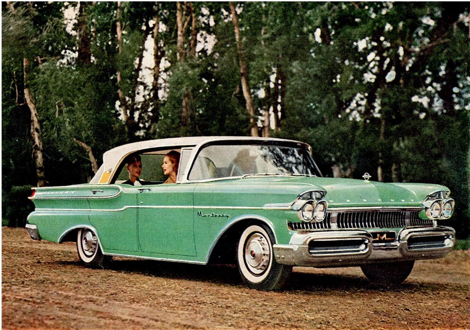
EXCLUSIVE FLOATING RIDE absorbs bumps, vibrations and road noises as never before. Shown above, the Monterey Phaeton Sedan.