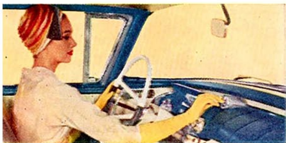
EXCLUSIVE SEAT-O-MATIC DIAL —Just set the dial. The power seat "remembers" your favorite driving position, moves to it automatically.