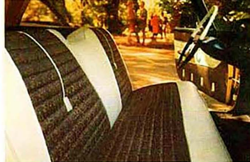
Unique! Sierra rear-facing "Spectator" Seat.