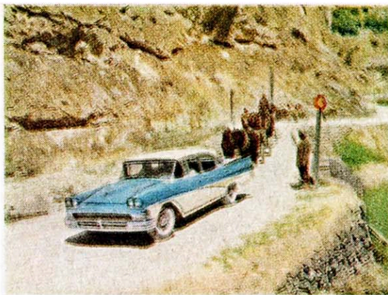
YUGOSLAVIA! Twisting mountain passes were straightened by the precision of Ford's new, feather-light Magic-Circle steering.