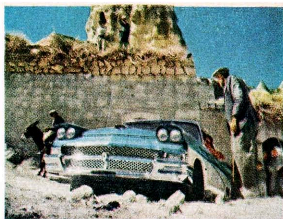
TURKEY! Even rough, rock-studded back roads were tamed by the 58 Ford's new, easier riding, Ball-Joint front suspension.