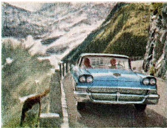
SWITZERLAND! Powering over the Alps, Ford's new Even-Keel rear suspension made sure going on the sharpest curves.