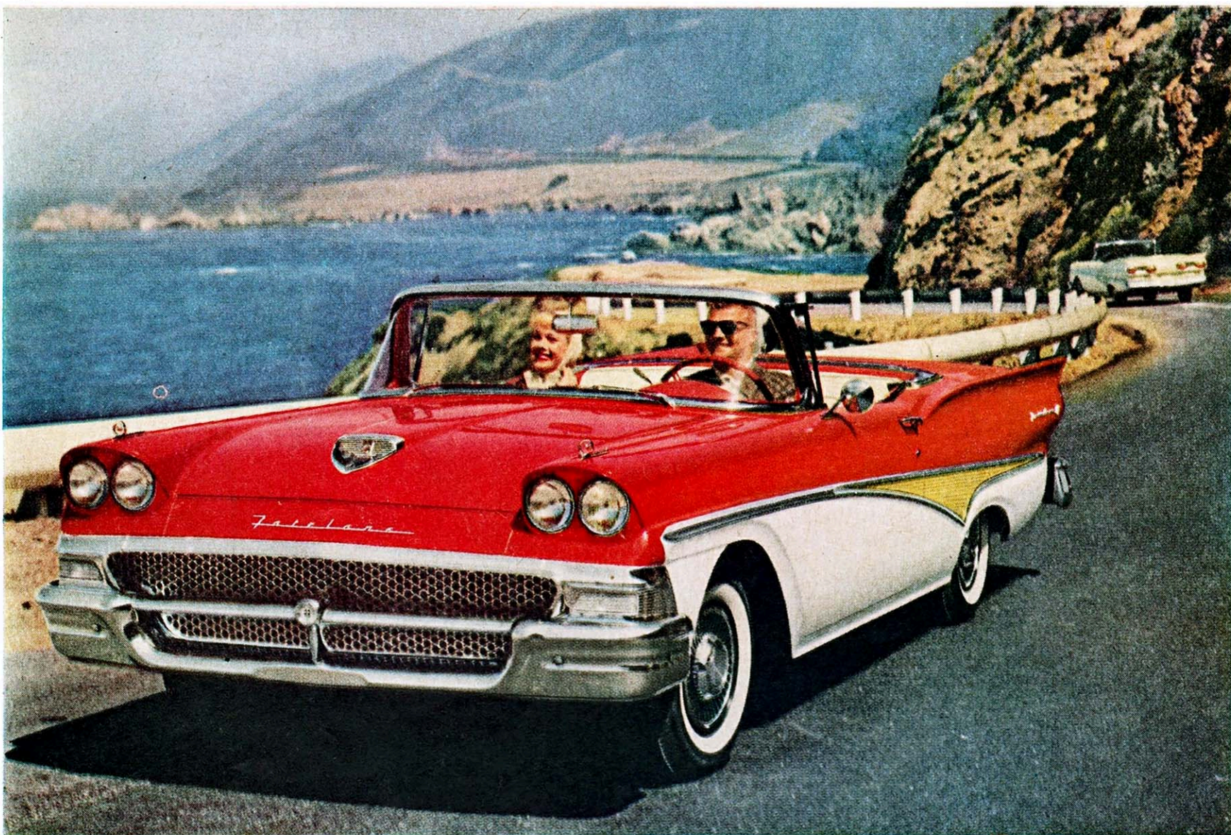
U.S.A.! Sailing along a newly built highway, the 58 Ford handles like a dream. You get fine-car comfort . . . at low Ford prices!