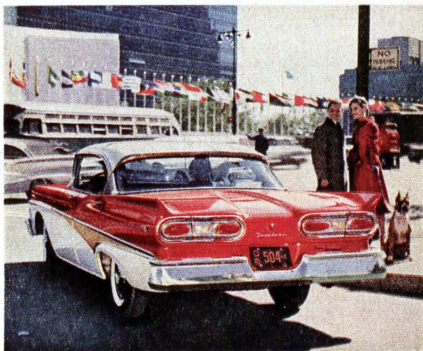
UNITED NATIONS in New York. At home, as abroad, the new Ford is the greatest eye-catcher on the road. And its new power, ease of handling and comfort, proved around the world, make it today's greatest car value leader. Ask for an Action Test at your Ford Dealer's.

This is the new kind of fashion . . . classic beauty and superior value brought together in one big prize package. And this fine car can be all yours at a very low Ford price.