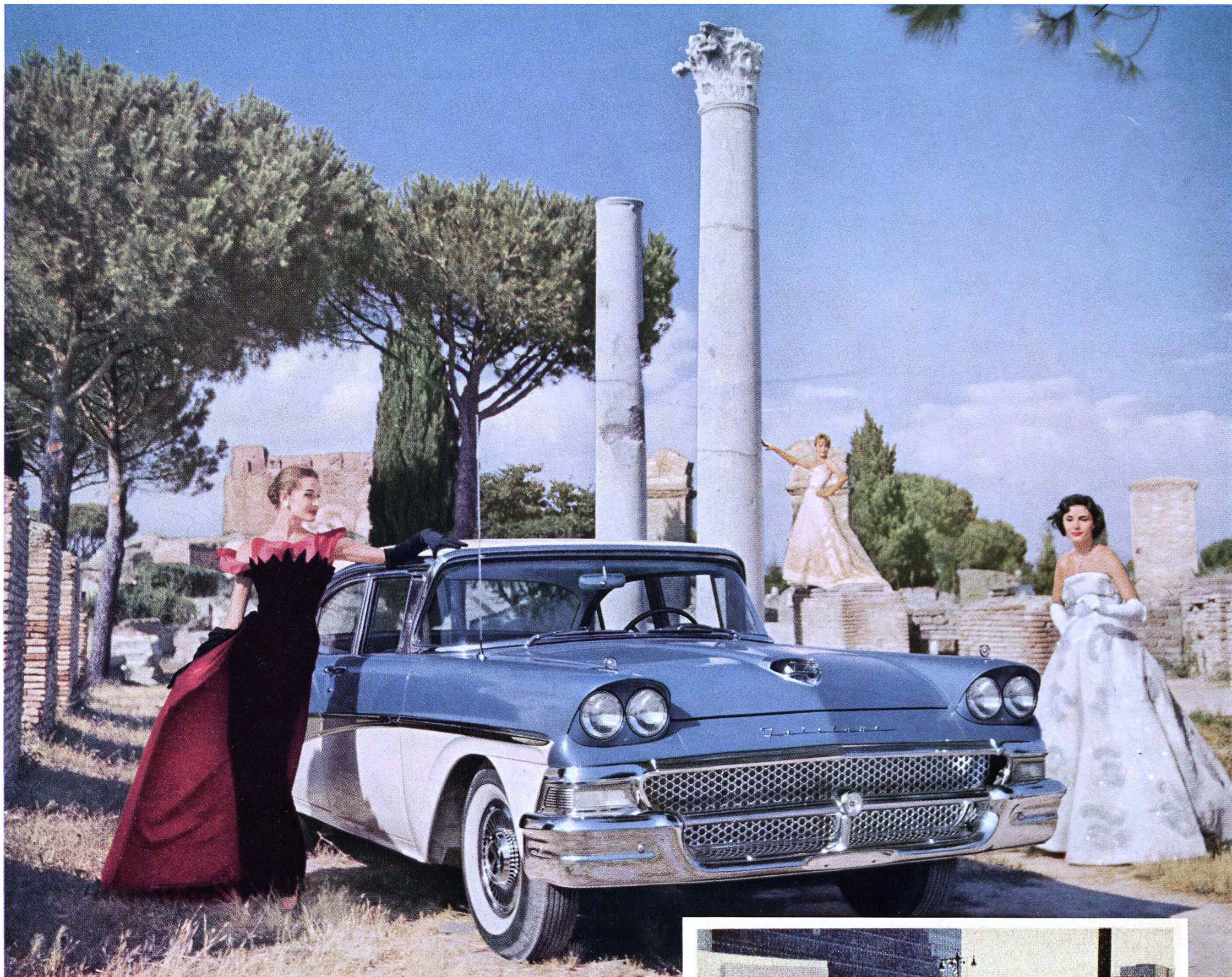
ROME. The high style of Fontana's latest creations is a beautiful complement to the superb new fashion set by the 1958 Ford.