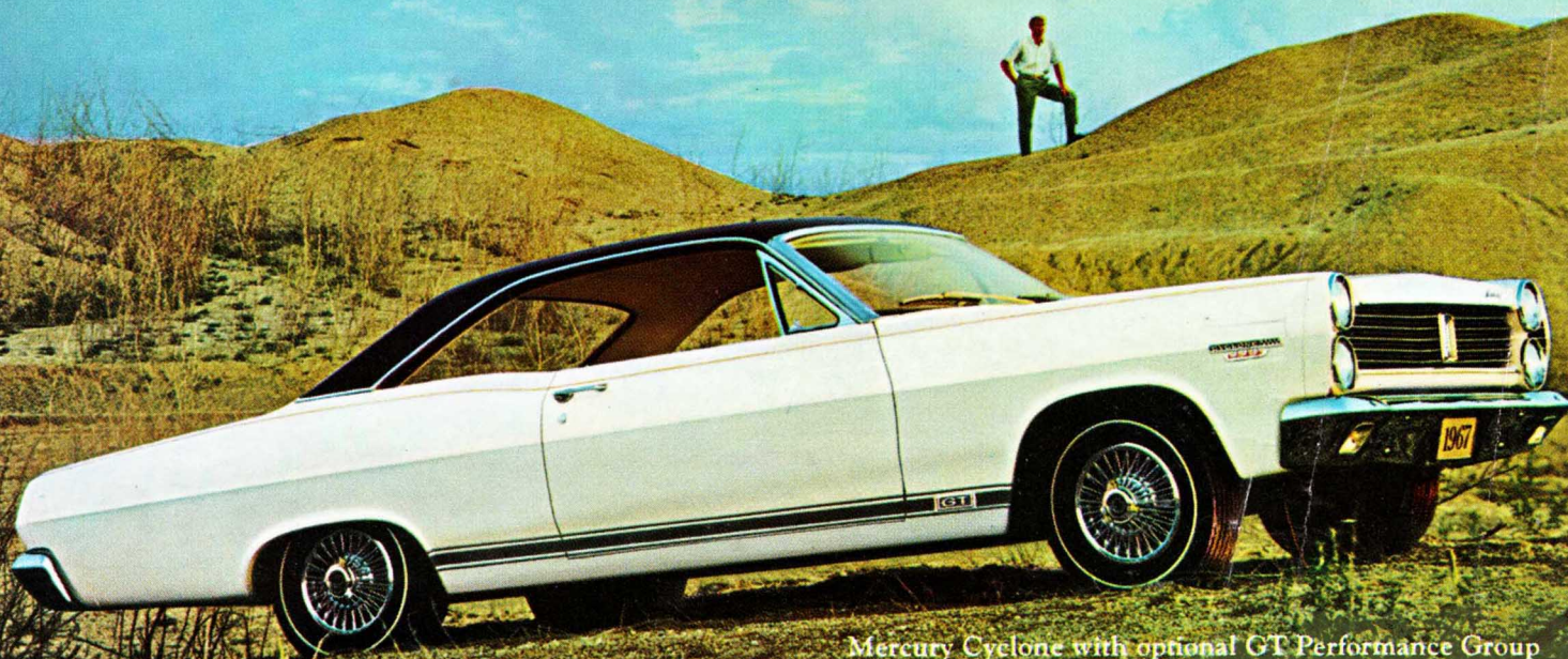
Mercury Cyclone with optional GT Performance Group