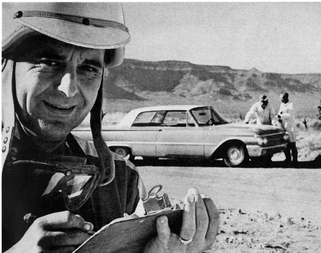
Racing Ace Johnny Mantz completes oil check on a '61 Galaxie driven at 120 mph at Ford's Kingman, Arizona, Test Center.

Reports Johnny Mantz: "This machine really got a workout ... across the desert from Needles to Nogales and down the pike from Boise to Broken Knee. It was smashed over hot desert sand...into water traps at high speed...and crawled through city streets. Afterwards, they brought it back here to Kingman, where I drove it at 2 miles a minute. Then they dumped the oil and checked it. No sludge in this crankcase! Ford's new full-flow filtering rig really works. 4,000 miles between oil changes. Easy with this one!"