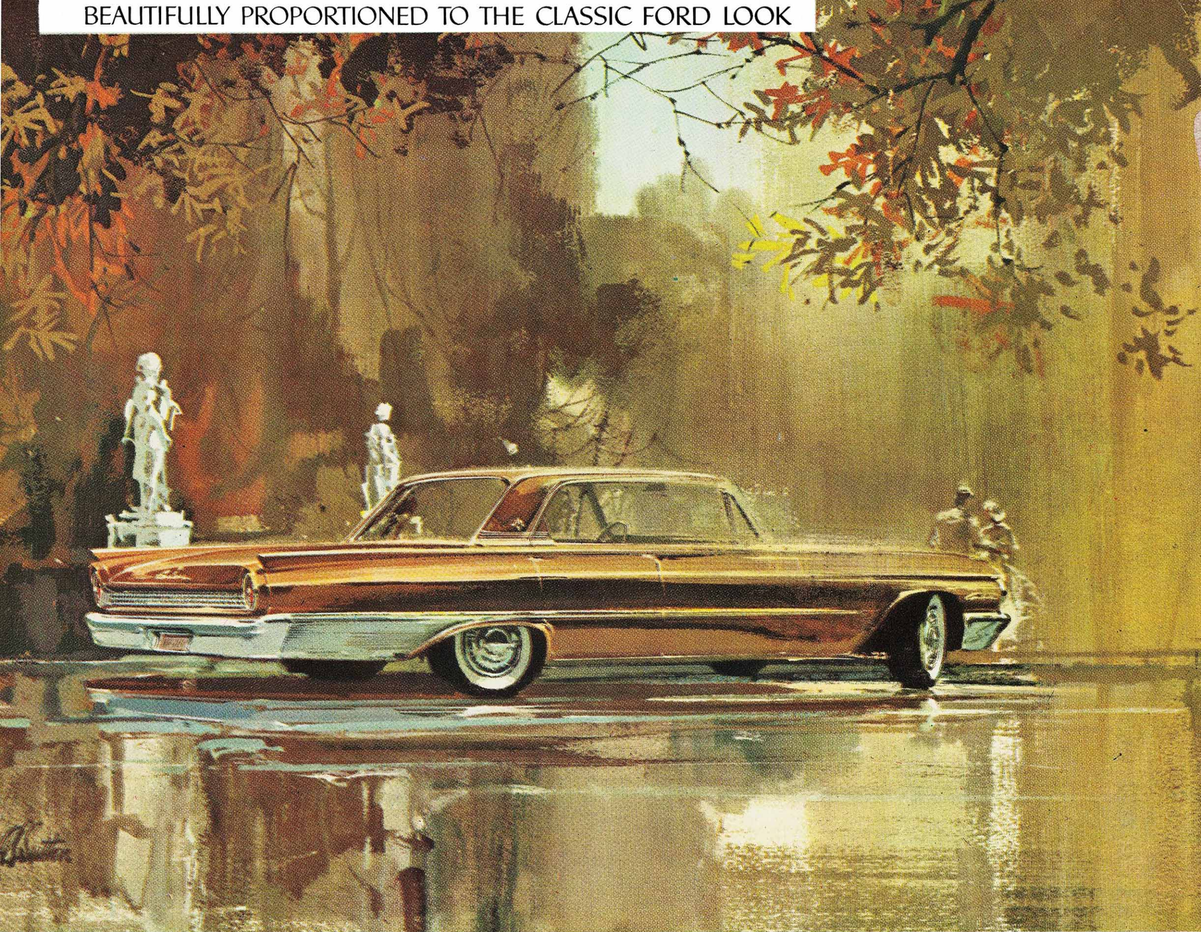
The 1961 Galaxie Town Victoria

BEAUTIFULLY PROPORTIONED TO THE CLASSIC FORD LOOK