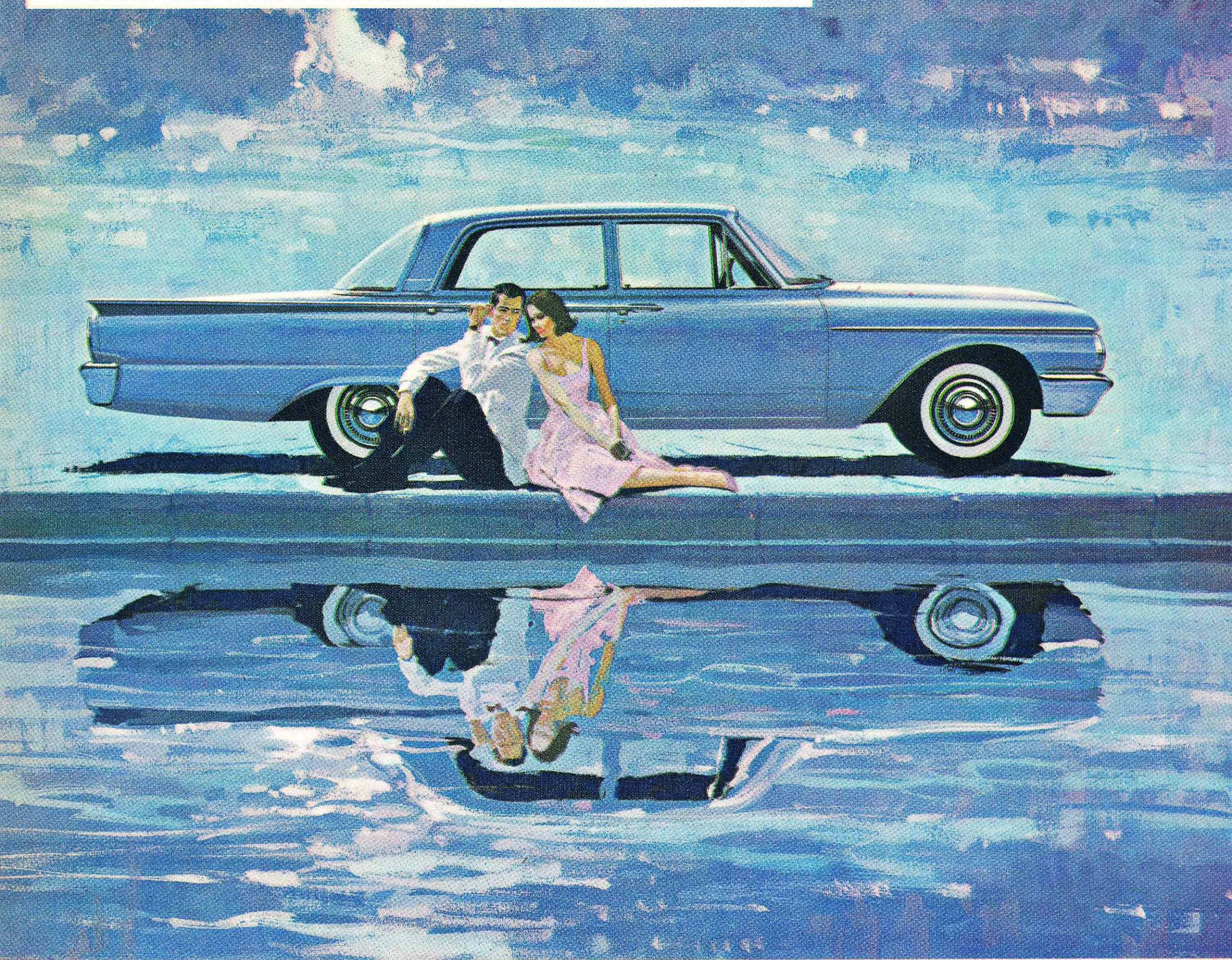
1961 FORD FAIRLANE in Starlight Blue

BEAUTIFULLY PROPORTIONED TO THE CLASSIC FORD LOOK