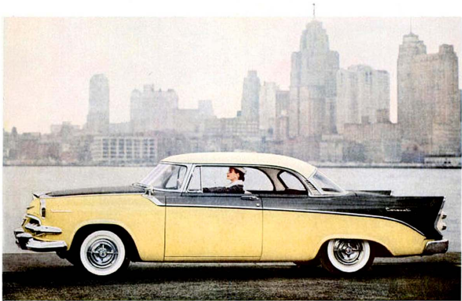
Now . . . a truly big car in the low price field! New '56 Dodge Coronet Lancer.