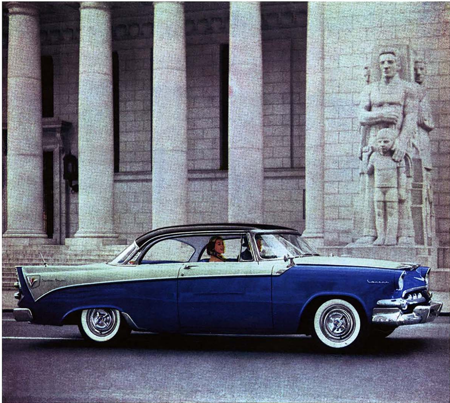
Lancer by Dodge . . . it rules the road in flashing style.