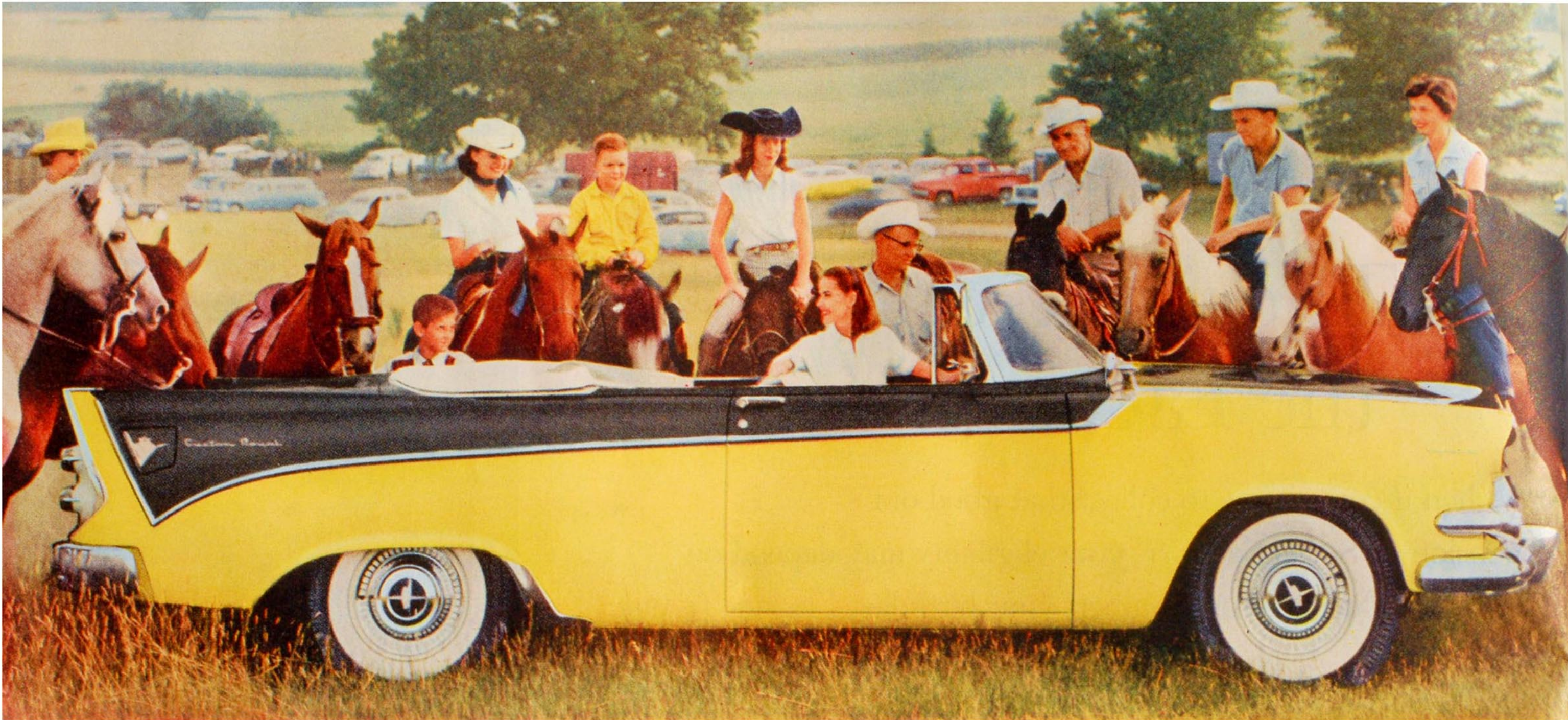
DODGE CUSTOM ROYAL V-8 LANCER CONVERTIBLE

1. THE FLIGHT-SWEEP! Here is car design that millions of people are finding exactly to their tastes. They agree that the long, low aerodynamic lines and smartly upswept tail make The Flight-Sweep the design of the year! And it's a design that foreshadows things to come!