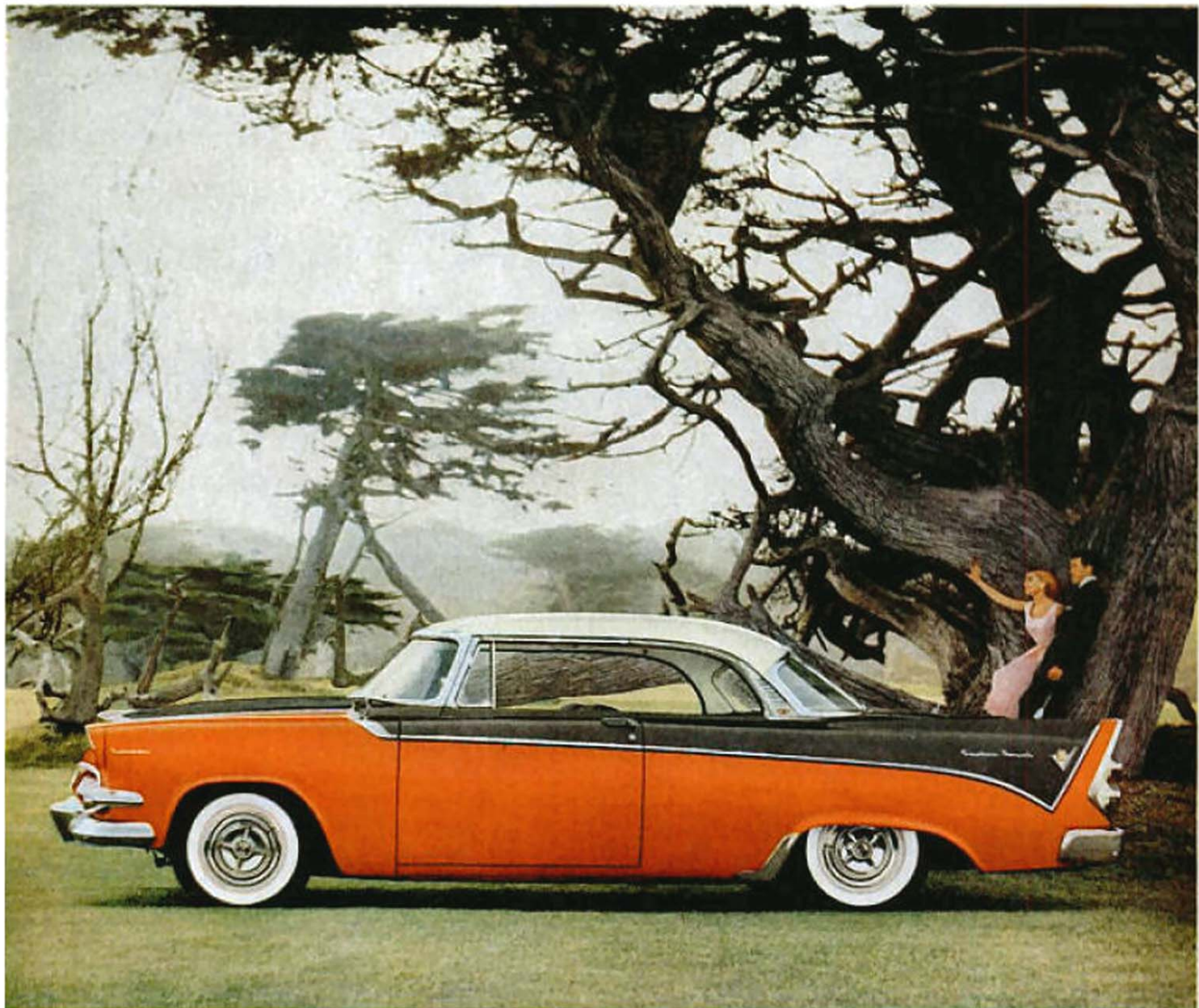
The Success Car of the Year . . . dramatically beautiful, dynamically powered.

A new world of adventure is waiting for you