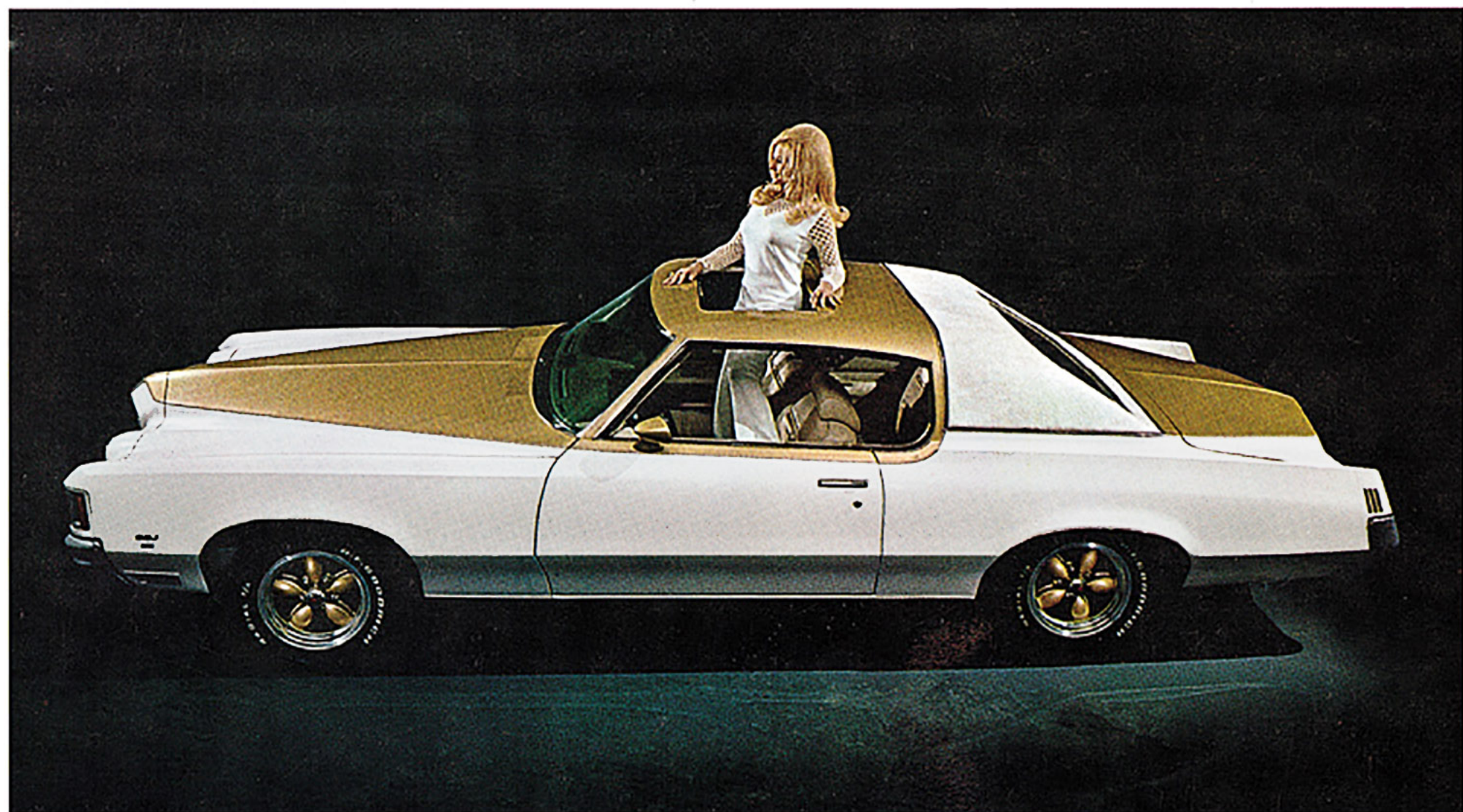
LINDA VAUGHN, "MISS HURST GOLDEN SHIFTER" AND THE NEW SSJ HURST, SHOWN WITH OPTIONAL WHEELS AND TIRES.

AN EXCLUSIVE CUSTOM CONVERSION BY HURST PERFORMANCE RESEARCH CORPORATION