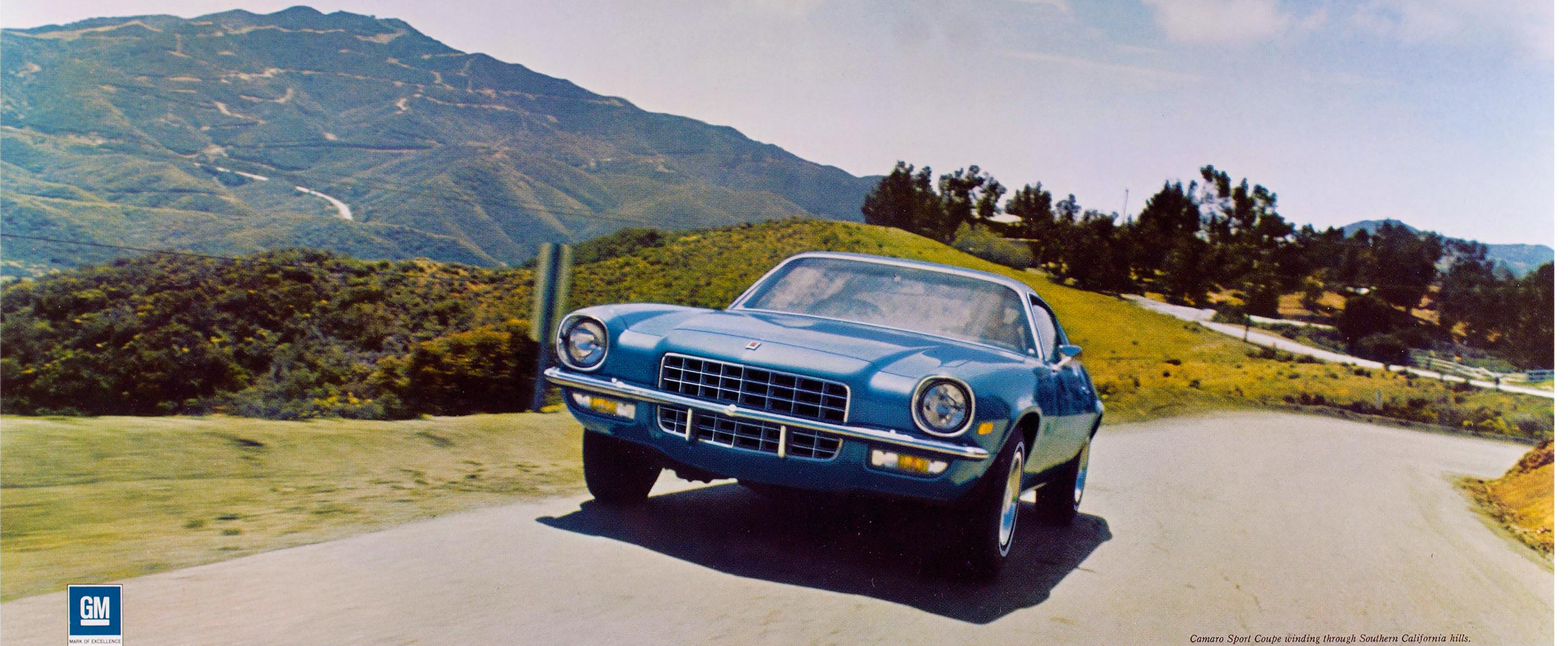
Camaro Sport Coupe winding through Southern California hills.