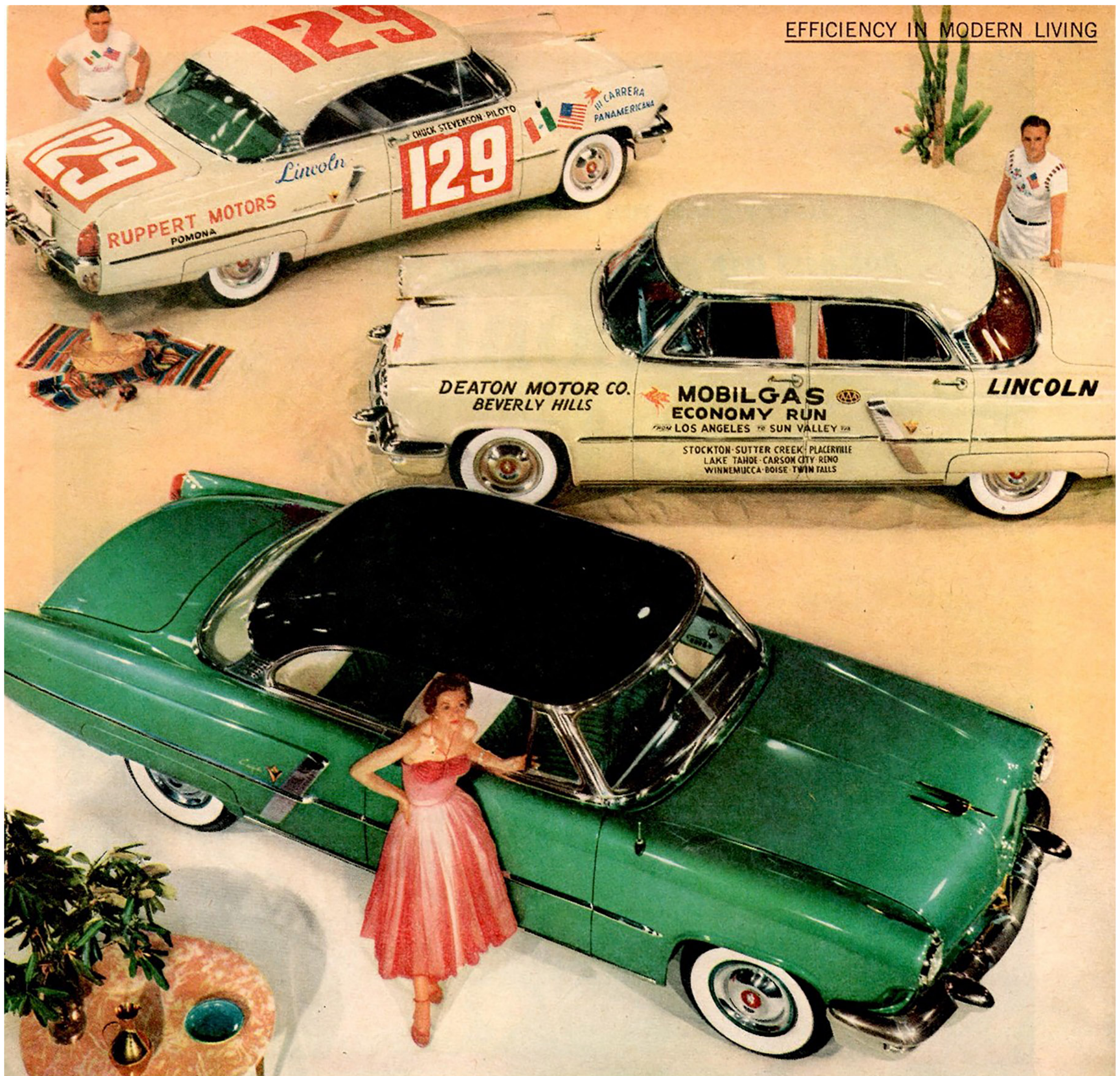
1. First among stock cars in Pan-American Road Race; driver Chuck Stevenson. 2. First among fine cars in Economy Run; driver Clay Smith. 3. Lincoln Capri Special Custom Coupe.