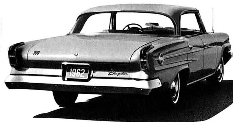
300 FOUR-DOOR HARDTOP combines full-size family room and comfort with hot-blooded 300 performance! All-vinyl interior is optional.

THESE stout new Chryslers let you custom-order the exact combination of performance and luxury you want. Pick from three potent FirePower engines—the FirePower 305, the FirePower 340 or the FirePower 380 (the same that pushes the H!). Choose either bench-type seats in cloth-and-vinyl or all-vinyl—or bucket front seats in genuine hand-rubbed leather. There's a wide variety of other options to choose from, too—including stick shift or pushbutton Torque-Flite transmissions.*