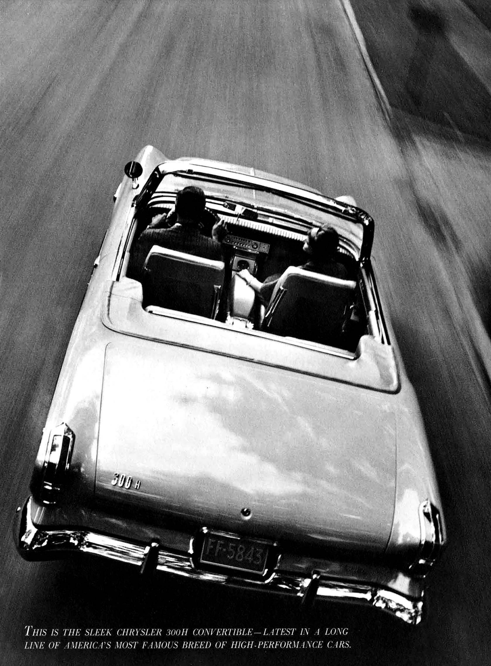
THIS IS THE SLEEK CHRYSLER 300H CONVERTIBLE—LATEST IN A LONG LINE OF AMERICA'S MOST FAMOUS BREED OF HIGH-PERFORMANCE CARS.