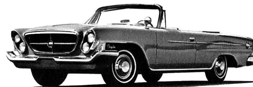
300 CONVERTIBLE features as standard equipment individual bucket seats and center arm rests in front with bucket-style bench seat in rear, all in genuine leather and seating six passengers comfortably.

CHRYSLER PRESENTS THE NEWEST VERSION of AMERICA'S FOREMOST HIGH- PERFORMANCE AUTOMOBILE... THE 300H