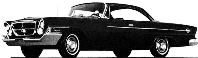
The 300 TWO-DOOR HARDTOP offers the same bucket seat arrangement as the convertible, optional at extra cost.

THESE stout new Chryslers let you custom-order the exact combination of performance and luxury you want. Pick from three potent FirePower engines—the FirePower 305, the FirePower 340 or the FirePower 380 (the same that pushes the H!). Choose either bench-type seats in cloth-and-vinyl or all-vinyl—or bucket front seats in genuine hand-rubbed leather. There's a wide variety of other options to choose from, too—including stick shift or pushbutton Torque-Flite transmissions.*