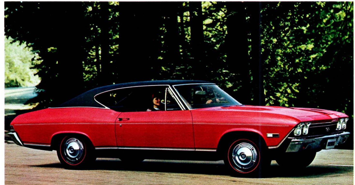
Chevelle SS 396 Sport Coupe. Hide-A-Way windshield wipers are standard for SS 396, Concours and Malibu; can be ordered for other Chevells. Vinyl top can be ordered in black or white.

Standard engine for 6-cyl. Chevrolet models is 155-hp Turbo-Thrift 250. Standard transmission: fully synchronized 3-Speed. You can specify Overdrive, 4-Speed, Powerglide, Turbo Hydra-Matic or Special 3-Speed, depending on engine selected. Easy-care features: self-adjusting Safety-Master brakes; battery-saving Delcotron generator; corrosion-fighting flush-and-dry rocker panels.