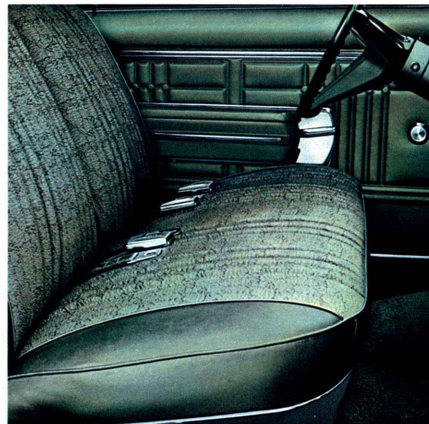
Chevrolet Impala Custom Coupe interior features seat belts for all passengers, deep-twist carpeting and padded safety armrests that shield door handles.