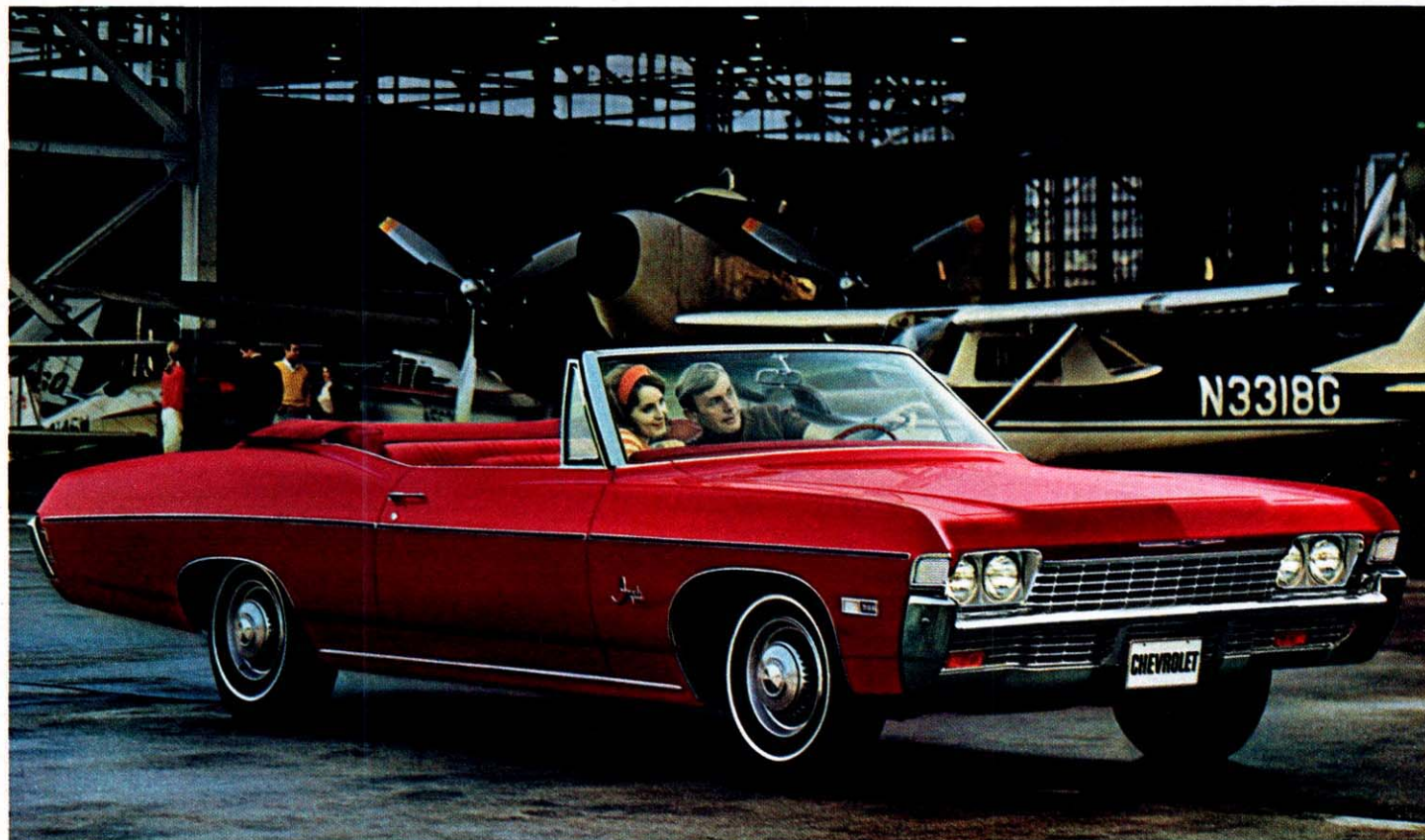
Chevrolet Impala Convertible. Power-operated top with fixed rear glass window is available in black, white or blue. Black vinyl inserts are set in side moldings.

Front Cover: Chevrolet Impala Custom Coupe with black vinyl top you can order. Top also can be ordered in white.