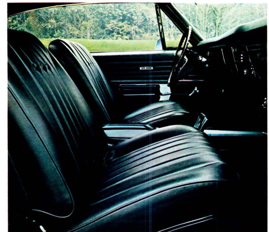
Chevelle SS 396 interior with all-vinyl Strato-bucket front seats and sporty center console you can specify.

You'll judge both SS 396 Sport Coupe and Convertible the best of breed. Exclusive hood says there's a 325-hp Turbo-Jet 396 V8 inside. Special black grille; wide-oval red stripe tires; body side striping. Insides are exceptional, too. All-vinyl trim; lighter; glove compartment light. Make the scene sportier — order Strato-bucket seats plus new center console.