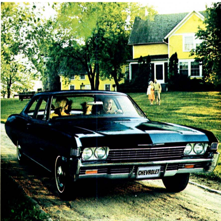
Chevrolet Biscayne 2-Door Sedan is right in stride with its new wide grille and upswept hood that conceals new Hide-A-Way windshield wiper system.

Details of models and extra-cost '68 Options & Custom Features can be found in 1968 Chevrolet, Chevelle and Wagon catalogs at your Chevrolet dealer's.