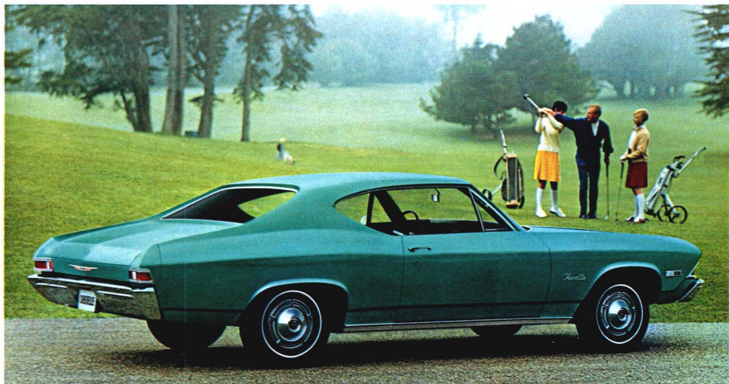
Chevelle 300 Deluxe Sport Coupe shows off new styling and bright trim. Backup lights are integrated in taillight housing.