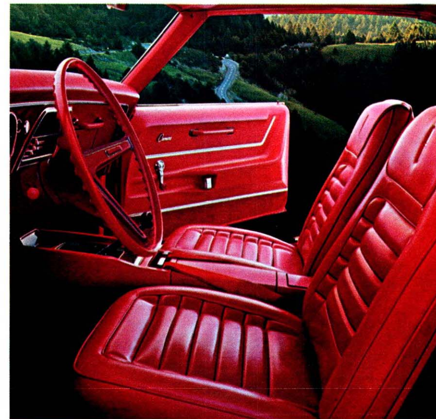
Camaro Custom Interior includes molded vinyl door panels, safety armrests, carpeted scuff panels. Strato-bucket seats are standard. Center console can be ordered.

Camaro innovations for '68 are the kind that only enhance the appearance and performance of sport coupe and convertible. For instance, headlights and parking lights recess in the strikingly new grille which is highlighted by satin-silver horizontal and vertical bars. Very noticeable are the ventless, full-glass curved side windows. New Astro Ventilation — through an ingenious air-flow system — circulates air high and low. Helps isolate you from noise, dirt and rain coming in open windows.