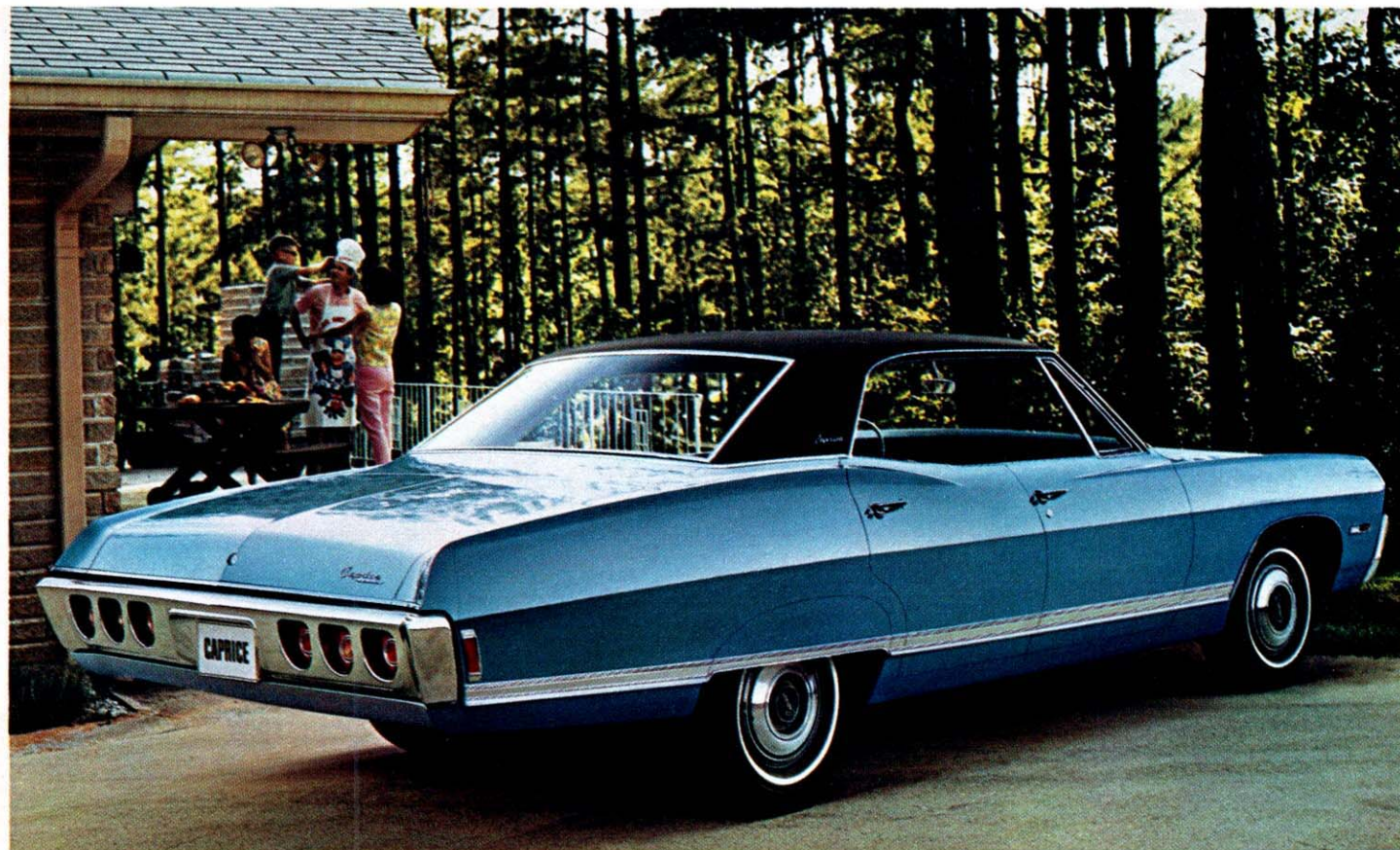
Chevrolet Caprice Sedan features triple taillight cluster—including backup lights—in rear bumper. Vinyl top can be ordered in black or white.