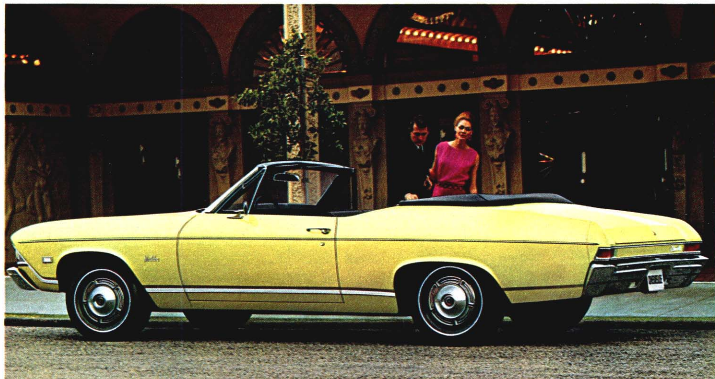
Chevelle Malibu Convertible with new solid glass rear window. Tops are colored black, white or blue.