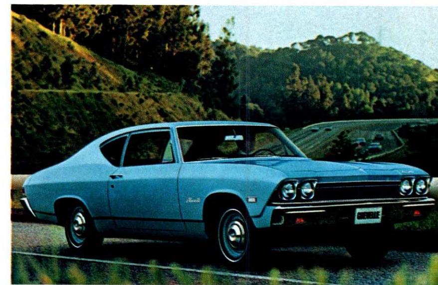
Chevelle 300 Coupe — like all '68 Chevilles — incorporates new body mounting system that isolates road noise and vibration from passenger compartment for a quieter ride.

Nomad 2-Seat Station Wagon, Chevelle's most economical carrier, is as versatile as any—second seat folds flat and flush with cargo deck. Interiors are all vinyl. Also standard: yielding door and window control handles; padded windshield pillars.