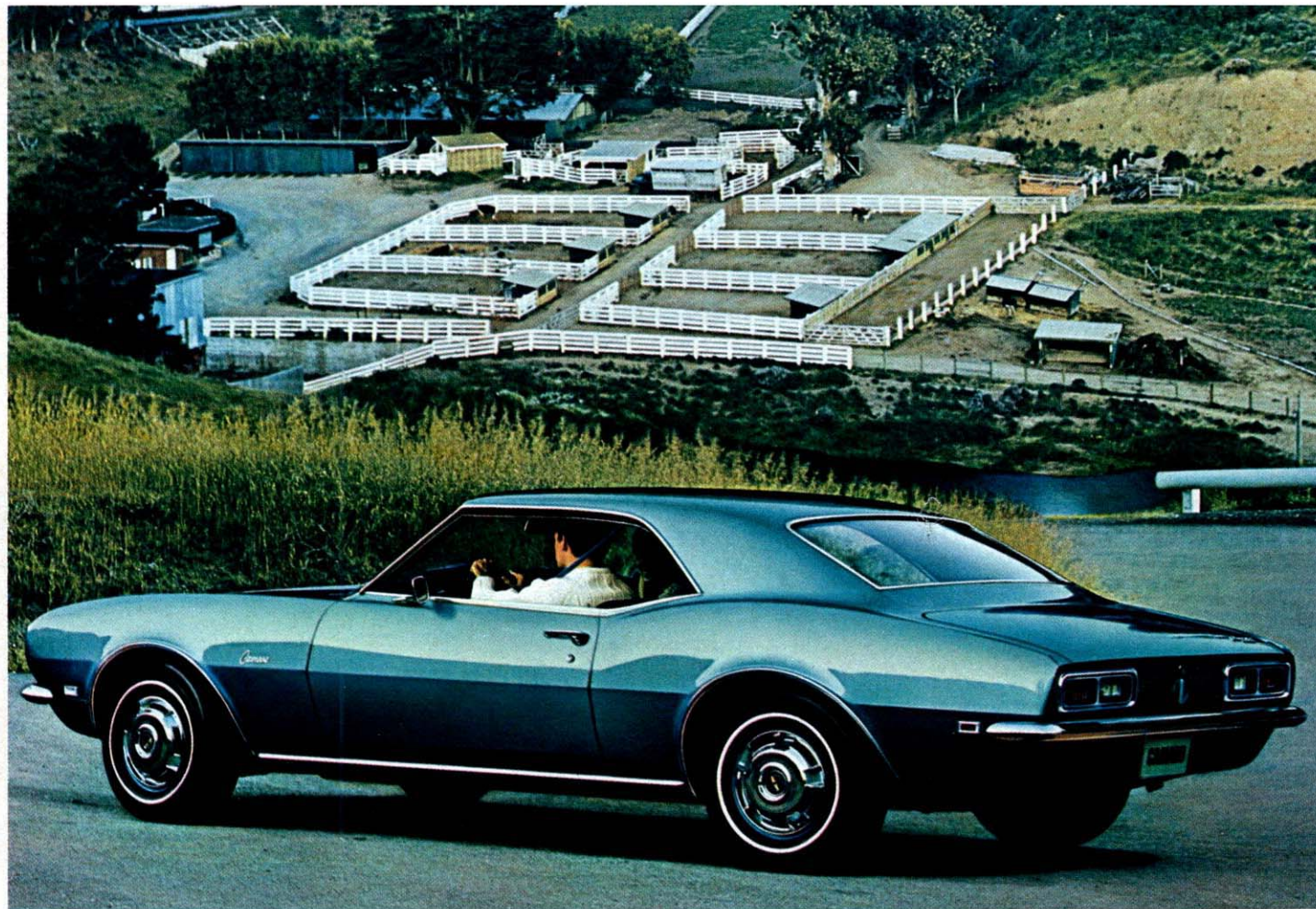
Camaro Sport Coupe with Style Trim Group you can order.