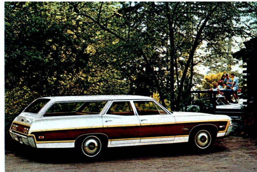
Caprice 3-Seat Estate Wagon with bright wheel opening moldings plus paneling that looks like hand-rubbed walnut.