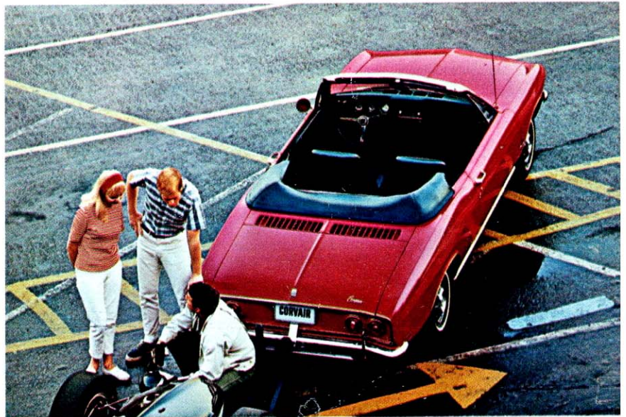
Corvair Monza Convertible. Top available in black, white or blue.

In the cockpit: high-back slim-tapered all-vinyl buckets, Astro Ventilation system, center console and aircraft-style instrumentation including tach, rally clock and fiber-optics light monitoring system. There's removable hard top or folding soft top for convertible. Remember that 4-wheel disc