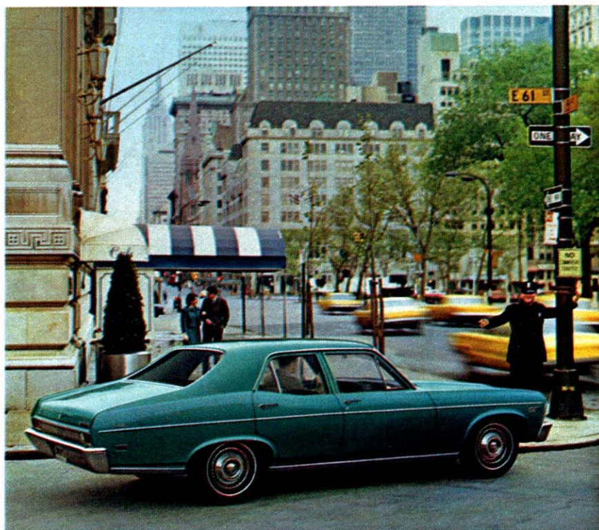
Chevy II Nova 4-Door Sedan seats six. Swept-back roof line, curved side windows and behind-license fuel filler typify hundreds of new '68 features.

Also consider ordering these big-car accessories, now available for Chevy II Nova: stereo tape system; Four-Season air conditioning; special instrumentation; floor-mounted shift lever for standard 3-Speed—with or without center console.