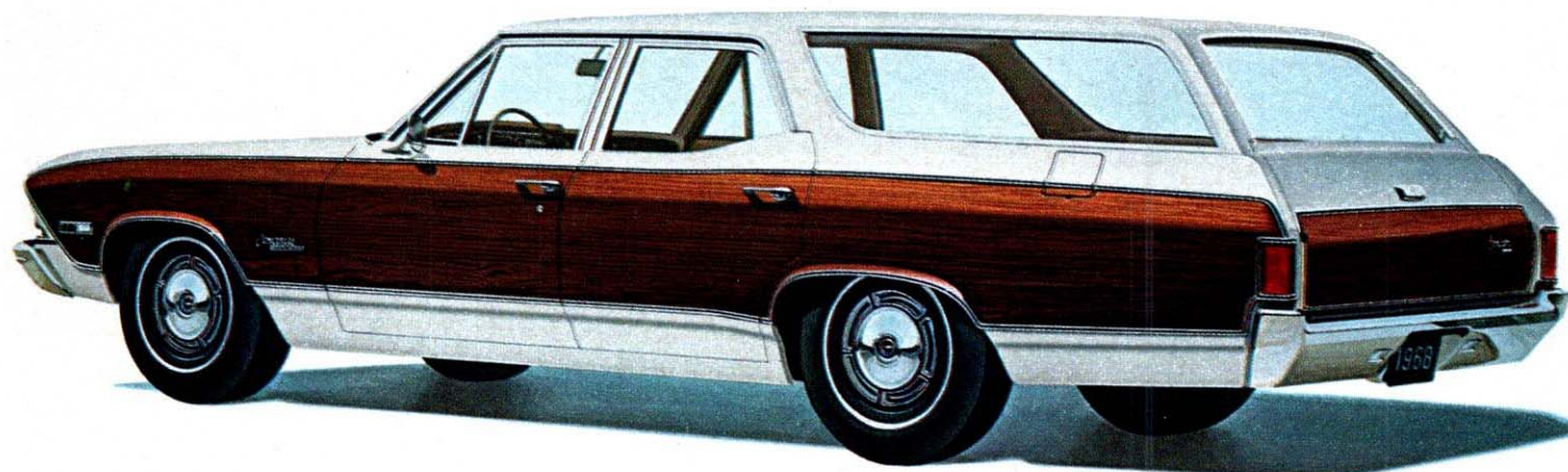
Chevelle Concours 2-Seat Estate Wagon. Walnut-looking panels sweep along sides and across tailgate.

Concours 2- and 3-Seat Estate Wagons let you load up on luxury. New styling, quality appointments and paneling that looks like hand-rubbed walnut provide a beautiful setting for Chevelle's enlarged 94-cu.-ft. total cargo capacity. All-vinyl interiors — in four colors — carry such nice touches as wood-looking trim, extra-thick foam cushioning, lighter and deep-twist carpeting for passenger compartments.