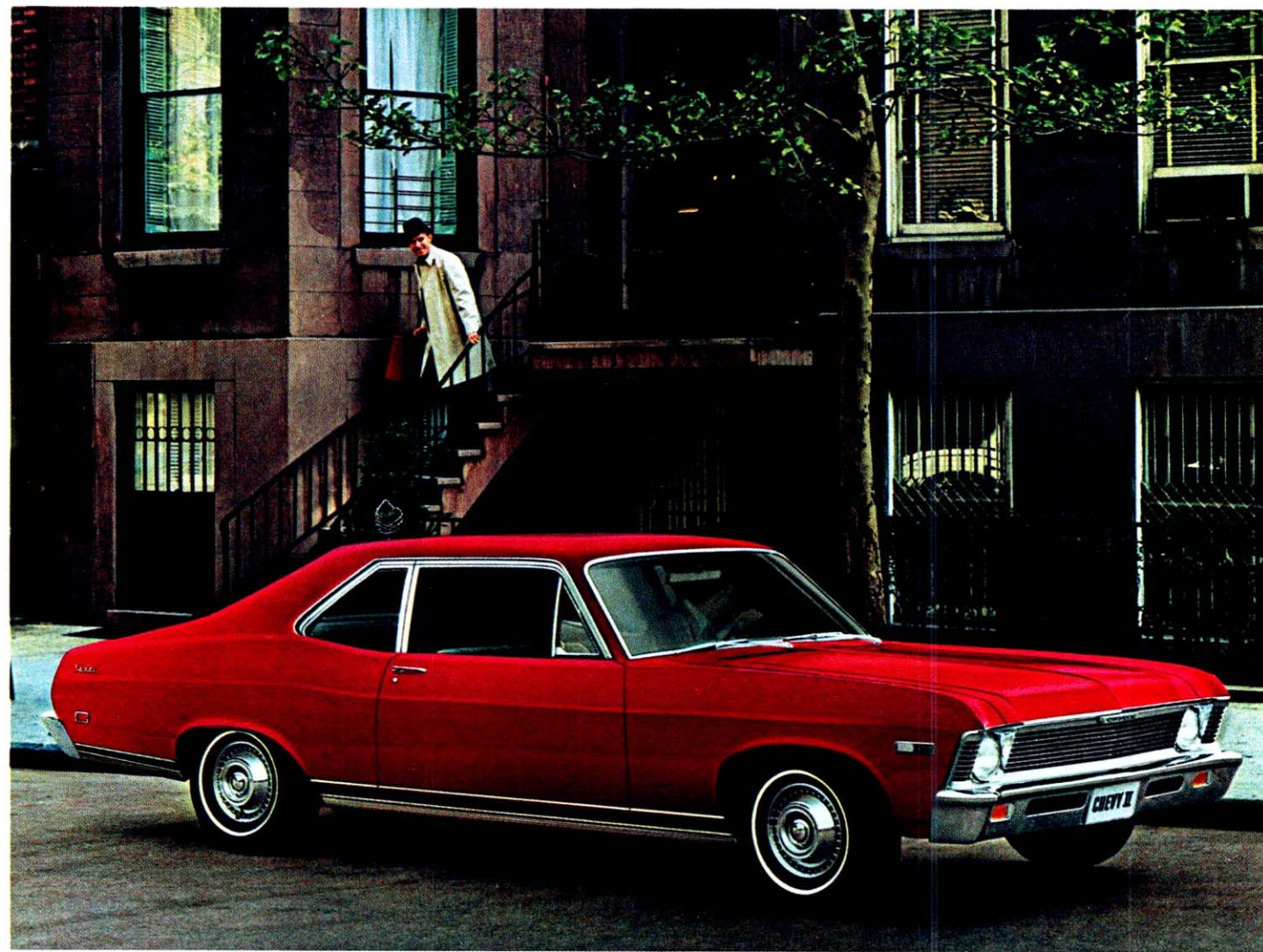
Chevy II Nova Coupe is available in 15 Magic Mirror colors (12 new). Vinyl top can be ordered in white or black for coupe and sedan.