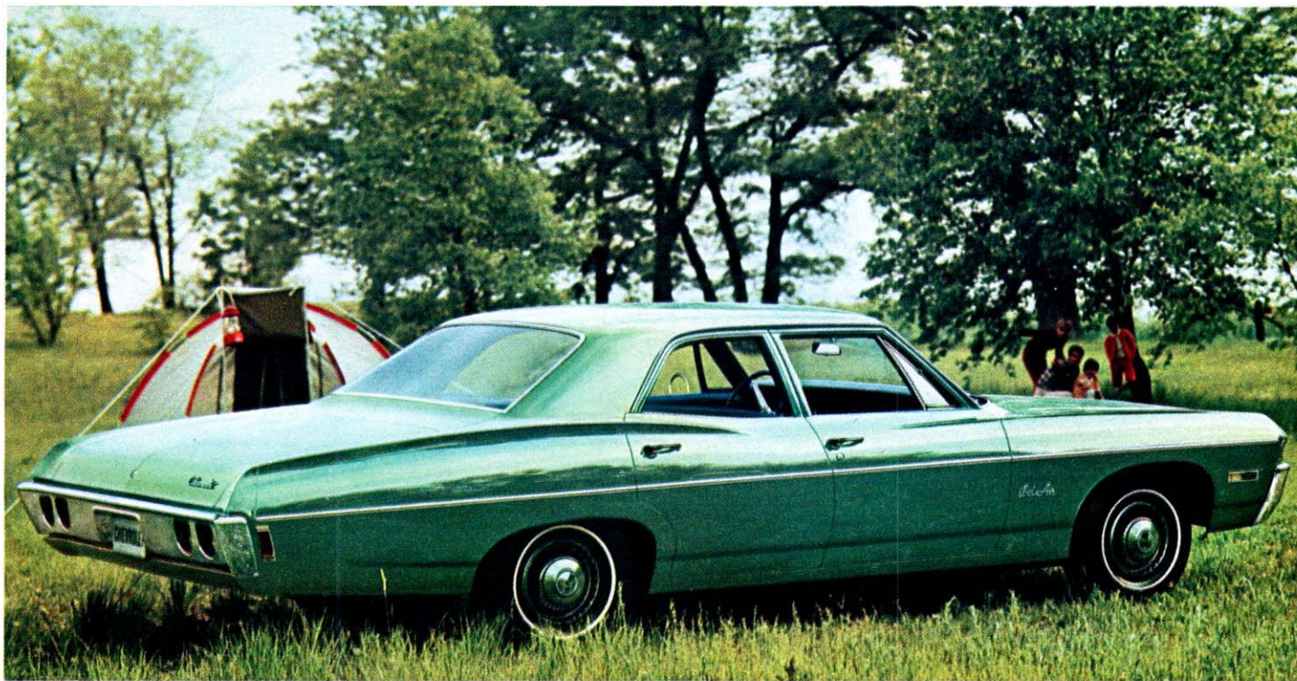
Chevrolet Bel Air 4-Door Sedan with body side molding and dual taillight/backup light assemblies now set in rear bumper.