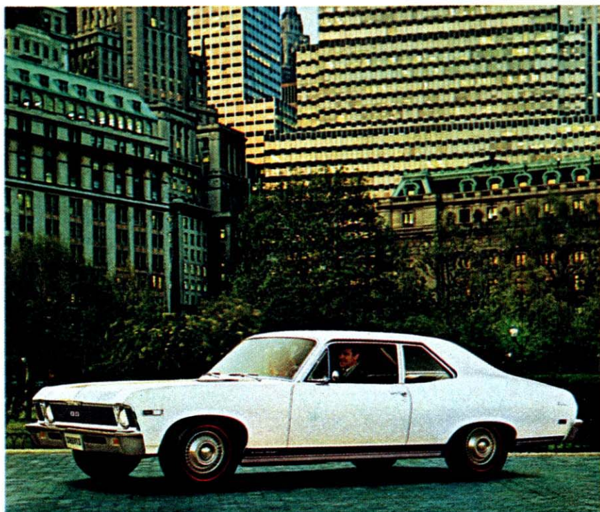
Chevy II Nova Coupe can be ordered with SS package which has 295-hp 350 V8, special chassis components and bold exterior trim.