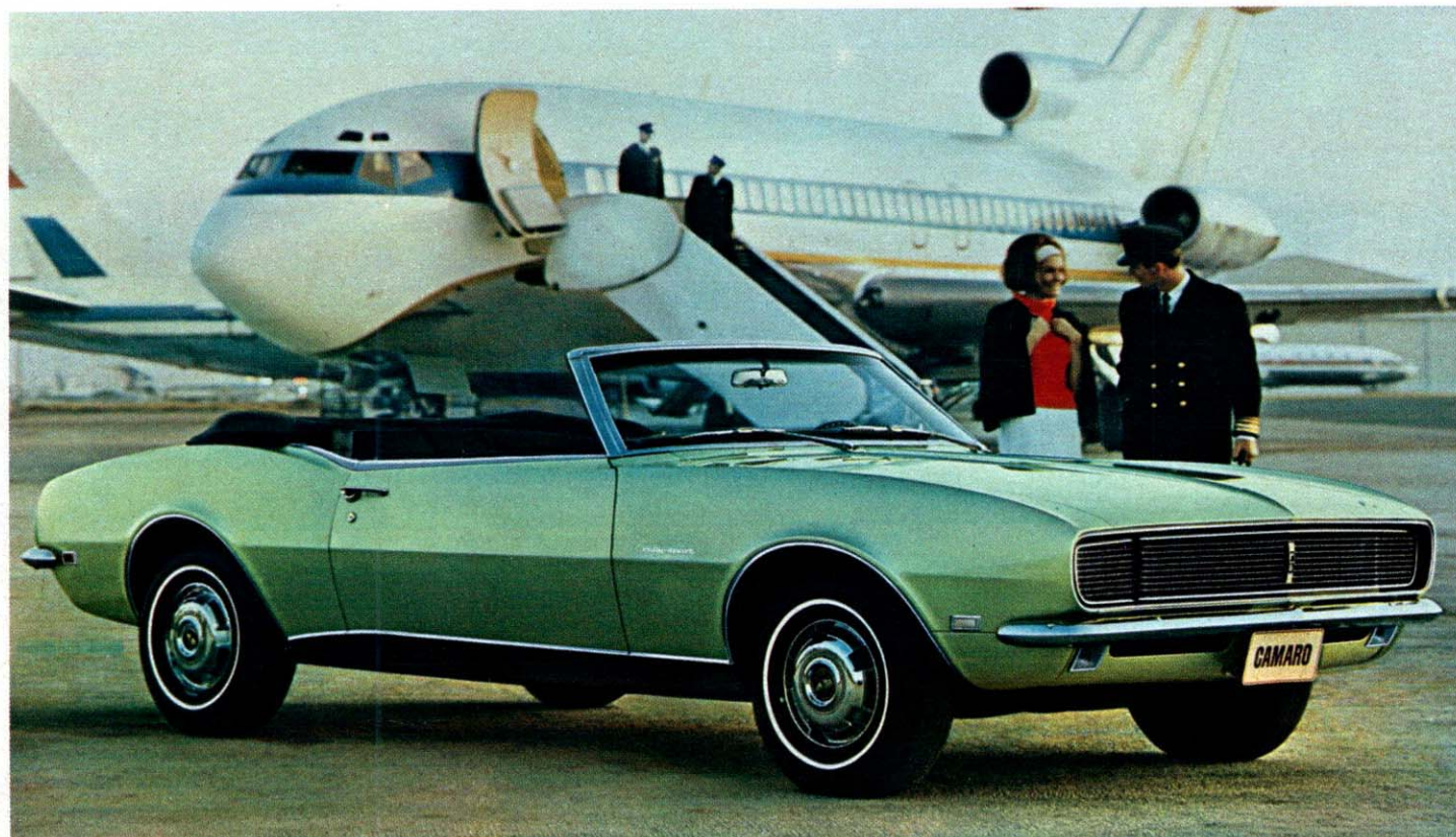
Camaro Convertible can be ordered with Rally Sport package which features headlights concealed behind distinctive grille.