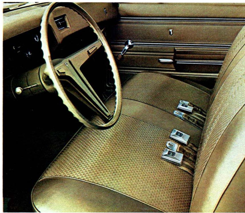
Chevy II Nova Coupe with Custom Interior you can order. Among many features: extra-thick foam front seat and deep-twist carpeting.

The beautiful Body by Fisher adds a new dimension to Chevy II Nova for '68, too. Four inner fenders help protect against corrosion. So do the heavy-gauge flush-and-dry rocker panels. New strength comes from inner and outer body panels, heavy-ribbed and reinforced underbody.