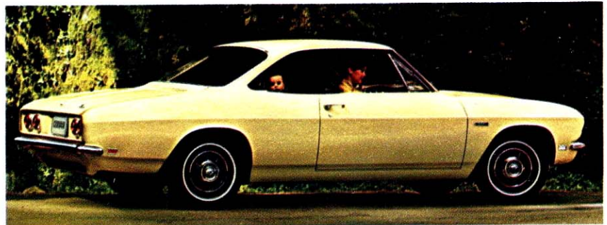
Above: Corvair 500 Sport Coupe has fully independent front and rear coil suspension.