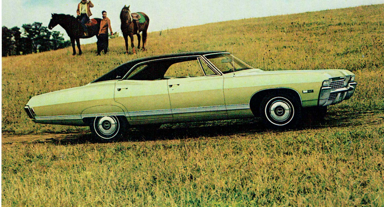
1968 Caprice Sedan

It's the very top of Chevrolet's big car line—looks, feels and behaves it, too. Park it next to an expensive limousine—it comes off looking great! Compares just as well inside, with special Caprice Sedan touches like luxurious fabrics, fold-down center armrest, extra sound insulation, the look of hand-rubbed walnut and more. You can add concealed headlights, stereo tape system and other nice touches. Go ahead. Get into that limousine class at Chevrolet cost with Caprice. The best of two worlds. Be smart. Be sure. Buy now at your Chevrolet dealer's.