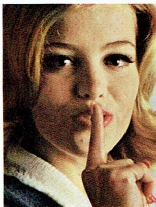
Try the silent ride of quality

A Caprice wagon is to driving what a champagne flight is to flying. First class all the way, in a way no other wagon offers. Luxuriously pleated vinyl on the seats and sidewalls. A control panel with the look of rich-grained walnut. Up to one hundred and six cubic feet of cargo space wrapped in sculptured steel and trimmed distinctively in two contrasting wood-looking grains on side and rear panels. The Caprice Luxury Plan gives you so much more of everything, except the champagne price tag.