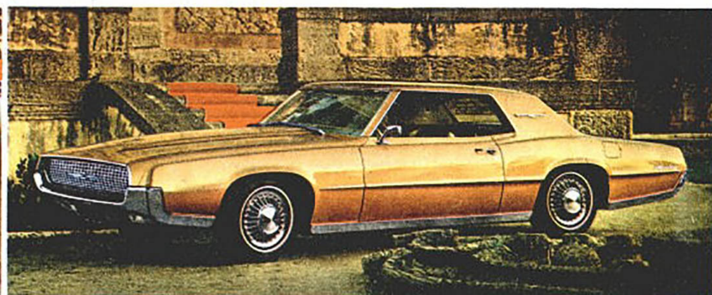
1967 Thunderbird Two-Door Hardtop