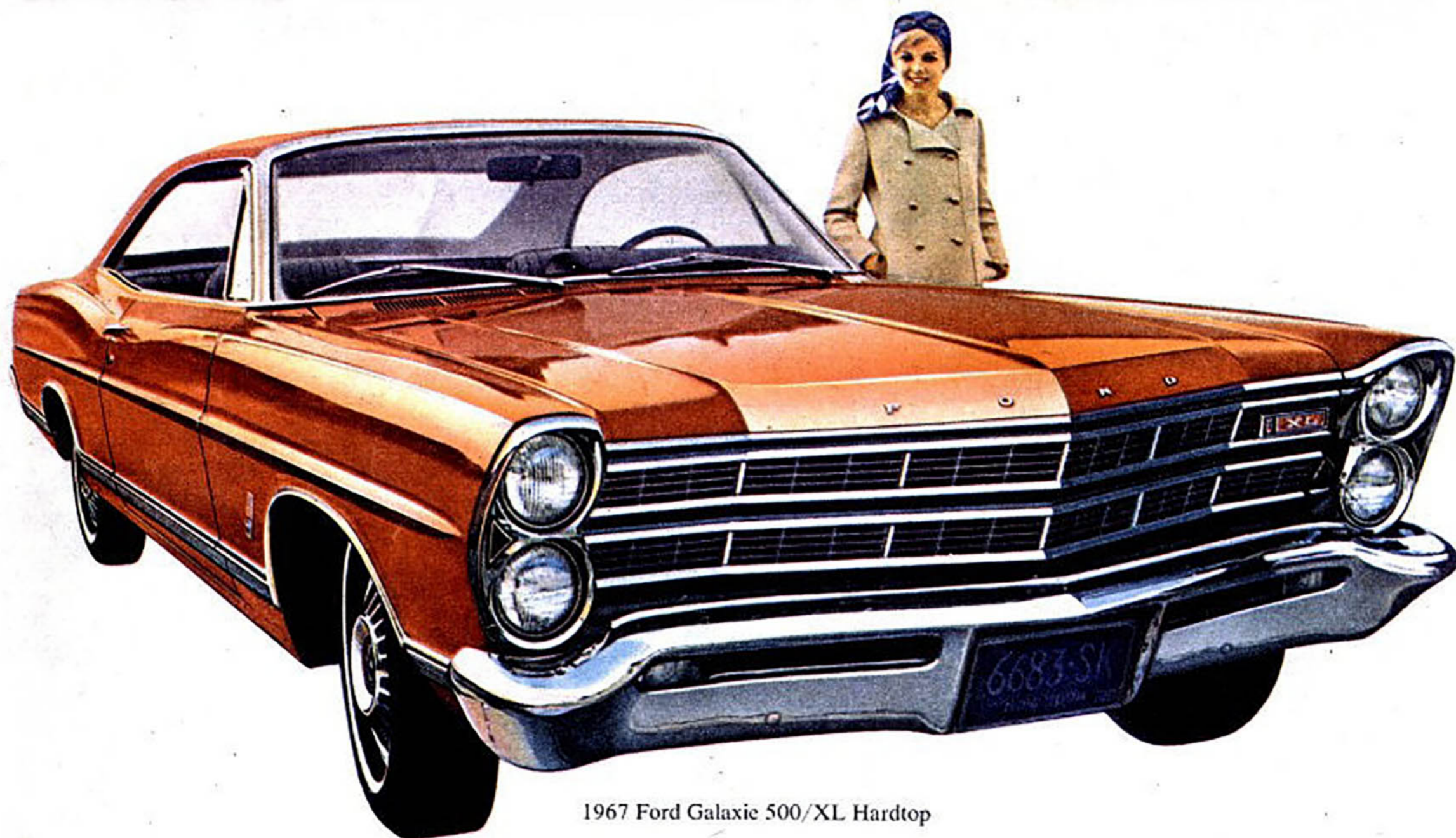
1967 Ford Galaxie 500/XL Hardtop