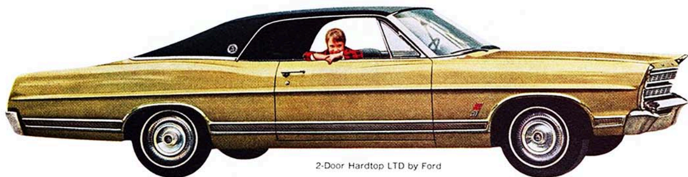
2-Door Hardtop LTD by Ford

(A frog I'm keeping in the glove compartment.)