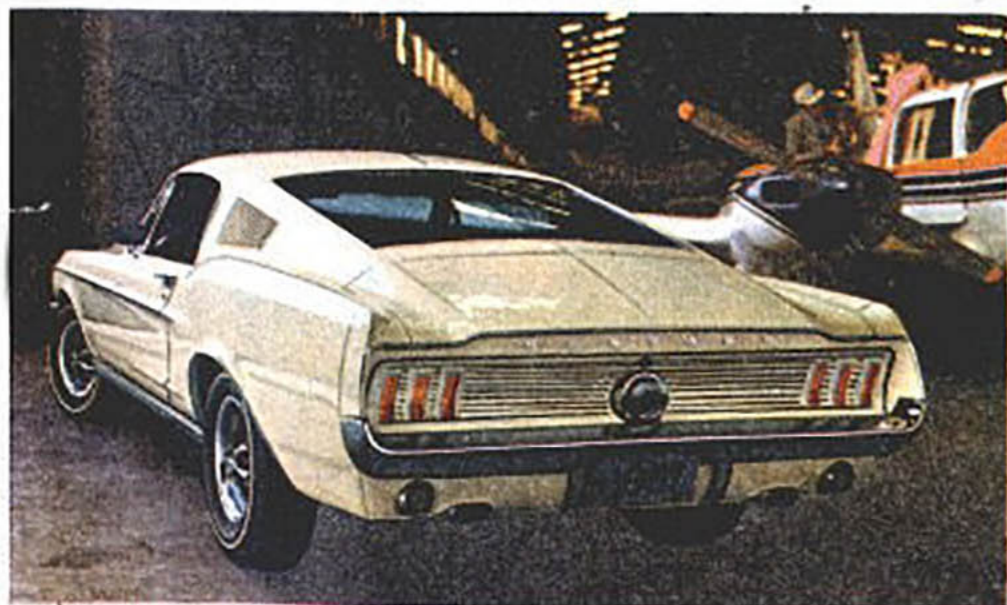
1967 Mustang Fastback 2+2