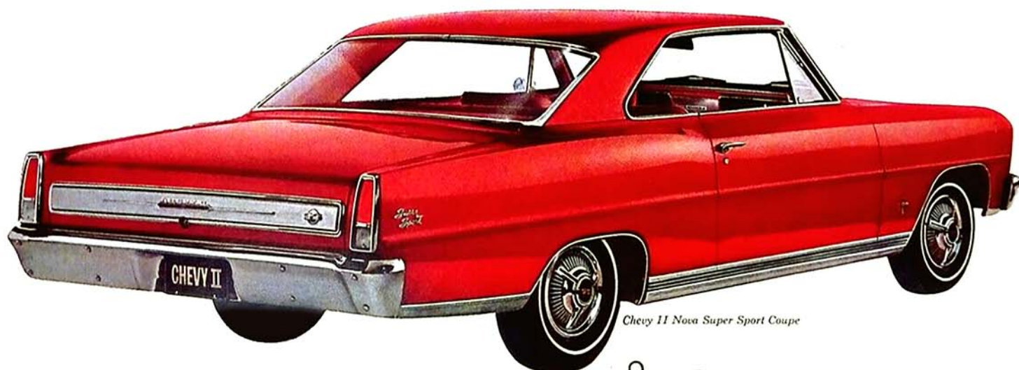
Chevy II Nova Super Sport Coupe

order it with up to 350 hp. See the new Chevy II at your dealer's and see how smart a sensible car can be. . . . Chevrolet Division of General Motors, Detroit, Michigan.