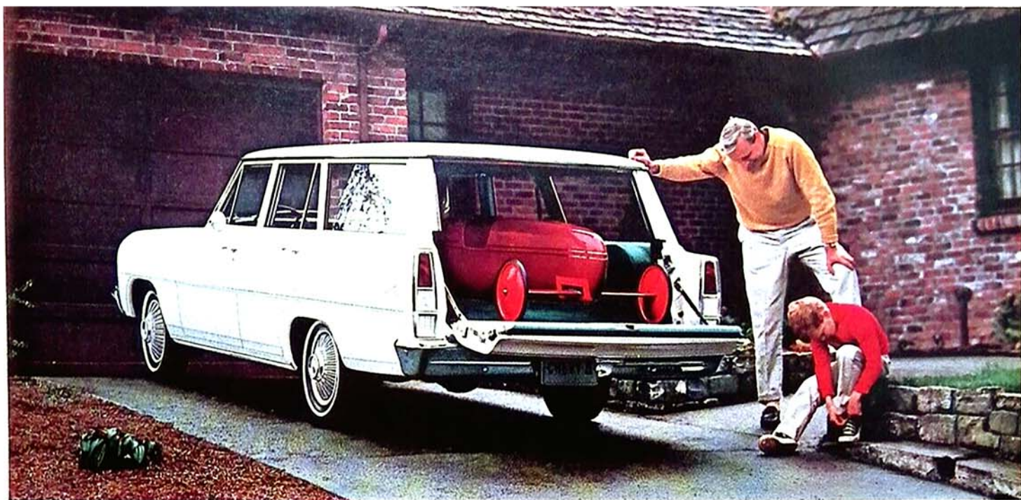
Chevy II Nova Station Wagon