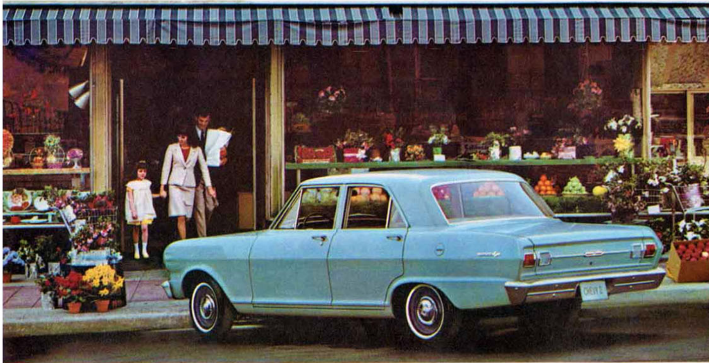
Chevy II 100 4-Door Sedan in Mist Blue