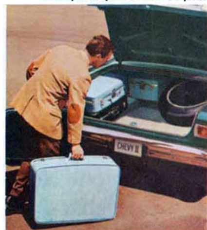
Travel-size luggage space in Nova trunk