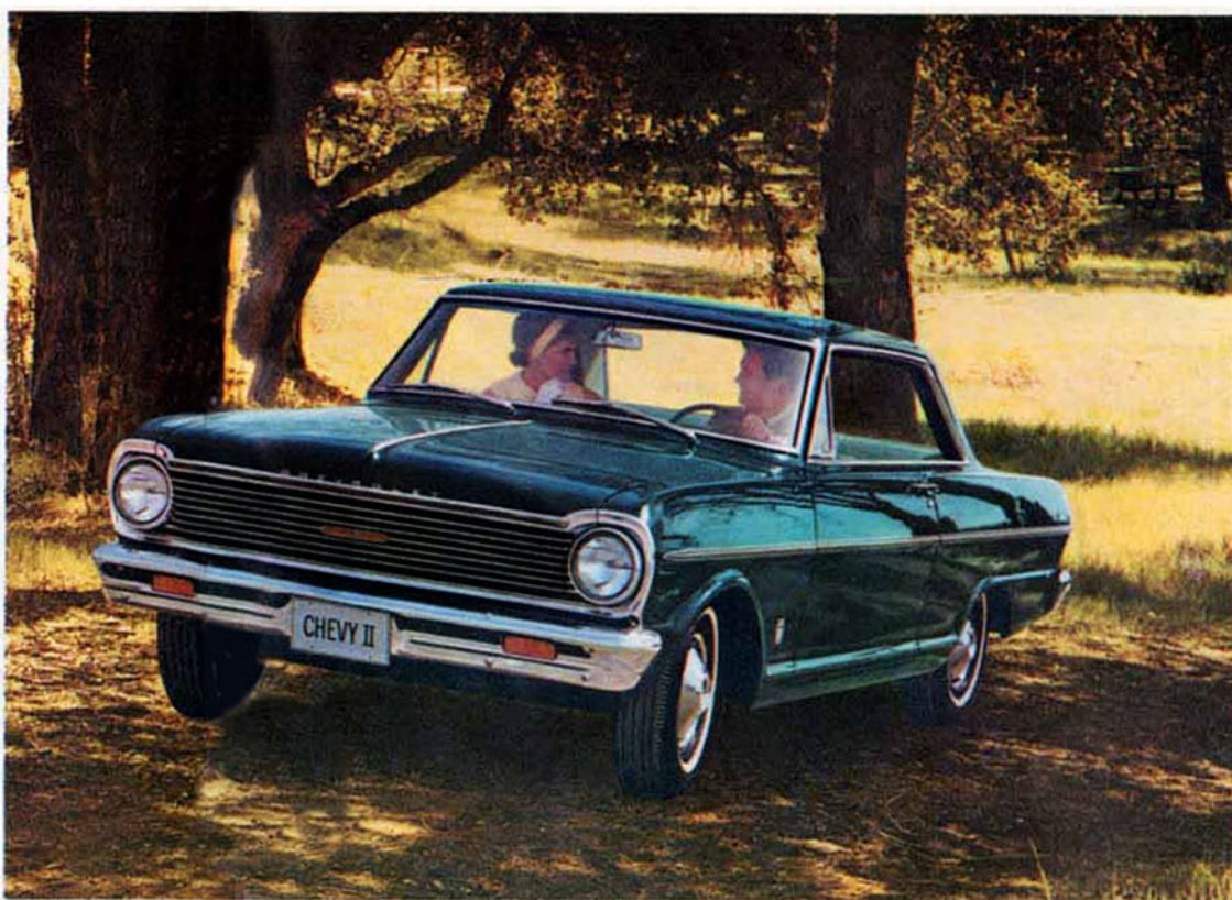
Nova Sport Coupe in Tahitian Turquoise