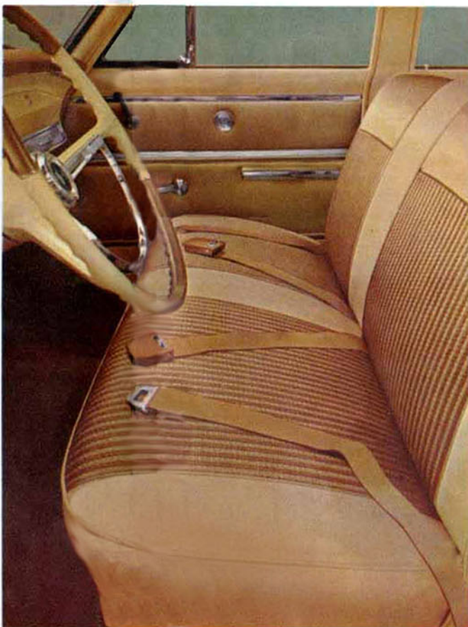
Nova 4-Door Sedan Interior in saddle