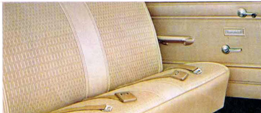
Chevy II 100 2-Door Sedan Interior in fawn