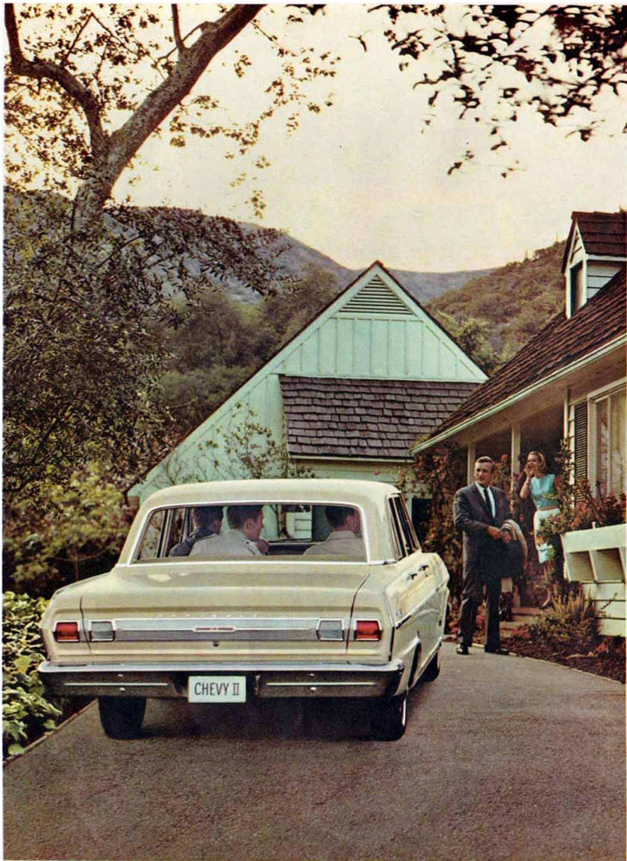
4 Nova 4-Door Sedan in Cameo Beige