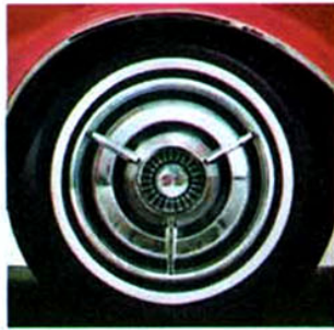
Distinctive Super Sport wheel cover