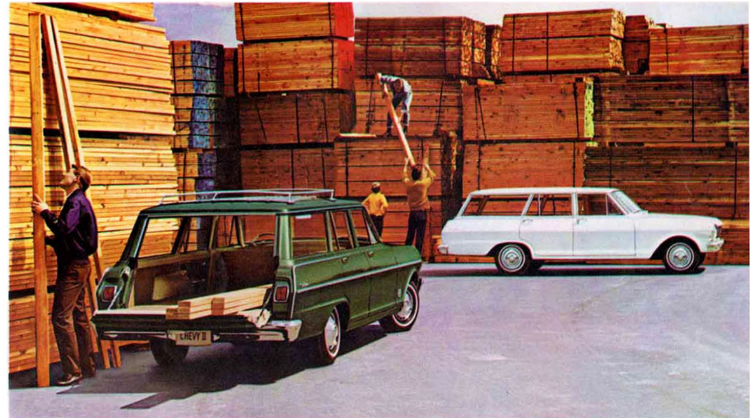
Nova 4-Door 6-Passenger Station Wagon in Cypress Green

Included in the car descriptions and shown in the illustrations throughout this catalog are some of the many Options and Custom Features available for your new Chevy II. They add much to your driving pleasure, yet are moderately priced. A more complete list is on the back cover.