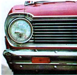
New grille and bumper styling

Smarter than ever—the fashionable new Chevy II for 1965. Smart new styling refinements; outstanding new engine line-up—six kinds of power, including a V8 now standard in a full complement of models. Many new quality features have been added making the new '65 an even greater value buy than before. But the sensible design that has made Chevy II so popular with so many people remains. You still get a roomy, family-size interior. And it's as easy as ever to drive and park. The same easy-care features are back, such as self-adjusting brakes, flush-and-dry rocker panels, Delcotron electrical system and long-life exhaust system. Body by Fisher is still your assurance of extra miles of quiet going in any Chevy II model. And there's the comfortable steady-going ride that Chevy II's exclusive suspension gives. Choose from seven models in Nova Super Sport, Nova and Chevy II 100 series. Any way you look at it, Chevy II is the beautiful shape for '65 .