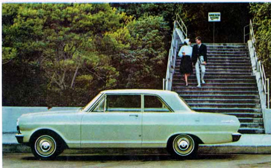
Chevy II 100 2-Door Sedan in Willow Green