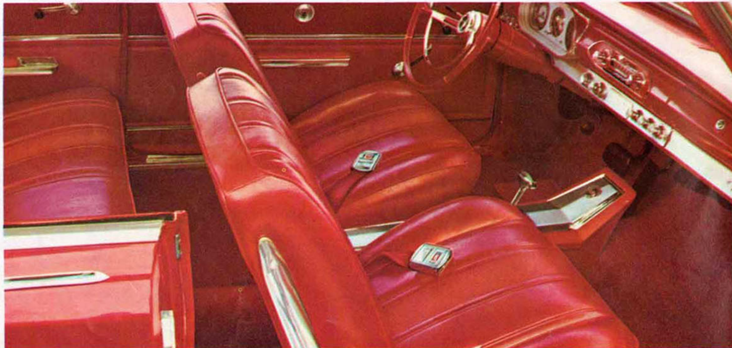
Nova Super Sport Coupe Interior in red