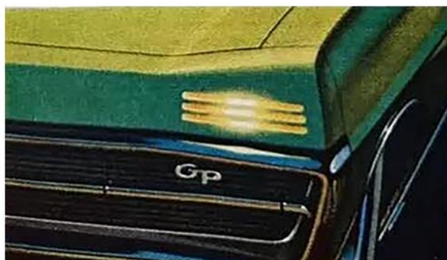
Pontiac Motor Division