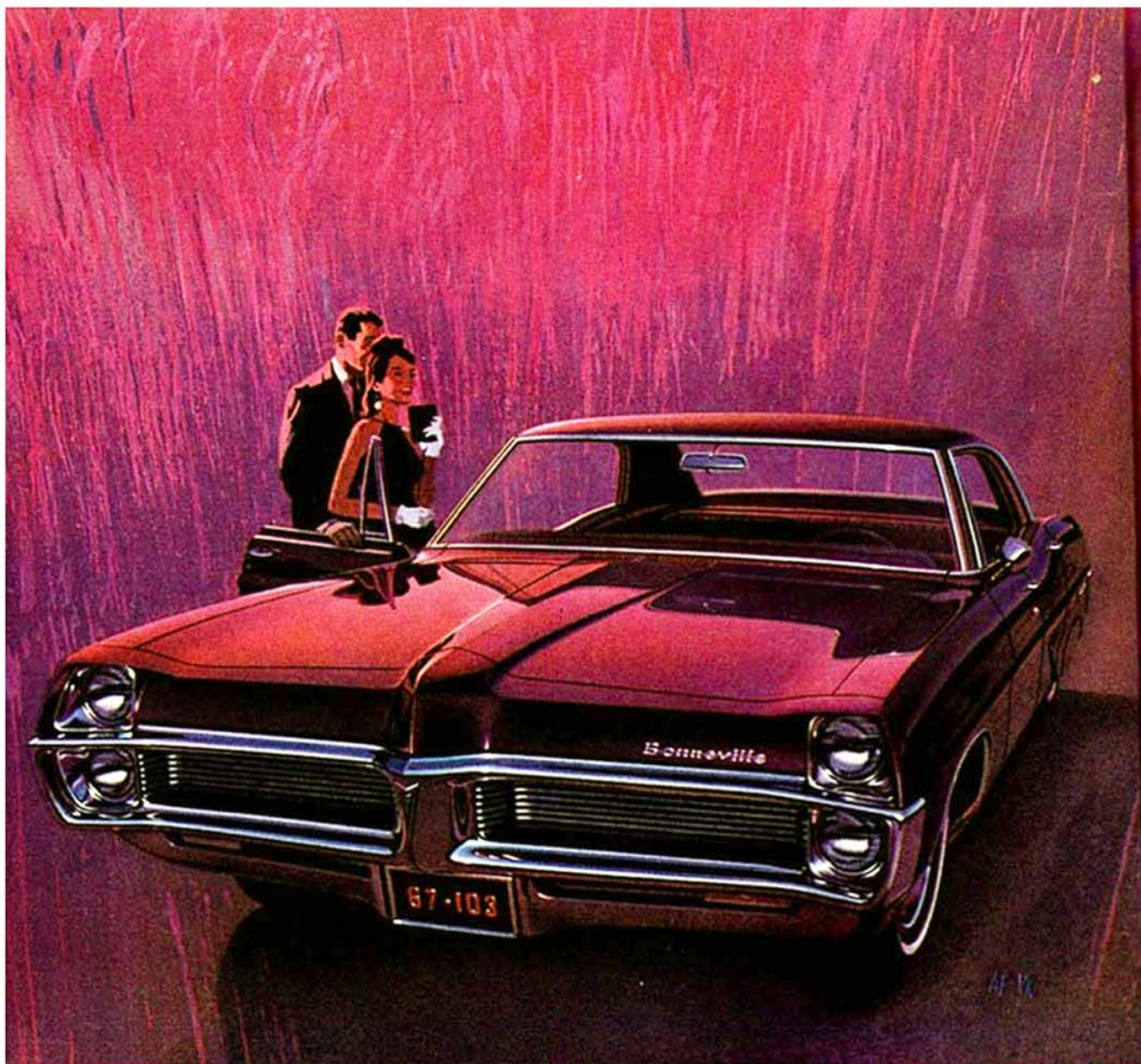
The Bonneville 4-Door Hardtop. Have we done it again? Of course we have!

You're looking at the most beautiful Pontiac ever to ride on Wide-Track. (And we've had nothing but winners.) It's completely new from the distinctive sculpturing of the famous split grille to the slickest engineering innovation in years—disappearing windshield wipers. (They only come out when it rains.) And only Pontiac has them.