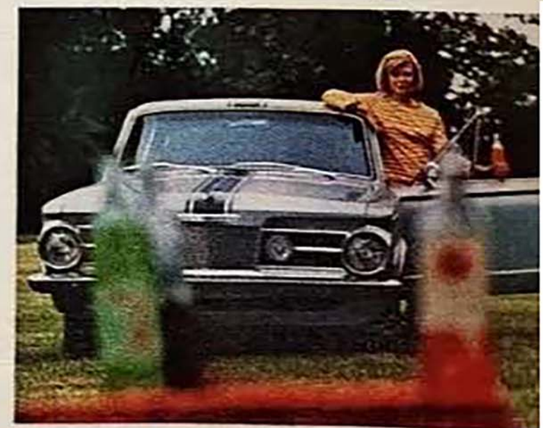
The 1965 Plymouth Barracuda.