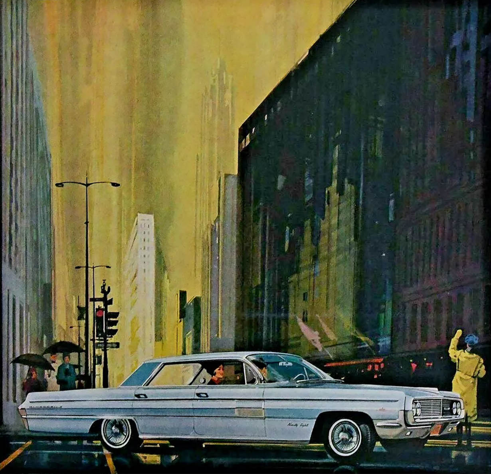
1962 Ninety-Eight Holiday Sports Sedan

Where style comes first...and quality counts!