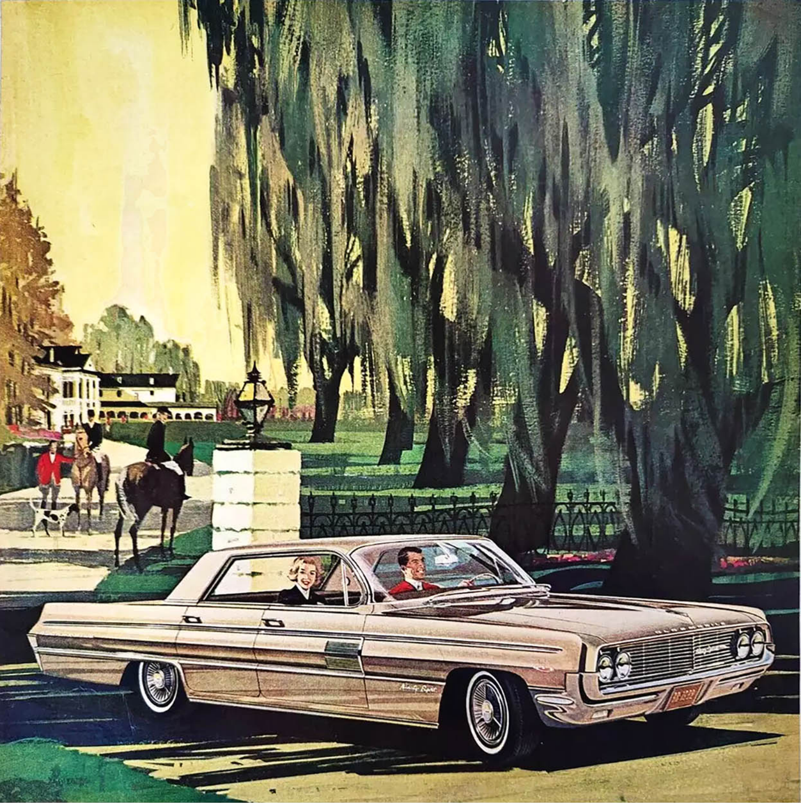
1962 Ninety-Eight Holiday Sports Sedan

New measure of fashion... new concept of reliability!