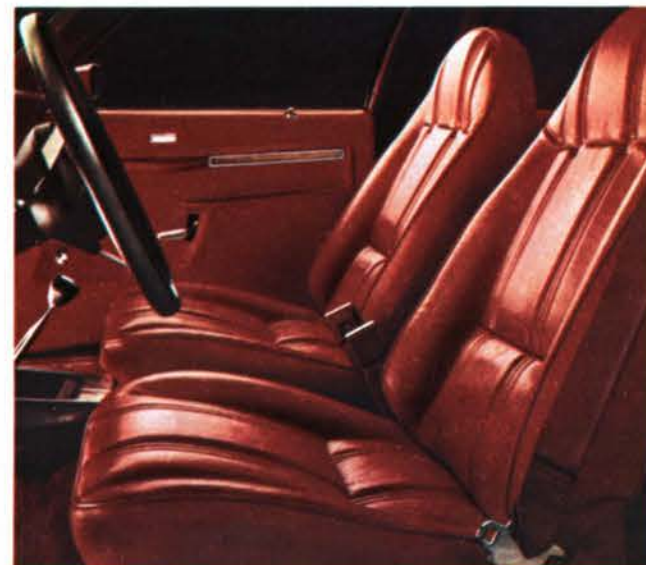
Available all-Morrokide bucket seats. Shown in red—also available in white, saddle and green. Available only in black in 4-Door Sedan.