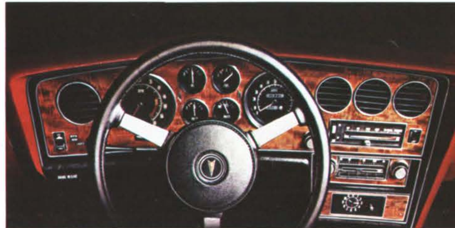
Grand Prix instrument panel. Shown with available rally gauge cluster and Custom Sport wheel.

A lot of people will be very surprised to discover that the 1974 Grand Ville is a Pontiac.