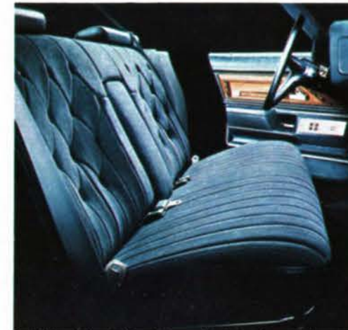
Available cloth and Morrokide notchback bench seat. Shown in blue—also available in green, beige, black and burgundy.