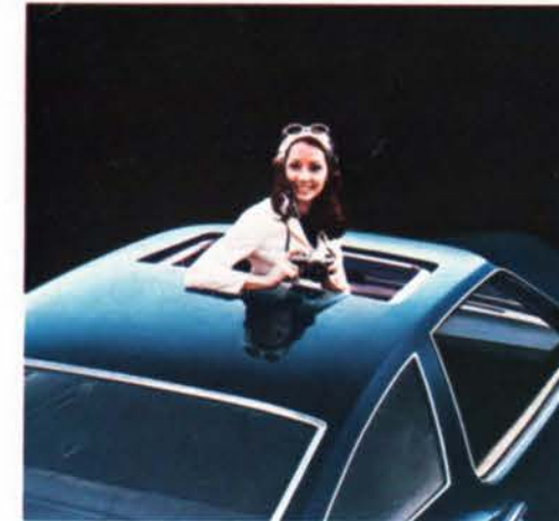
Sunroof available on LeMans 2-Door Hardtops.