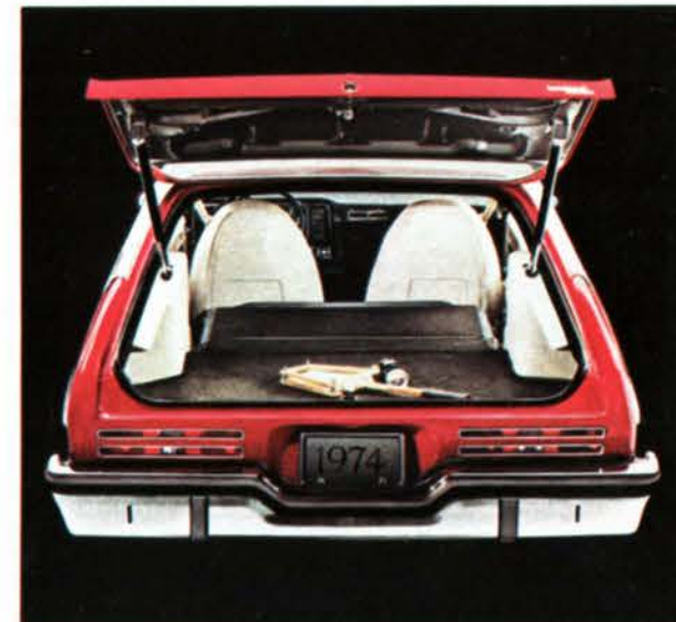
The Ventura Hatchback hatch.

Shown on the cars on these pages are some of the options and accessories offered by Pontiac at extra cost.