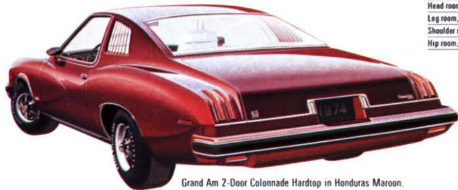
Grand Am 2-Door Colonnade Hardtop in Honduras Maroon.

This year, Pontiac set out to build a mid-sized car that combined the handling characteristics of the finest imports with the smooth ride, styling and performance of a Wide-Track.