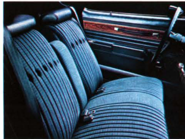
Luxury LeMans cloth and Morrokide notchback bench seat with fold-down center armrest. Shown in blue—also available in green, beige and burgundy.