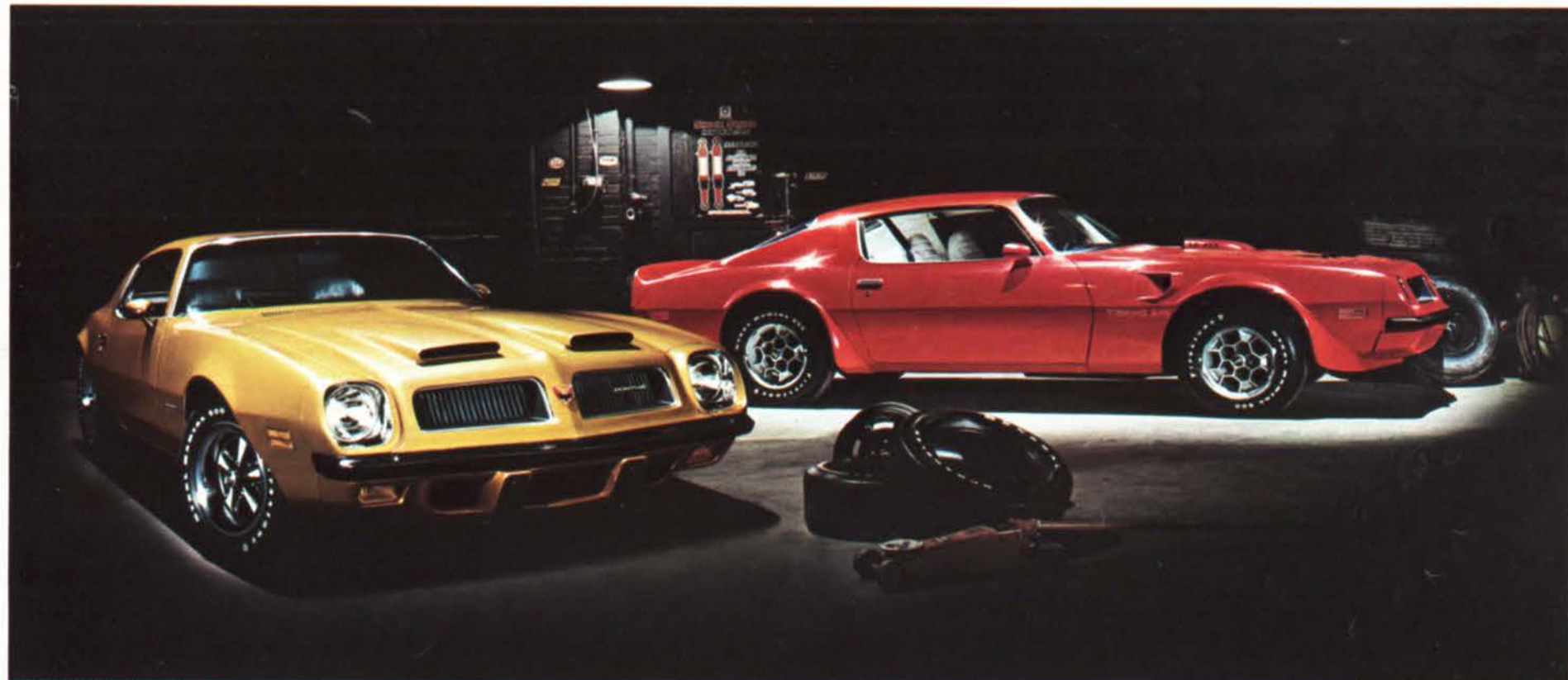
Formula Firebird in Denver Gold.