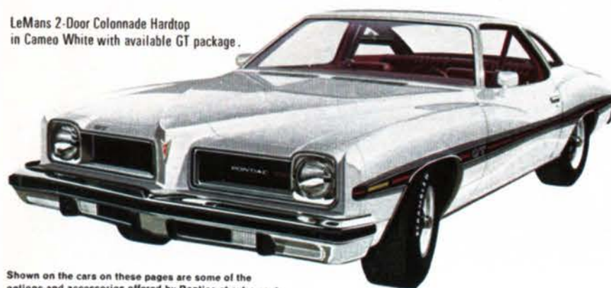
Shown on the cars on these pages are some of the options and accessories offered by Pontiac at extra cost.