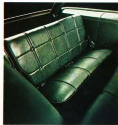
Catalina Safari forward-facing third seat. Shown in green—also available in blue, saddle and burgundy.