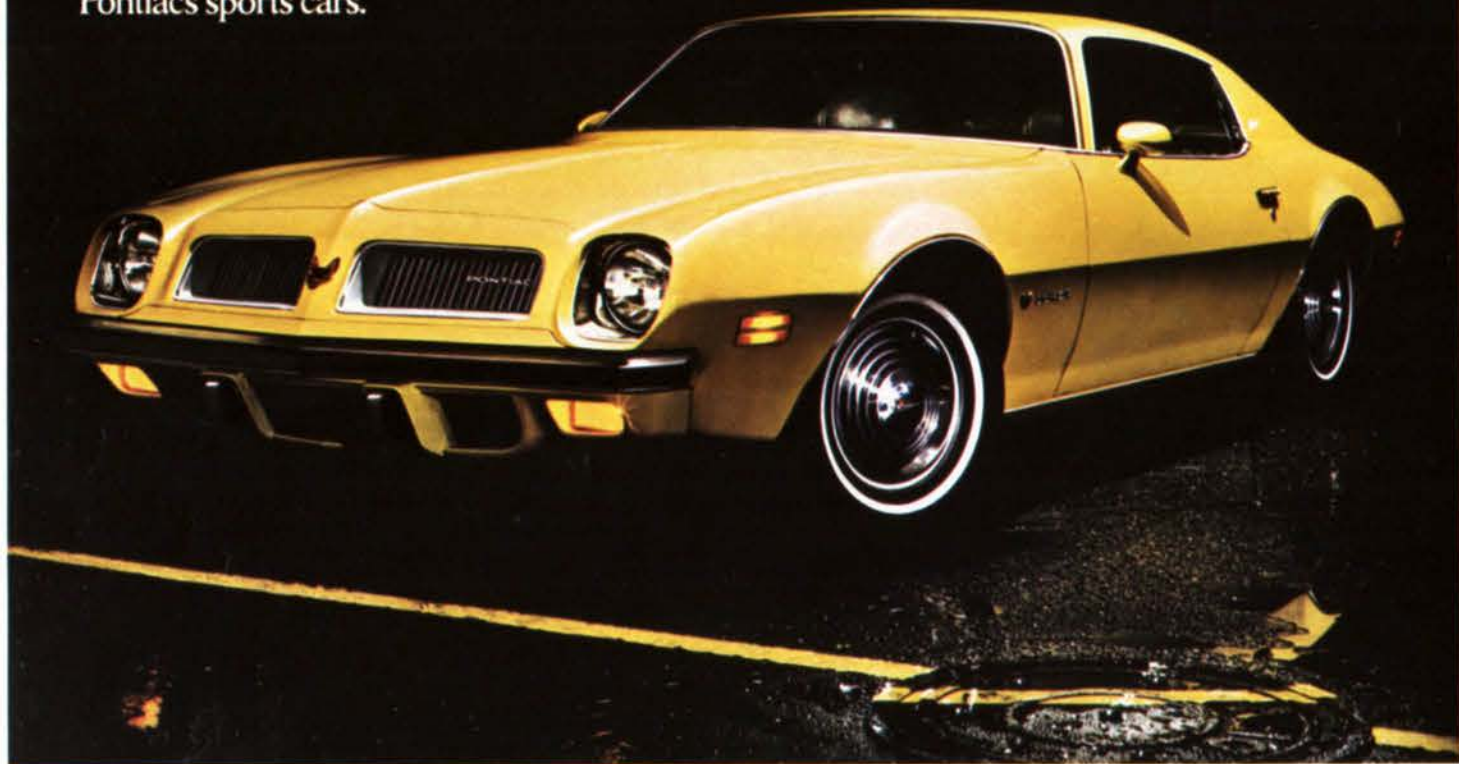
Firebird Esprit in Sunstorm Yellow.