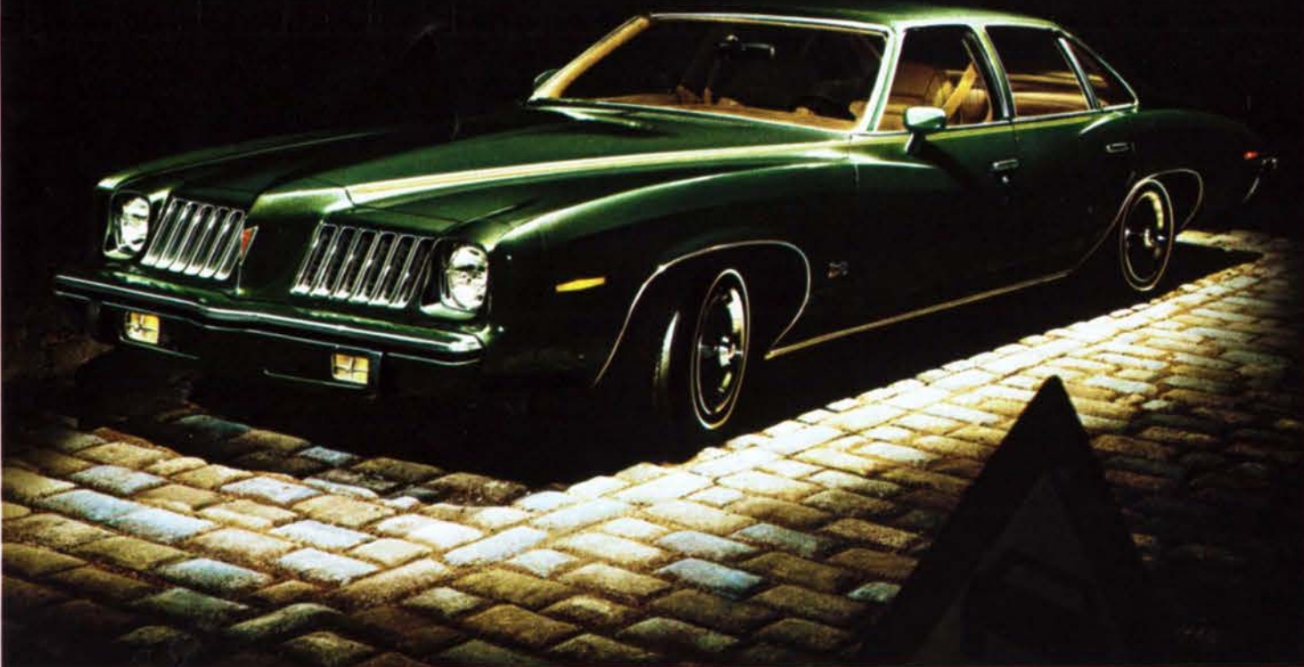
Grand Am 4-Door Colonnade Hardtop in Pinemist Green.

The mid-sized Pontiac with foreign intrigue...American ingenuity.