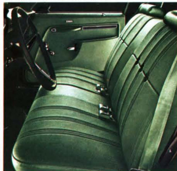
Custom bench seat upholstered in cloth and Morrokide. Shown in green—also available in black. Available only in black in 4-Door Sedan.