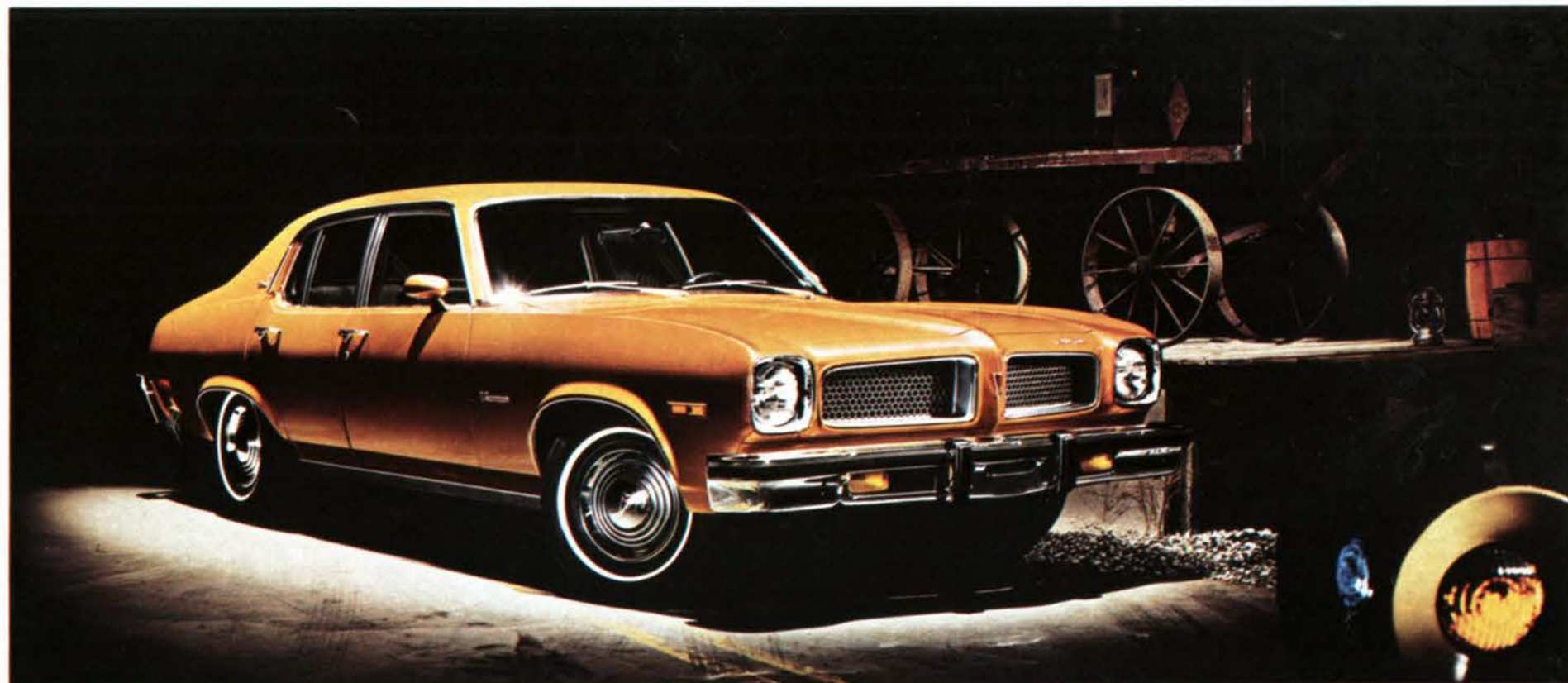
Ventura Custom 4-Door Sedan in Denver Gold.