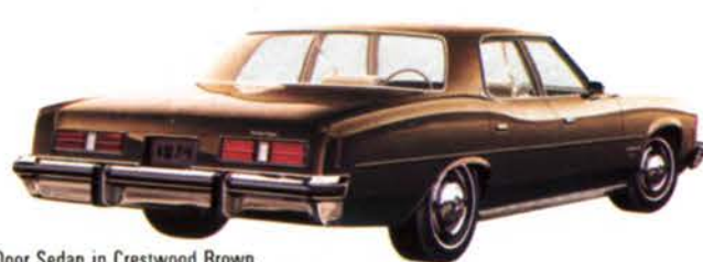
Catalina 4-Door Sedan in Crestwood Brown.