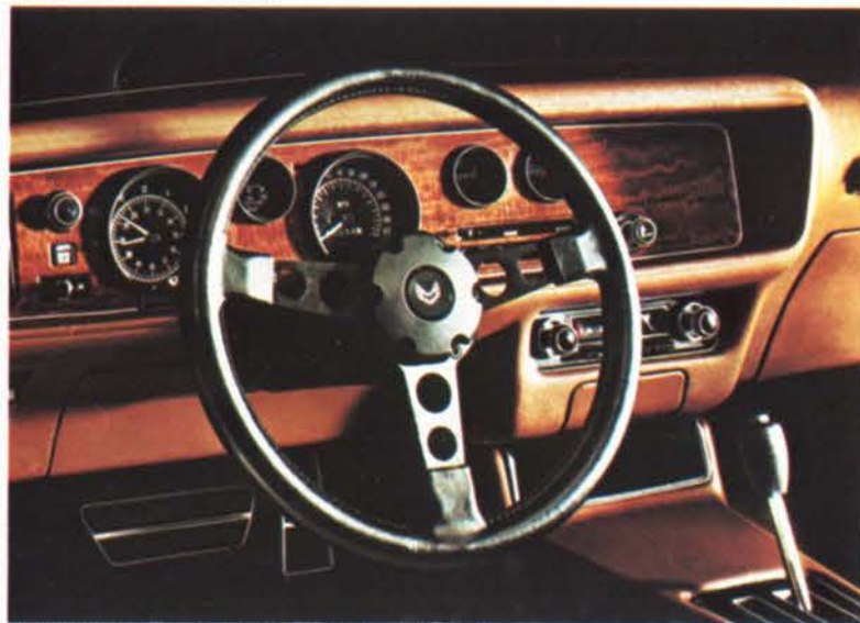
Firebird instrument panel with available Formula wheel and rally gauges.