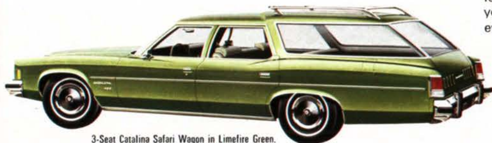
3-Seat Catalina Safari Wagon in Limefire Green.

Grand Safari. Think of it as a Grand Ville with a huge trunk. It has comfort and luxury. Plus the practicality of a station wagon.