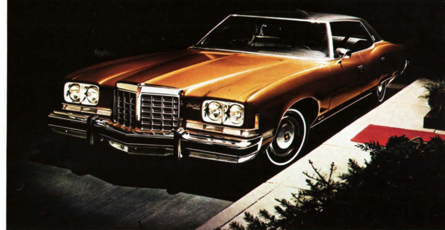
Grand Ville 4-Door Hardtop in Crestwood Brown.

Pontiac's most luxurious full-sized car.