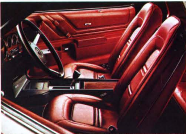
Grand Am's standard all-Morrokide upholstery. Shown in burgundy—also available in white, saddle, green and beige.