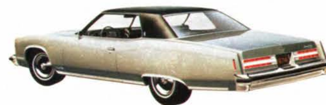
Grand Ville Hardtop Coupe in Ascot Silver.

Shown on the cars on these pages are some of the options and accessories offered by Pontiac at extra cost.