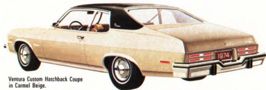
Ventura Custom Hatchback Coupe in Carmel Beige.