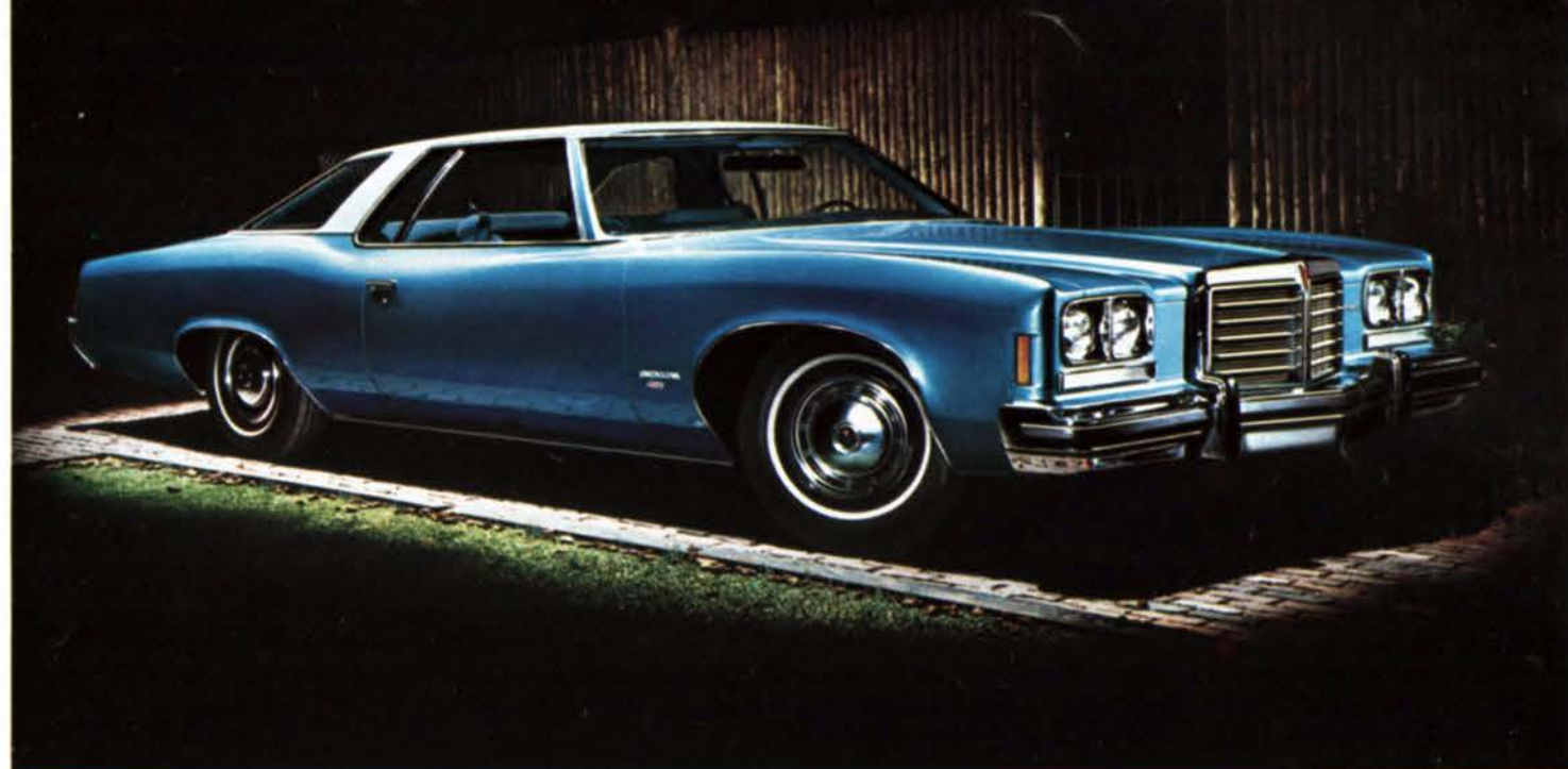
Catalina Hardtop Coupe in Regatta Blue.