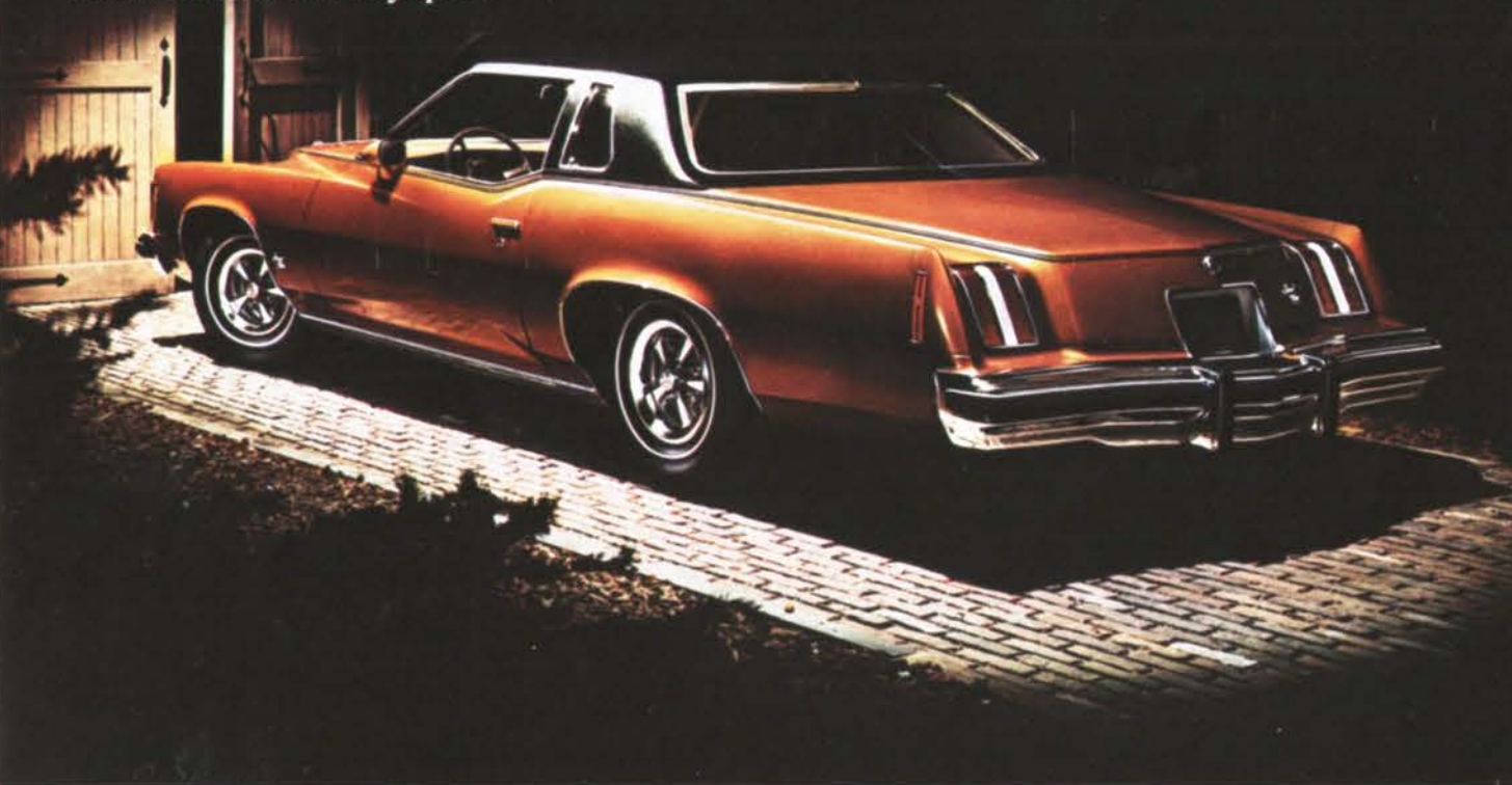
Grand Prix Hardtop Coupe in Fire Coral Bronze.

Grand Prix has a reputation for being a car that's uncompromised . . . strictly first class.