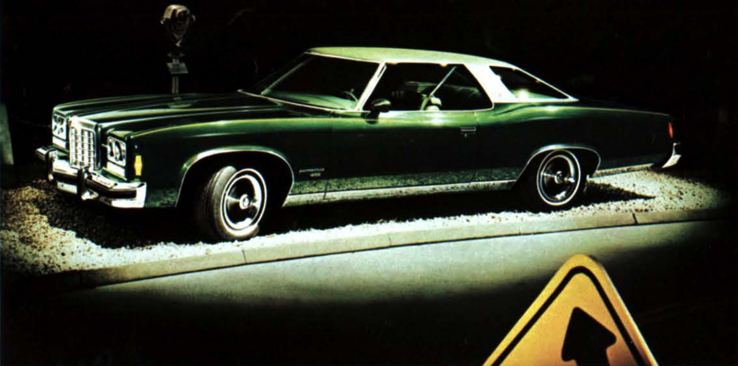
Bonneville Hardtop Coupe in Pinemist Green.

Pontiac's original full-sized Wide-Track.