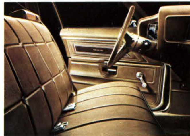
Catalina's available all-Morrokide upholstery. Shown in saddle—also available in blue, white, green, burgundy and beige.