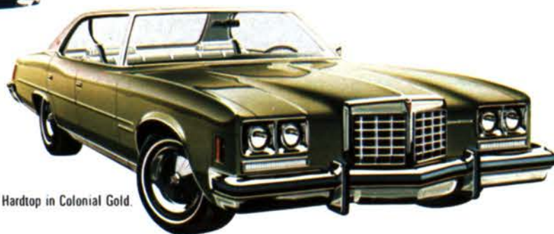
Bonneville 4-Door Hardtop in Colonial Gold.

Bonneville is a big comfortable car. But it's a very special big comfortable car. Because of the way it handles a road.