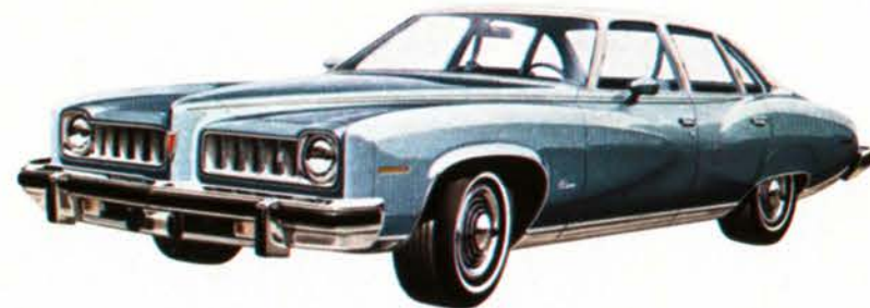
Luxury LeMans 4-Door Colonnade Hardtop in Porcelain Blue.