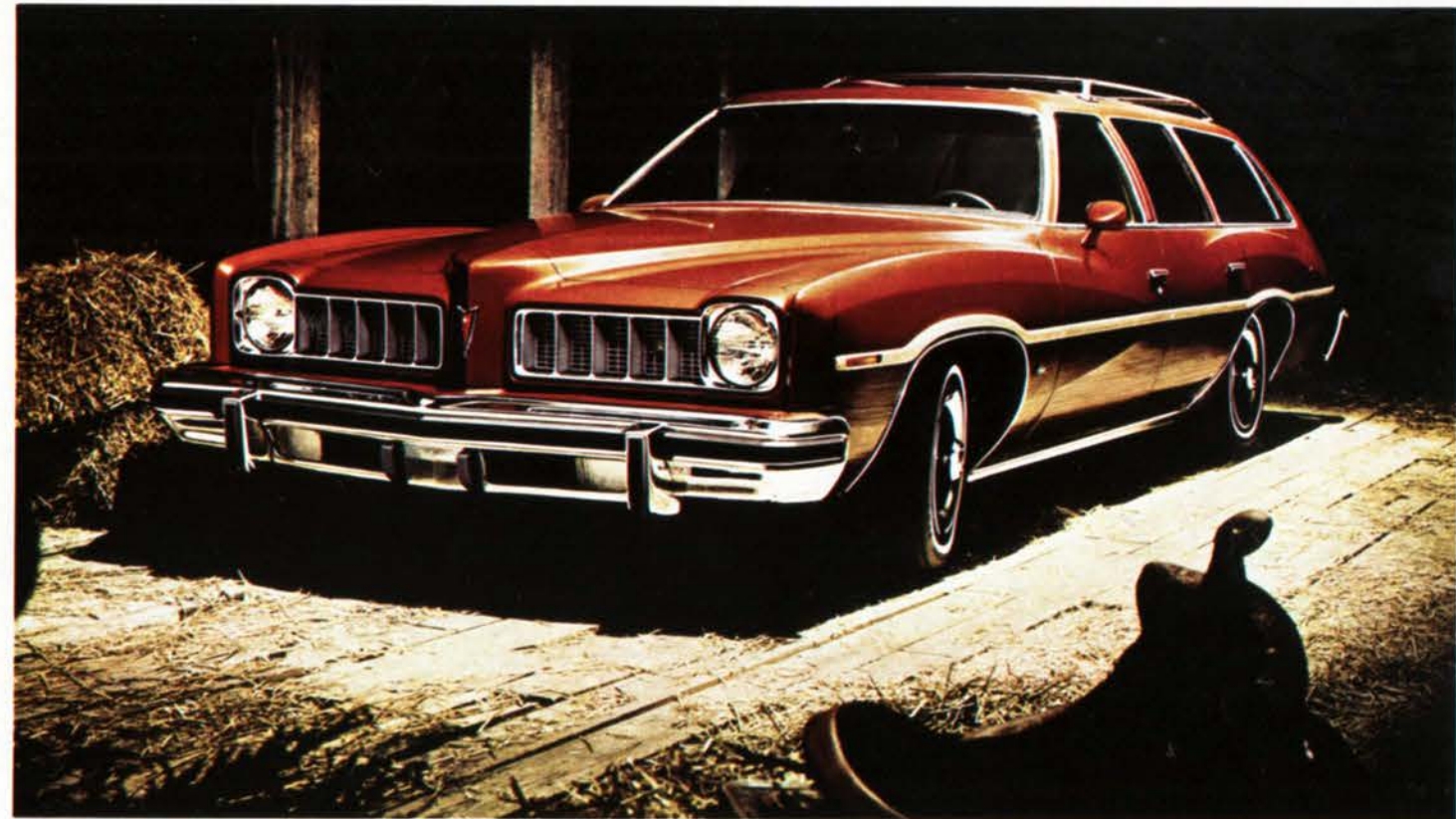
2-Seat Luxury LeMans Safari in Fire Coral Bronze.

'74 Luxury LeMans Safari. '74 LeMans Safari. Whether you like them plain or fancy, Pontiac has a great mid-sized wagon for you.