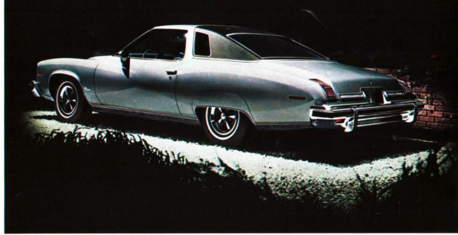
Luxury LeMans 2-Door Colonnade Hardtop in Ascot Silver.