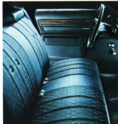
Standard LeMans cloth and Morrokide interior. Shown in blue—also available in green and beige.

This year, we decided to see how many of the finer things we could include in our lowest priced mid-sized car. The '74 LeMans.