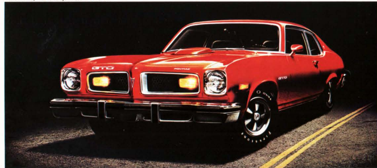
GTO 2-Door Coupe in Buccaneer Red