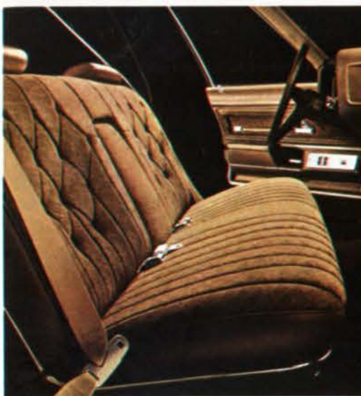
Grand Safari saddle tweed cloth and Morrokide upholstery.