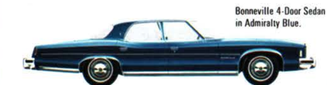
Bonneville 4-Door Sedan in Admiralty Blue.