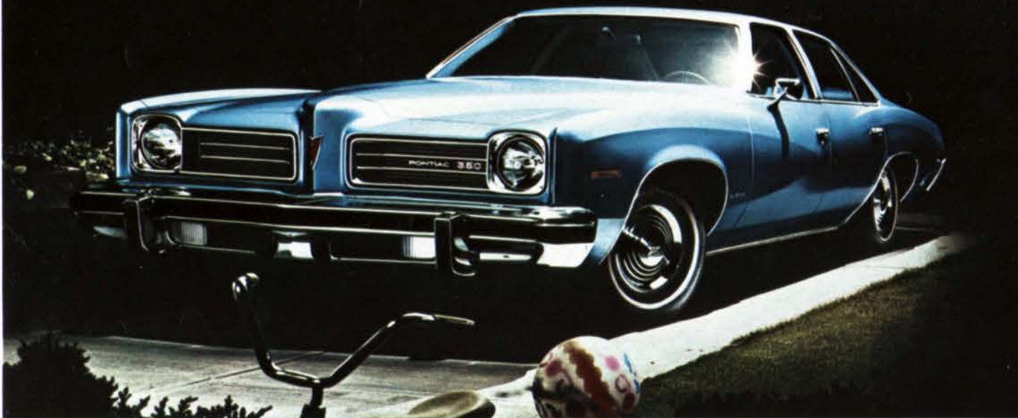
LeMans 4-Door Colonnade Hardtop in Porcelain Blue.