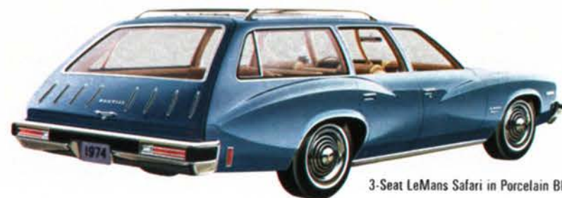
3-Seat LeMans Safari in Porcelain Blue.