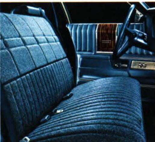
Bonneville block tweed upholstery. Shown in blue—also available in green, beige and black/gray.