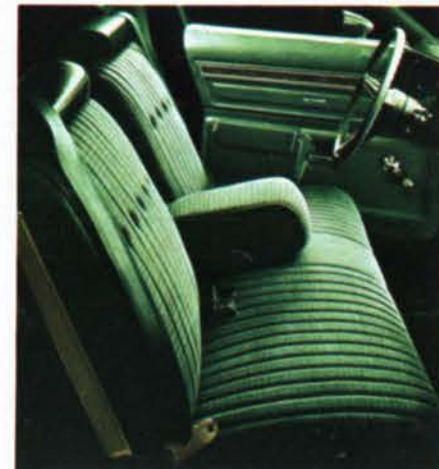
Available LeMans 4-Door cloth and Morrokide interior. Shown in green—also available in blue, beige and burgundy.