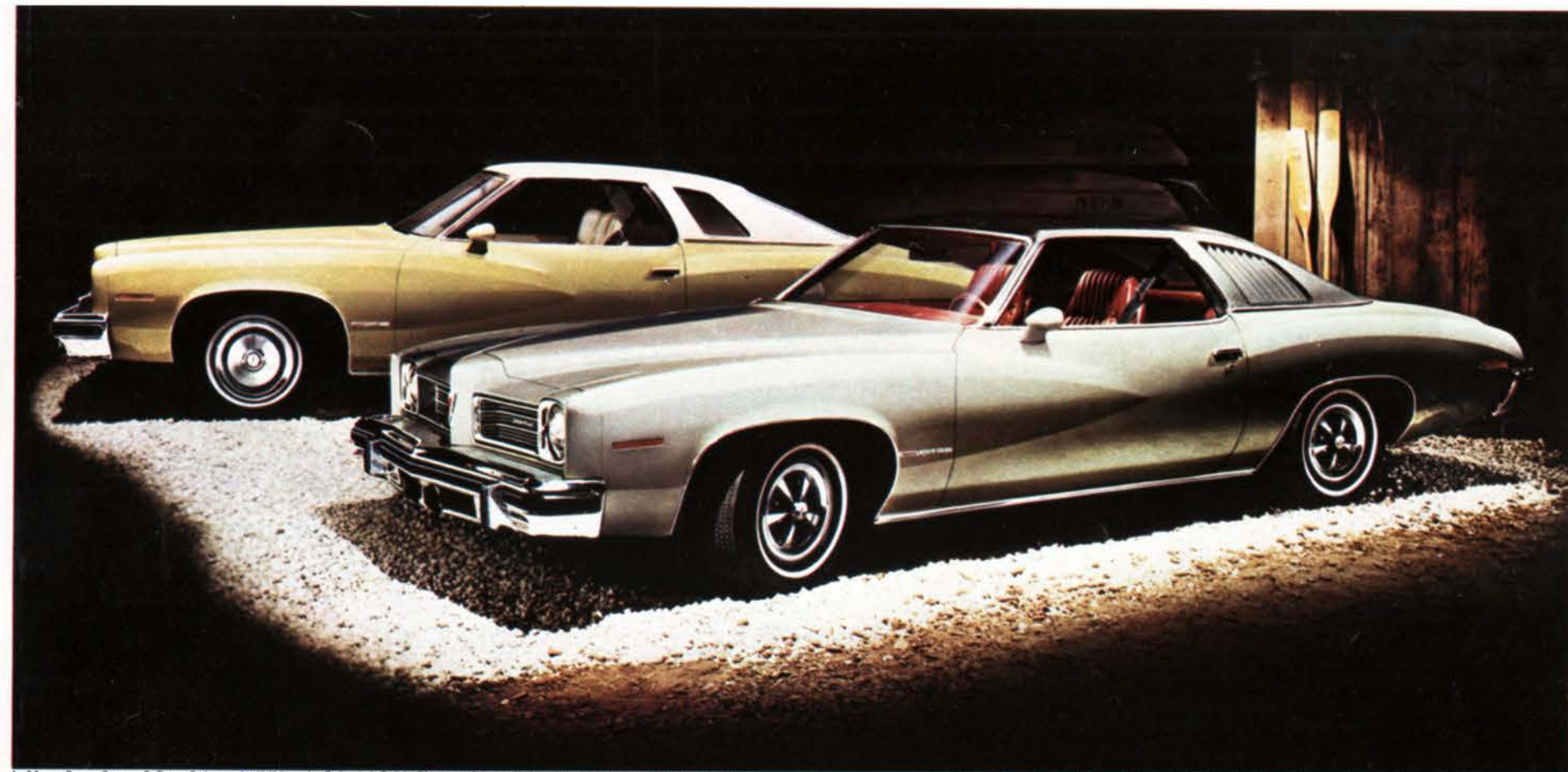
LeMans Sport Coupe 2-Door Colonnade Hardtop in Colonial Gold. Shown with available formal window and Cordova top.