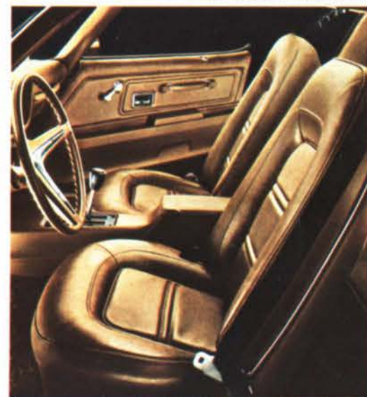
Custom interior—standard on Firebird Esprit, available on Formula Firebird and Firebird Trans Am. Shown in saddle—also available in red, white, blue, green and black.

Shown on the cars on these pages are some of the options and accessories offered by Pontiac at extra cost.