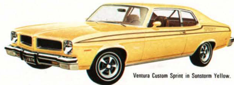
Ventura Custom Sprint in Sunstorm Yellow.

*Available only with Turbo Hydra-matic in California.