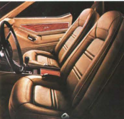
All-Morrokide interior with cut-pile carpeting. Shown in saddle—also available in green, black, burgundy, blue, white and beige.