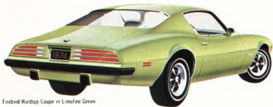
Firebird Hardtop Coupe in Limefire Green.