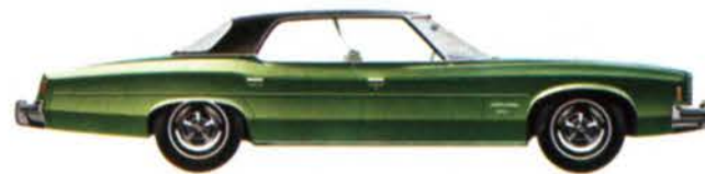
Catalina 4-Door Hardtop in Lakemist Green.