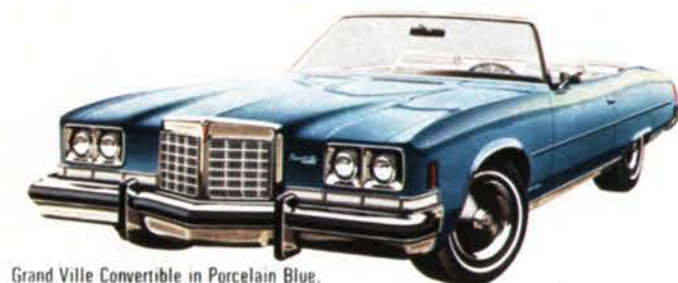
Grand Ville Convertible in Porcelain Blue.