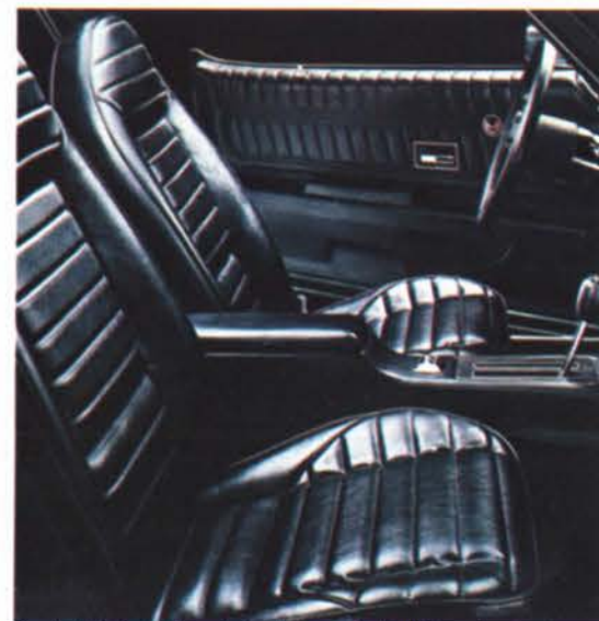
Standard Firebird, Formula Firebird and Firebird Trans Am interior. Shown in black—also available in white and saddle.