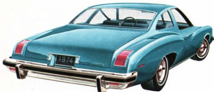
LeMans 2-Door Colonnade Hardtop in Gulfmist Aqua.