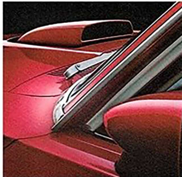
Functional engine-mounted shaker hood scoop.

If you do, full rally instrumentation is available, including an electric tach. To