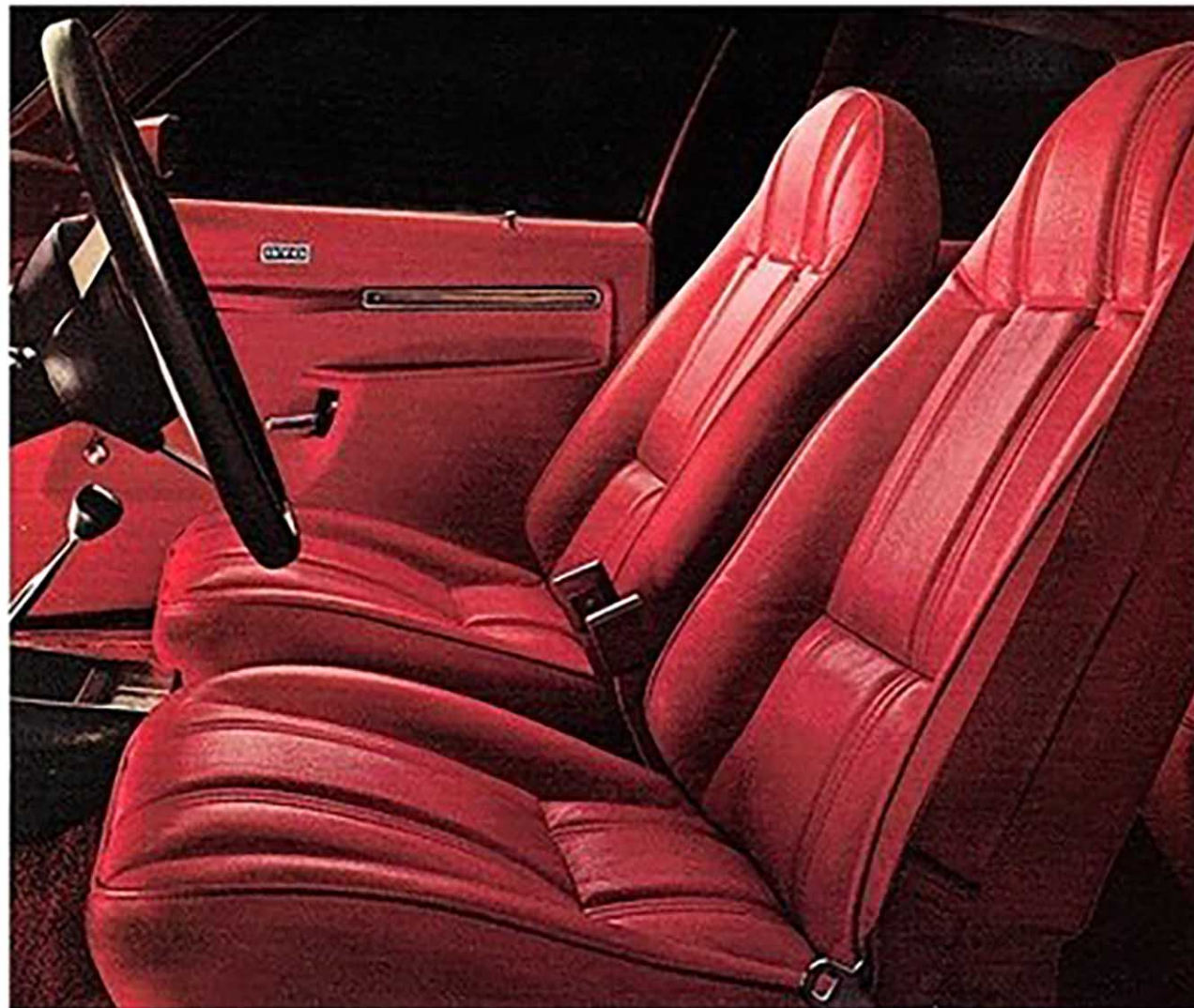
Available all-Morrokide bucket seats. Shown in red—also available in white, saddle and green.