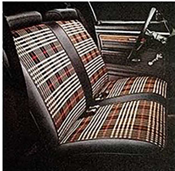
Standard bench seat upholstered in cloth and Morrokide. Shown in black/white/red plaid—also available in black/white/green plaid.

GTO's performance comes from Pontiac's new cold-air induction 350 4-bbl. V-8, teamed with a tough, floor-shifted 3-speed and a 3.08:1 rear axle that relays the