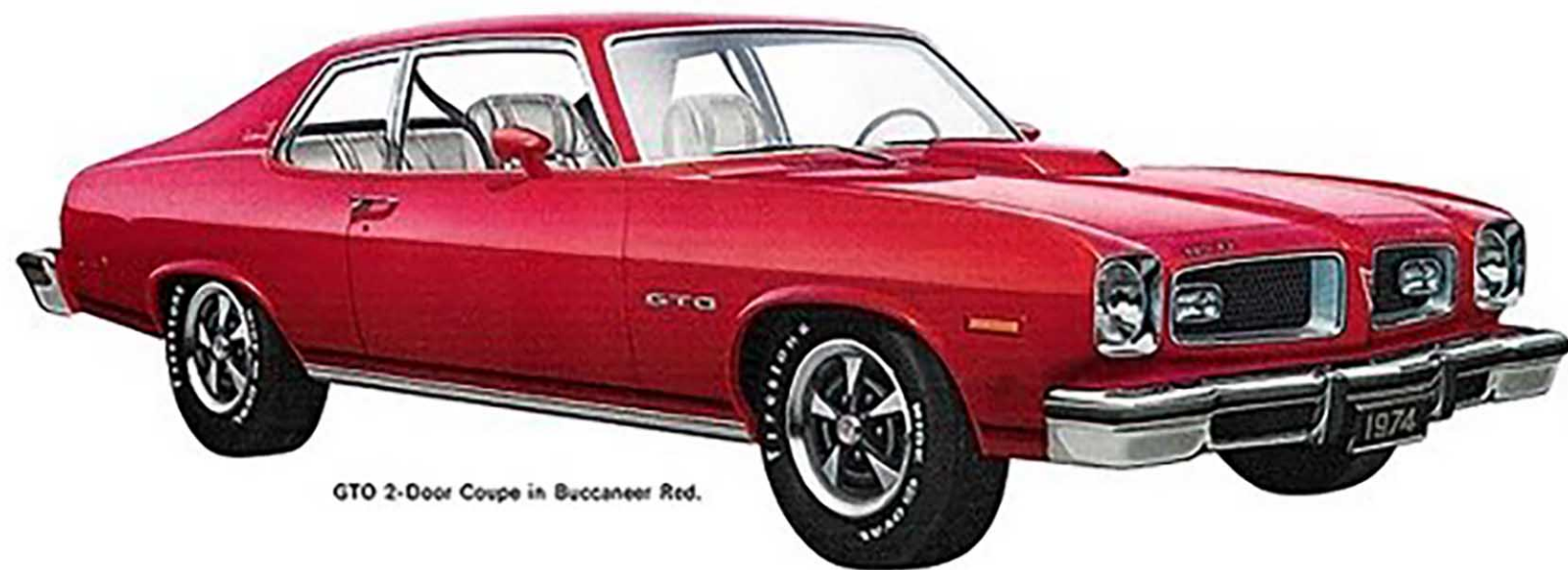
GTO 2-Door Coupe in Buccaneer Red.

After all, the Wide-Track people have a way with cars.