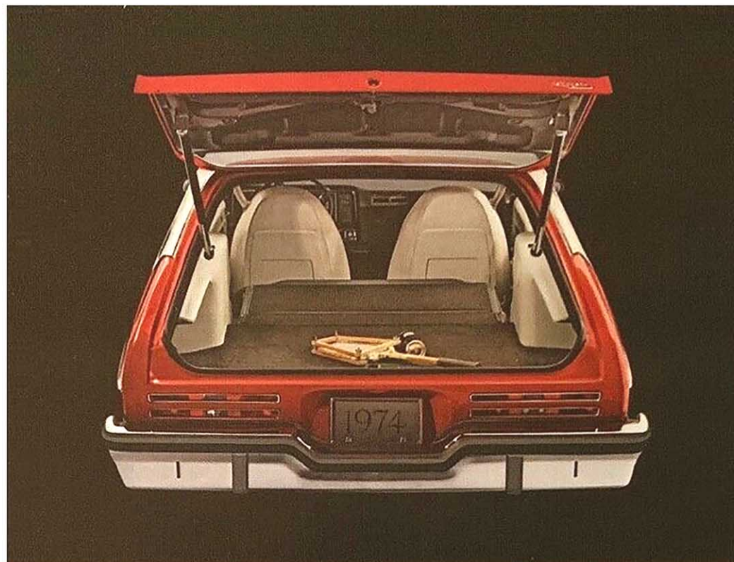
The GTO Hatchback hatch.