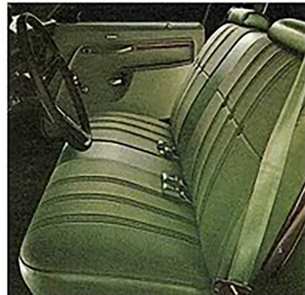
Custom bench seat upholstered in cloth and Morrokide. Shown in green—also available in black.

Power front disc brakes are available for