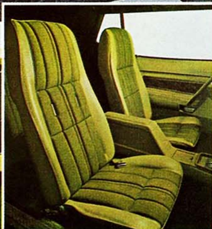
This luxurious Grandé interior is shown with optional arm rest/storage compartment.