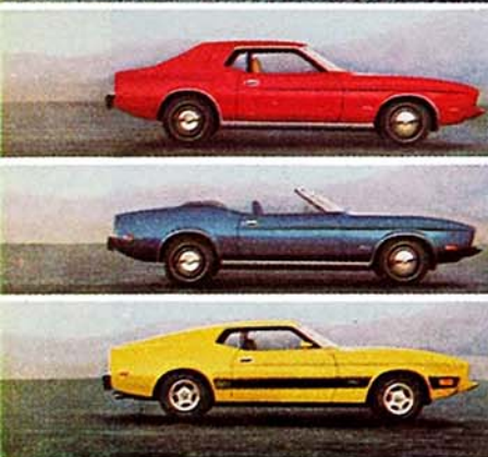
From top: Mustang Hardtop, Convertible, Mach I.

Mustang options, many of which are shown on the Grandé model above, include automatic transmission, air conditioning, AM-FM stereo radio, power front disc brakes, white sidewall tires, steel-belted radial-ply tires, and more.