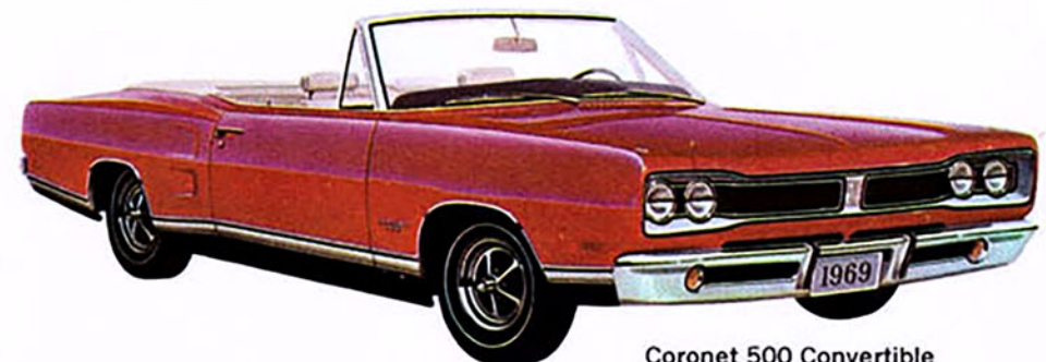
Coronet 500 Convertible