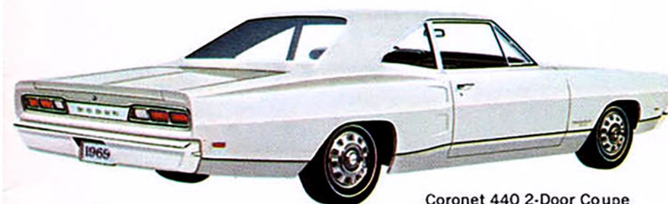
Coronet 440 2-Door Coupe