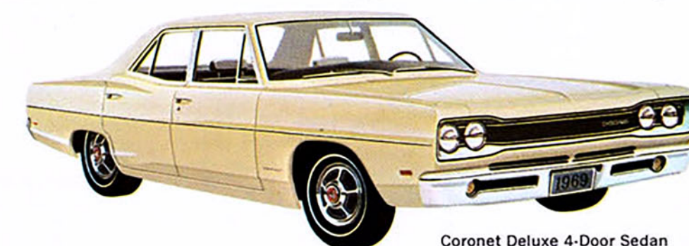
Coronet Deluxe 4-Door Sedan