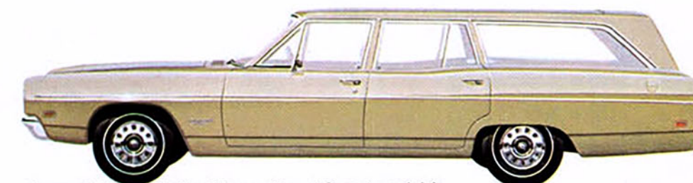
Coronet Deluxe Station Wagon (2 and 3 seat models)