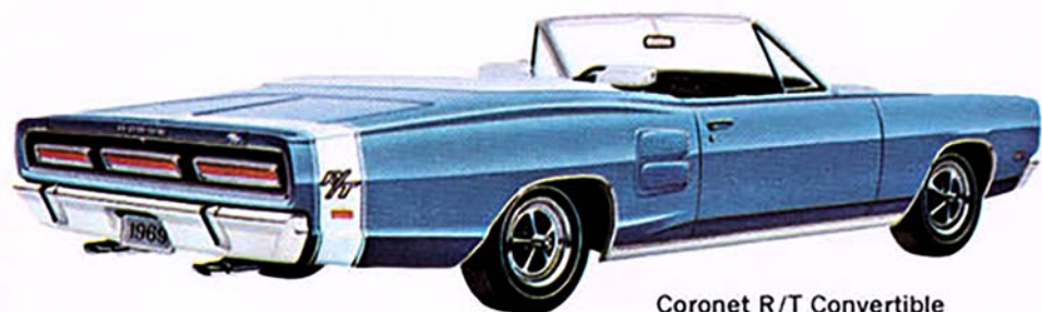
Coronet R/T Convertible