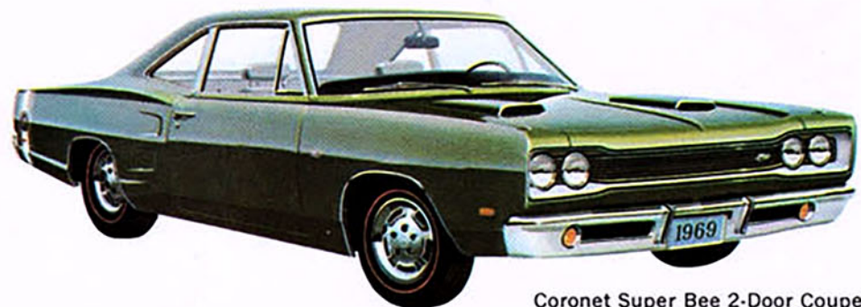
Coronet Super Bee 2-Door Coupe