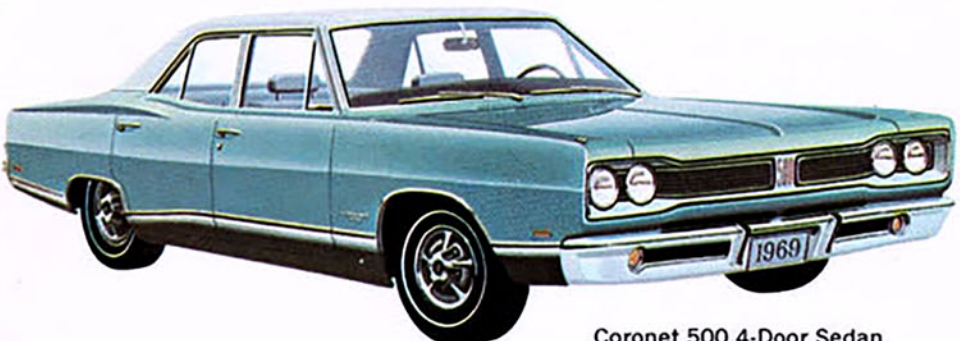
Coronet 500 4-Door Sedan