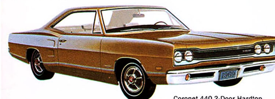
Coronet 440 2-Door Hardtop