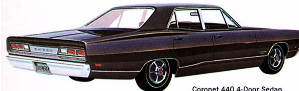
Coronet 440 4-Door Sedan