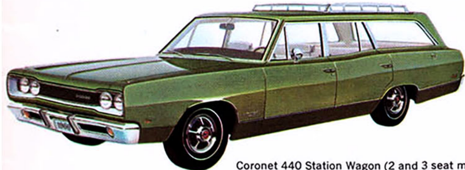
Coronet 440 Station Wagon (2 and 3 seat models)