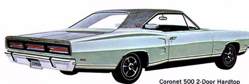
Coronet 500 2-Door Hardtop