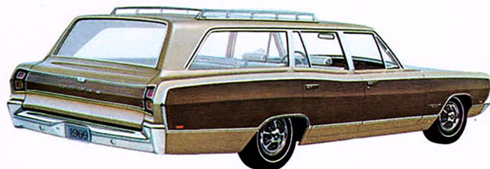
Coronet 500 Station Wagon (2 and 3 seat models)