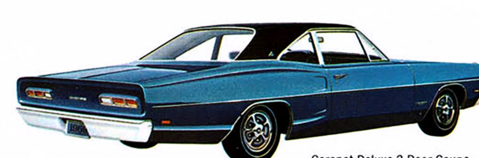
Coronet Deluxe 2-Door Coupe