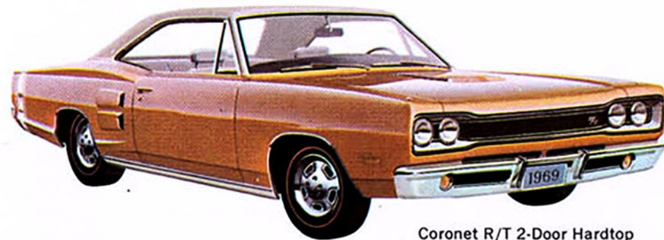
Coronet R/T 2-Door Hardtop