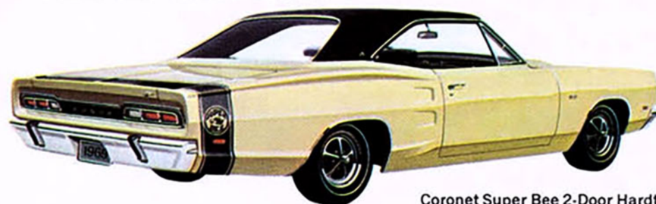
Coronet Super Bee 2-Door Hardtop