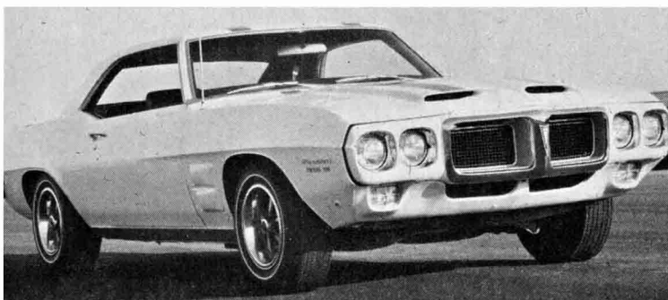
Functional twin-scoop setup directs cool fresh air to the hungry 400 Ram Air mill.

Pontiac offers a streetable version of its Trans-Am Firebird road racer for the ponycar enthusiast who grooves on scoops, stripes and spoilers. The race model packs a new 300-inch-plus Traco-style dual-quad tunnel-port-engine, while its streetable twin relies on 400-inch power to get the job done!