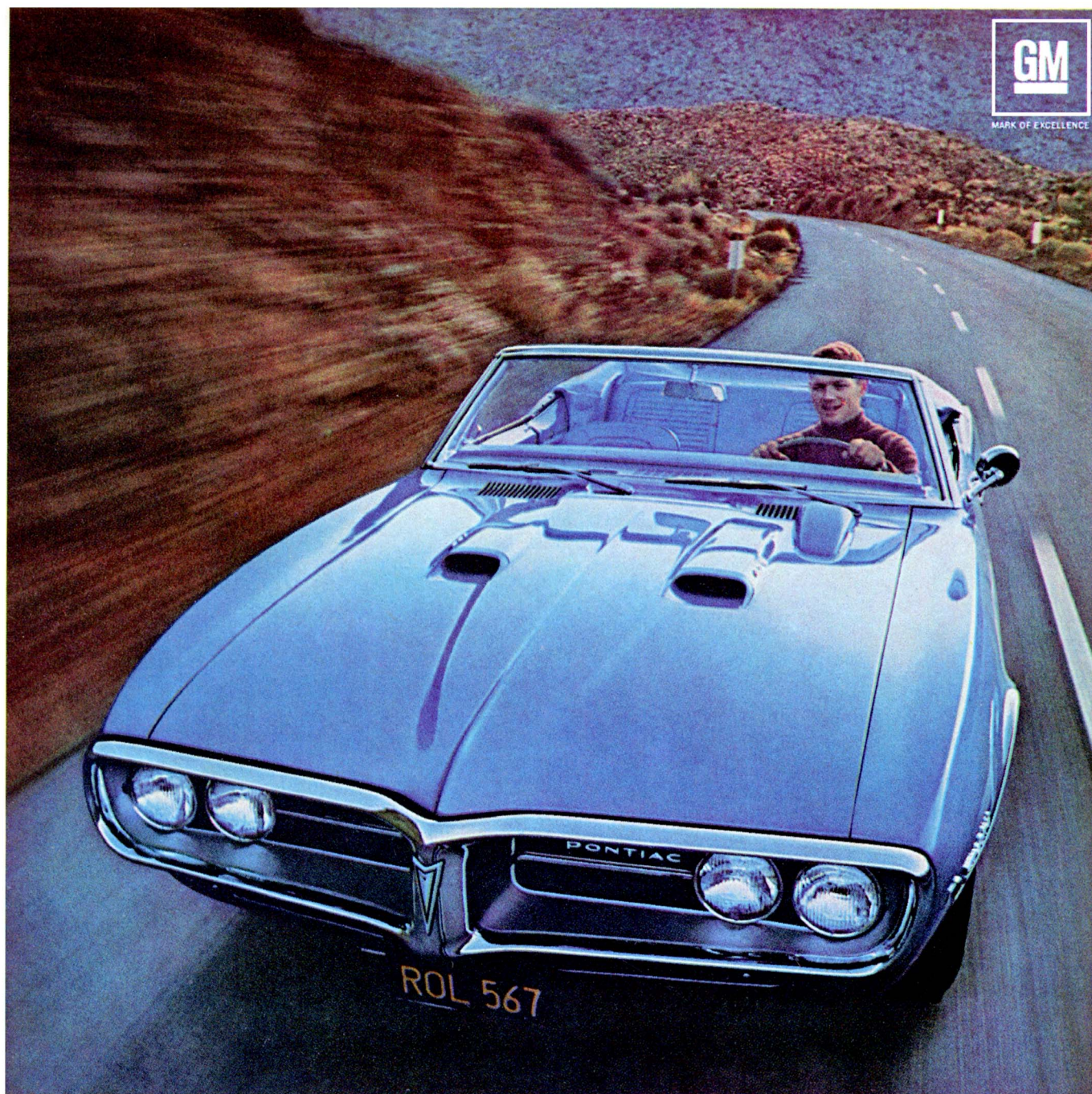
Pontiac Motor Division