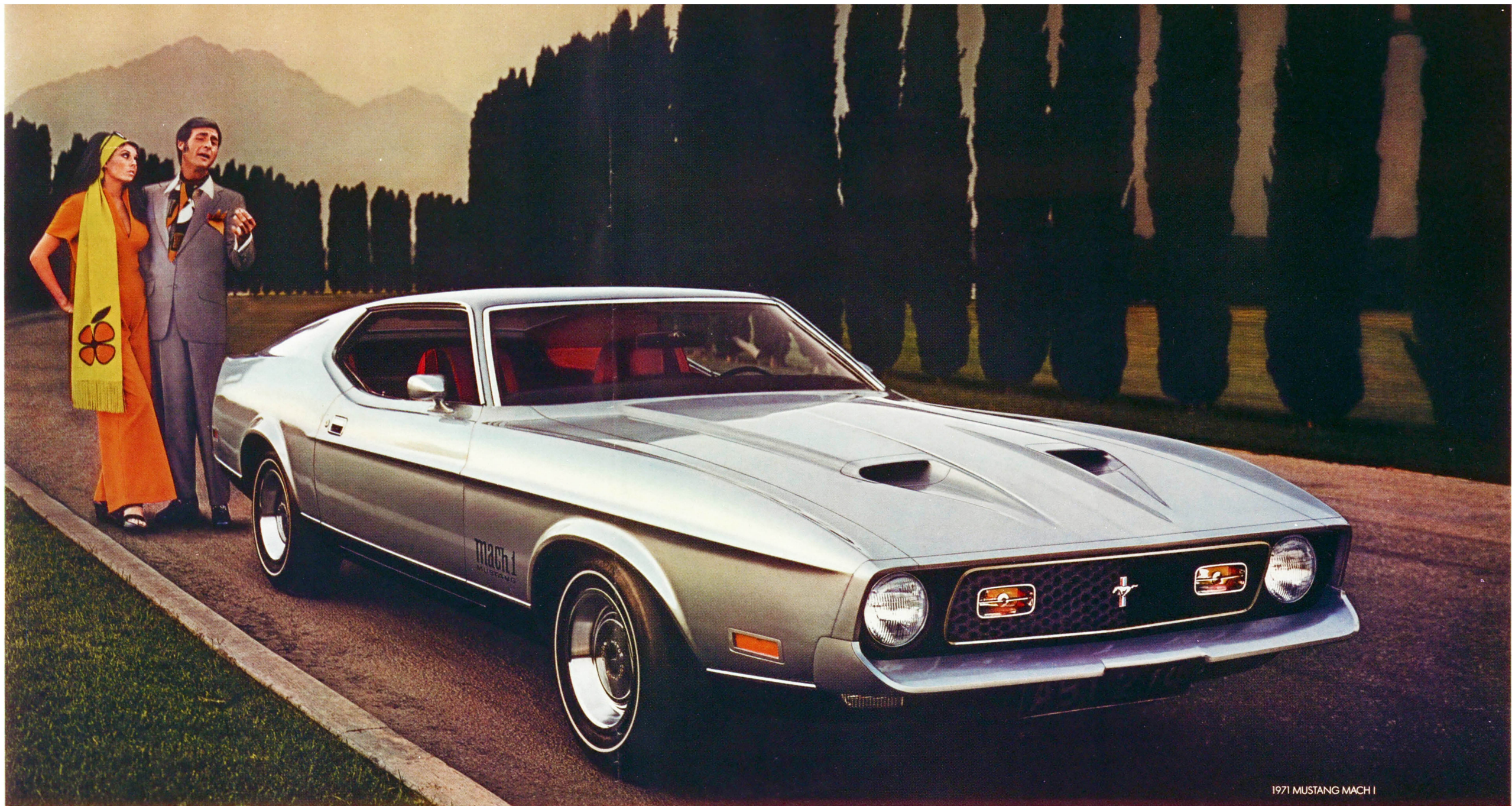
1971 MUSTANG MACH I

"The 1971 Mustang Grande. Mucho Grande!"