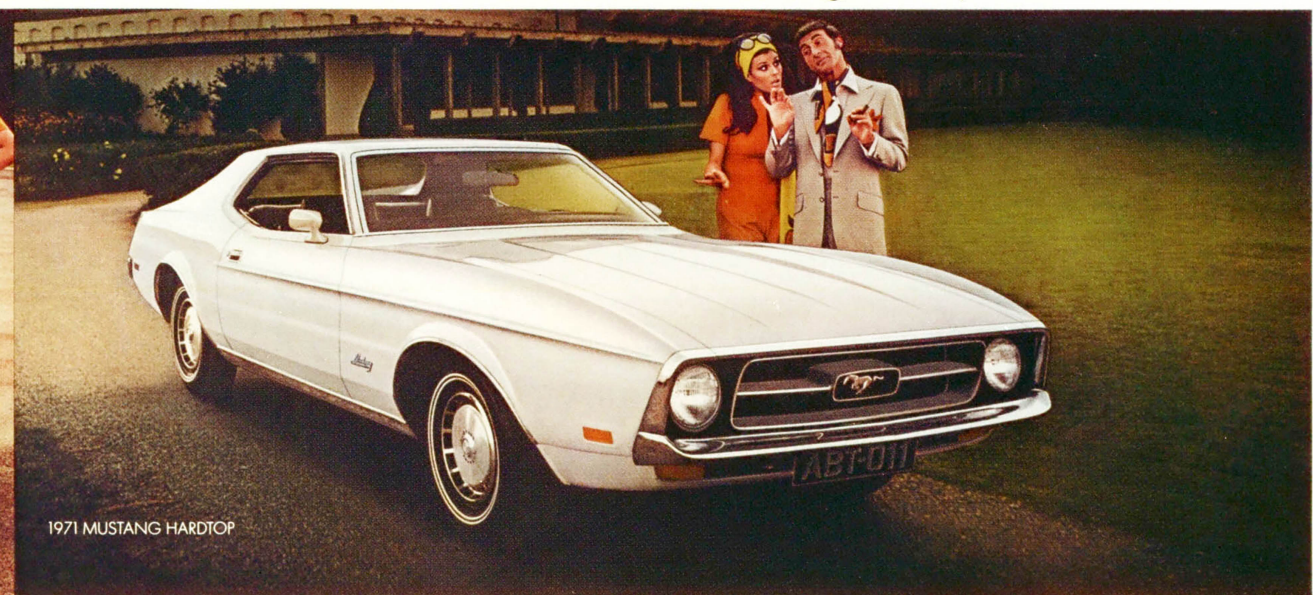
1971 MUSTANG HARDTOP