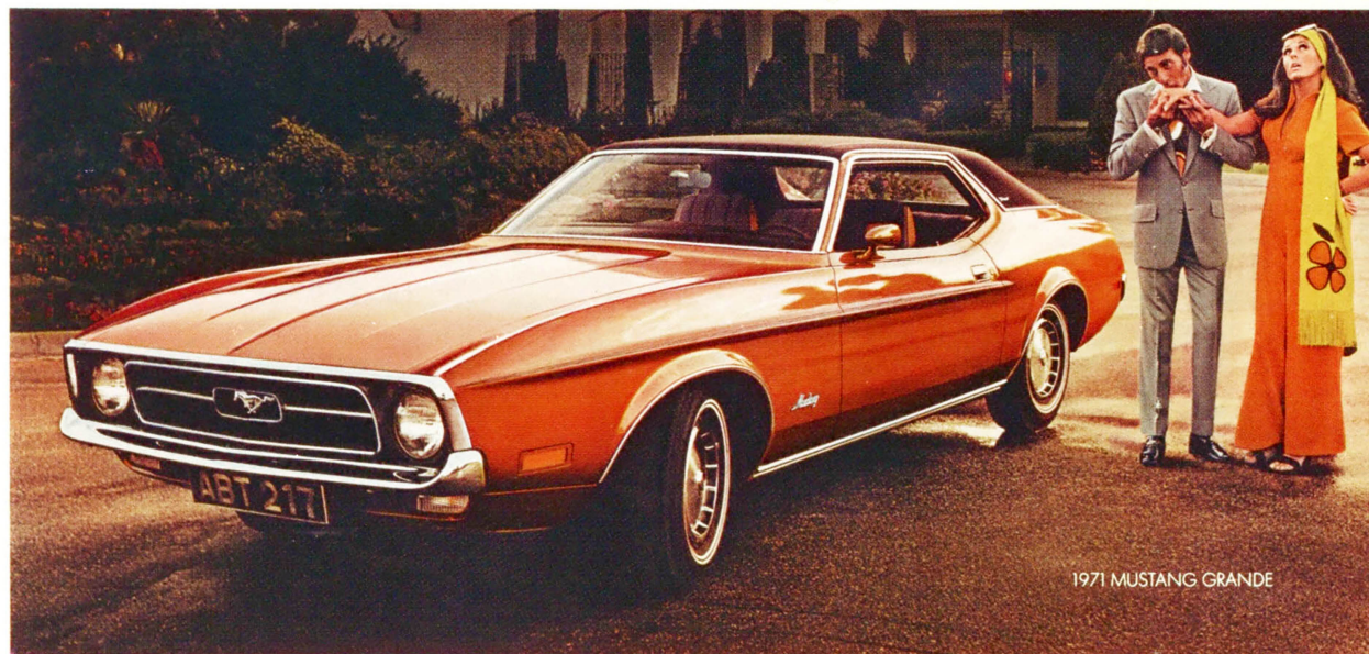
1971 MUSTANG GRANDE

"The 1971 Mustang Grande. Mucho Grande!"