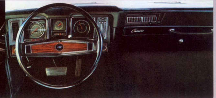
Powerglide with console. Instrument panel and Special Interior Group.