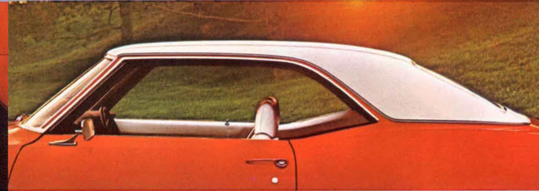
Vinyl roof cover with a new styling touch.