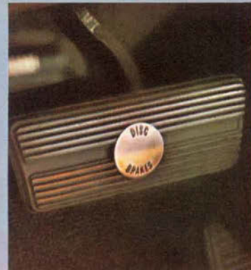
Power disc brakes.