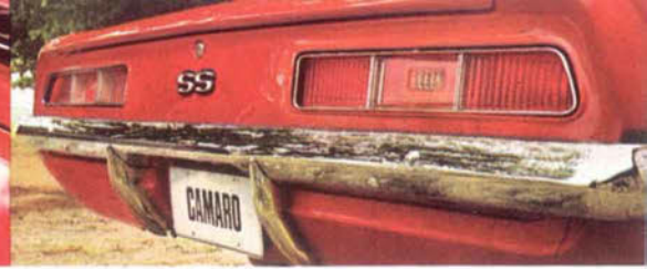
Rear trim on the SS.