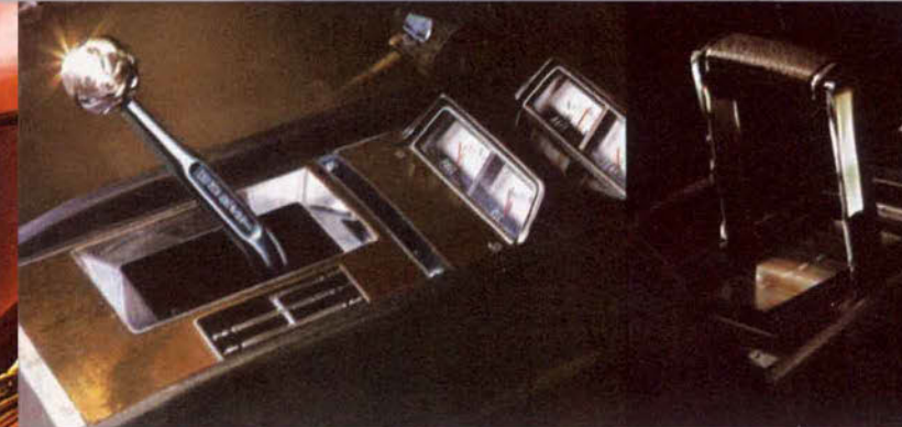
4-Speed transmission with a Hurst shifter and Special Instrumentation on console.