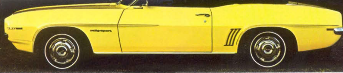
The Camaro Rally Sport from the side.