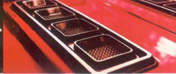
SS hood with simulated ports.