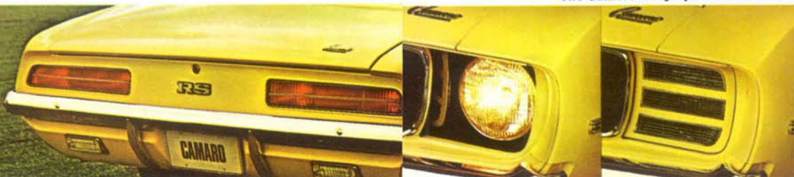
The Rally Sport's rear trim.