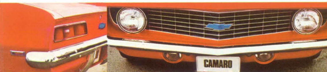
Camaro, from the rear.