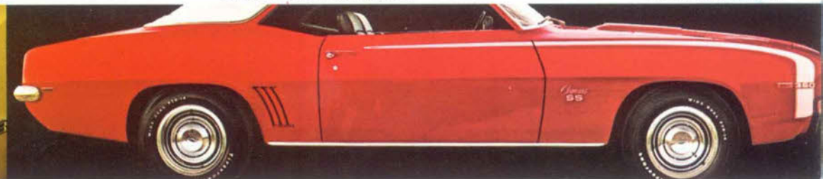
The Camaro SS from the side.