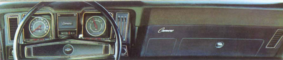
The command post.