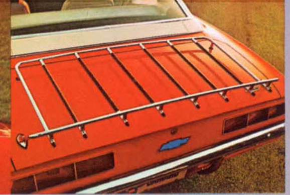
Rear deck luggage rack.