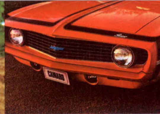
Color-Matched bumper and front accent striping.