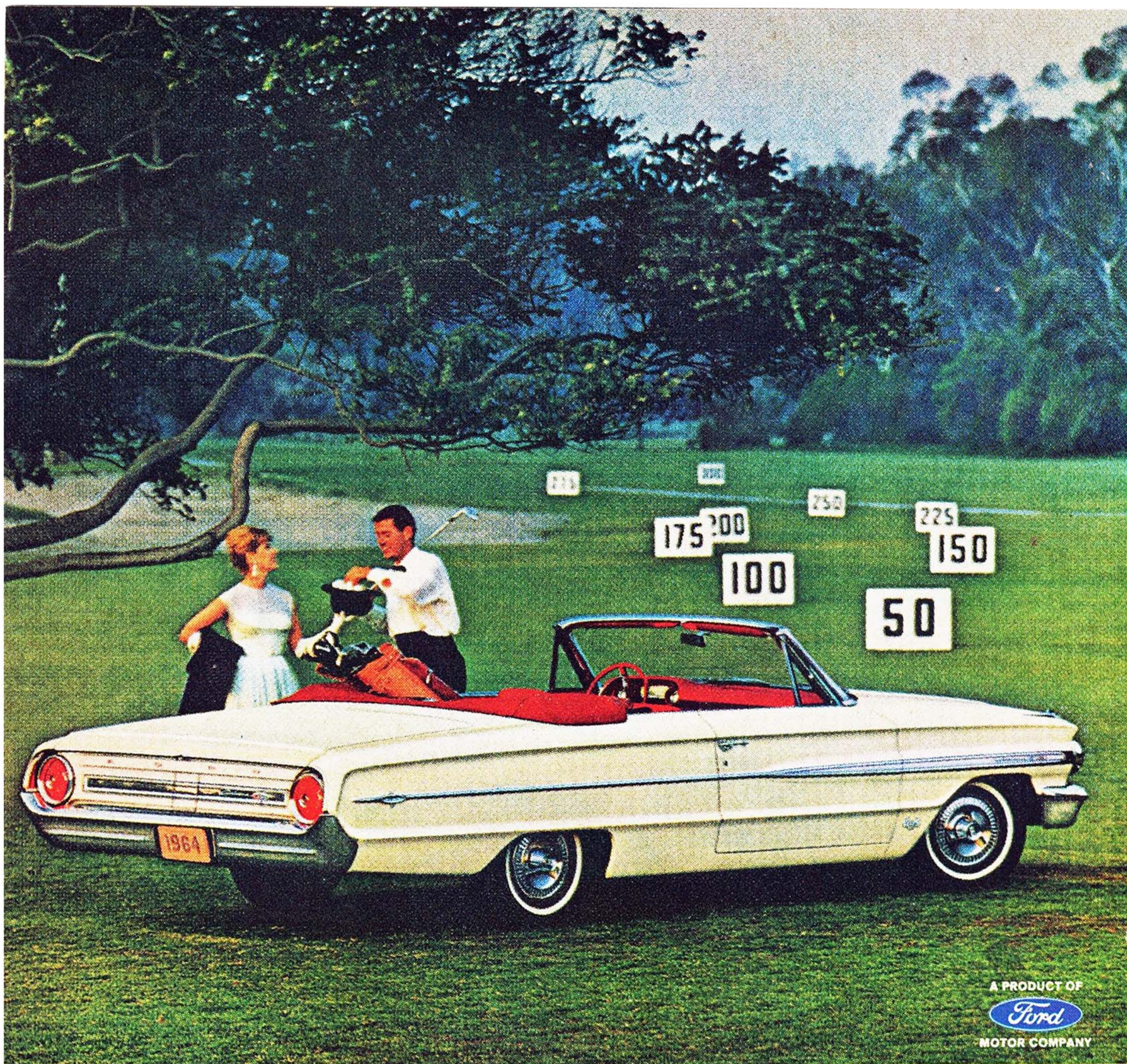
FORD GALAXIE 500/XL CONVERTIBLE

I was a "golf widow," neglected and alone. Then we got together on a solid, silent Super Torque FORD —so beautifully '64, and it's hundreds of pounds stronger, smoother, steadier than anything in its class. Now I'm no longer neglected and alone. I'm his caddy.