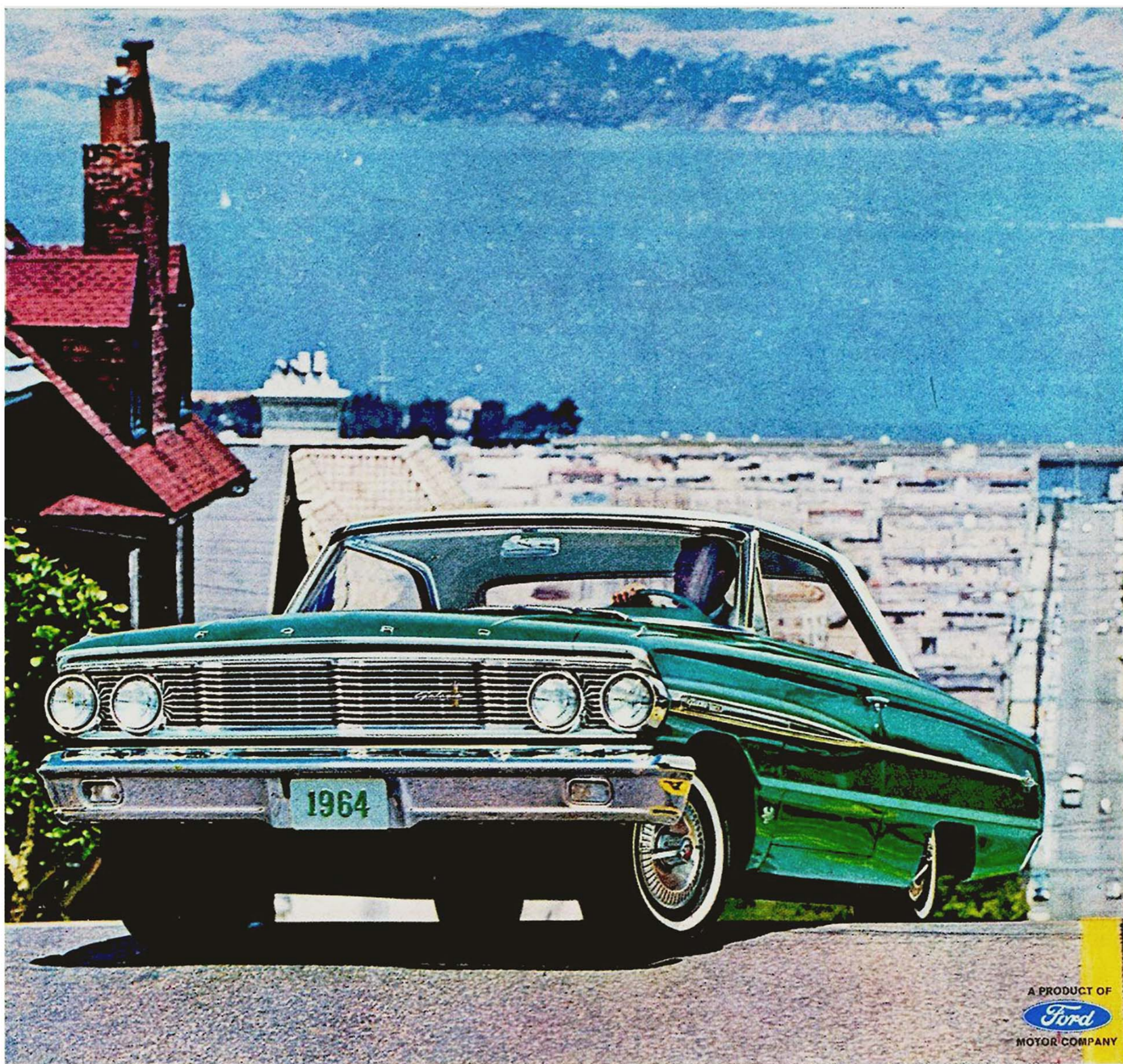
FORD GALAXIE 500/XL—2-DOOR HARDTOP

Those Super Torque FORD engines climb hills like a homesick Swiss yodeler. One is available with 425 horsepower (a few more than the average private plane). They're still talking about it at Daytona! Try total performance on your local Matterhorn. Just ask your nearest Ford dealer.