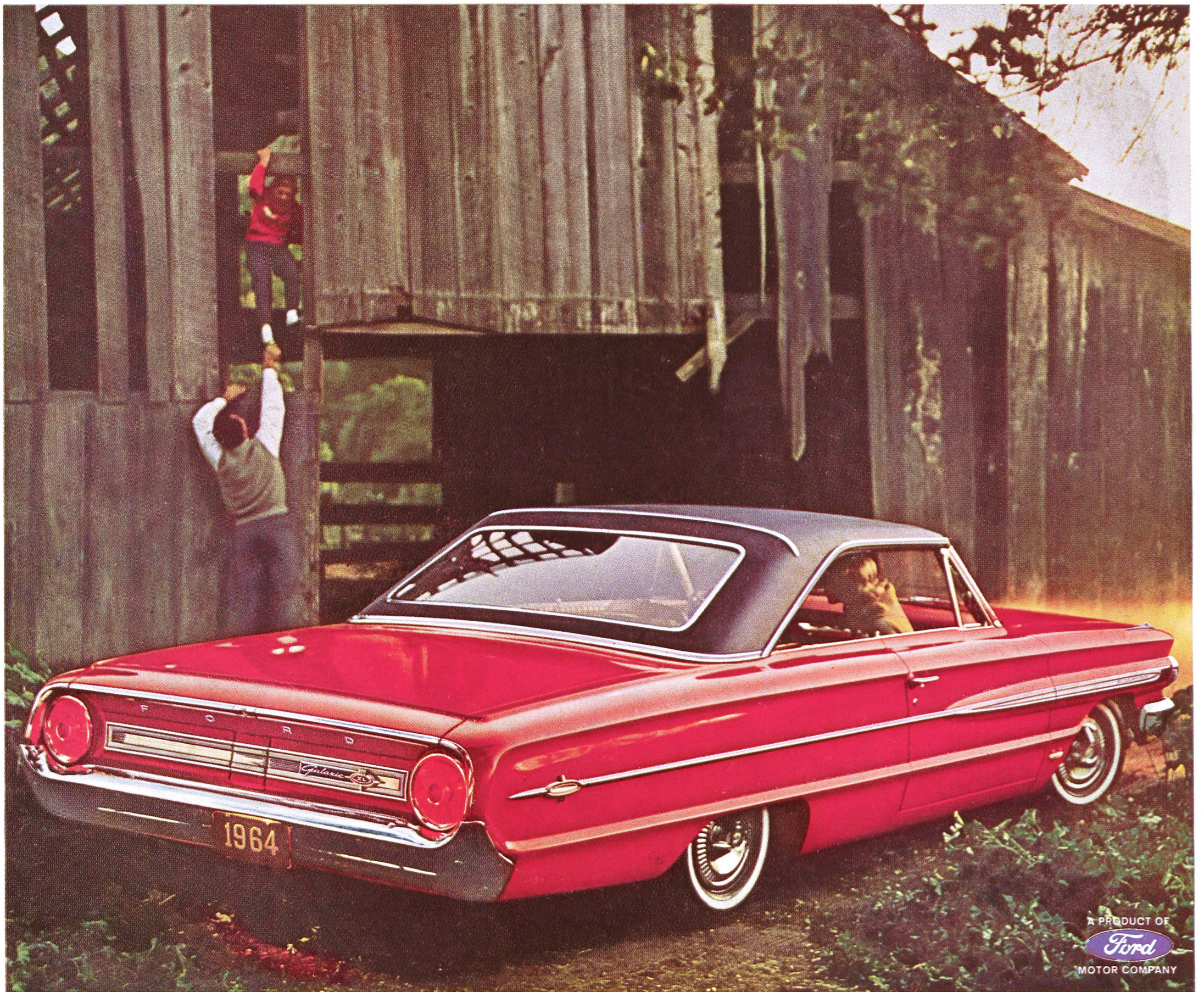
FORD GALAXIE 500/XL— 2-DOOR HARDTOP

Nobody goes down to the old Keefer place anymore, unless they're in a Solid, Silent Super Torque FORD . Only Ford takes that old wash-board road like a fresh-paved turnpike. Reason: The '64 Ford has over 130 pounds more steel in its frame and suspension than any other car in its class. (Is it true that old man Keefer hid money in his barn?)