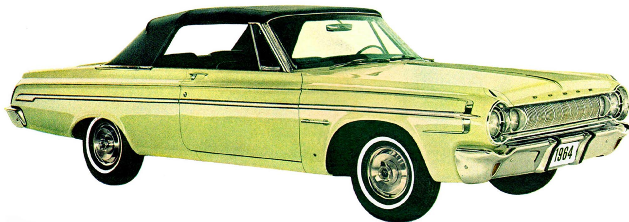
The real McCoy

These two performers have got quite an act. Look closely at the one on top. The great impostor. A handsome hardtop with all the excitement of a convertible. The original vinyl covering does it—gives it a distinctive, custom-tailored, sophisticated appearance. Regal. Travels in the best of circles—or out on the straightaway.