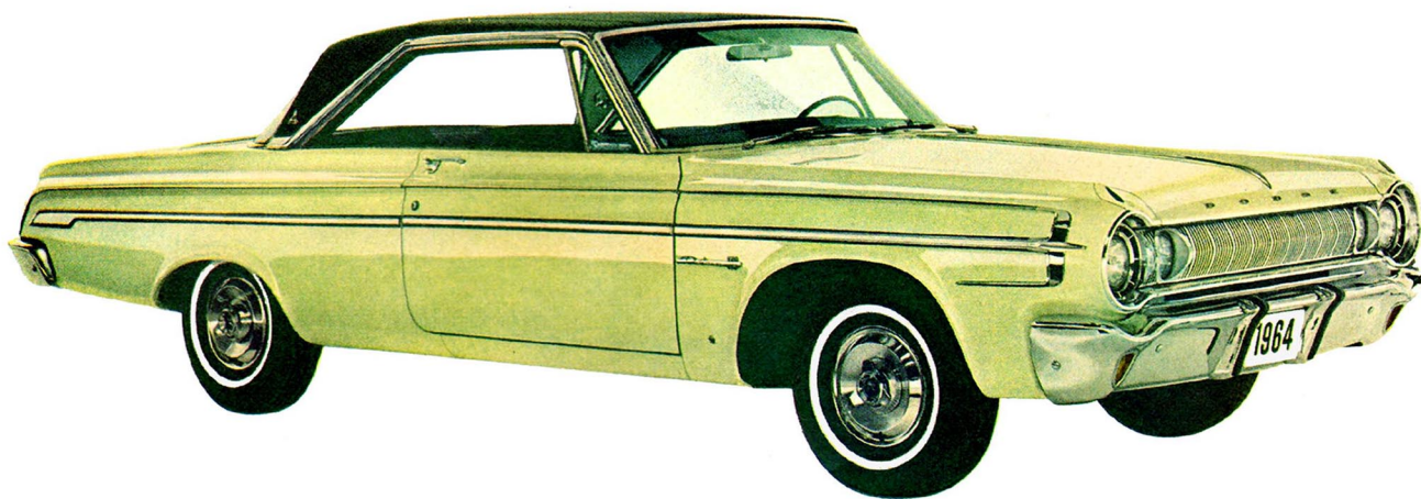
The great impostor