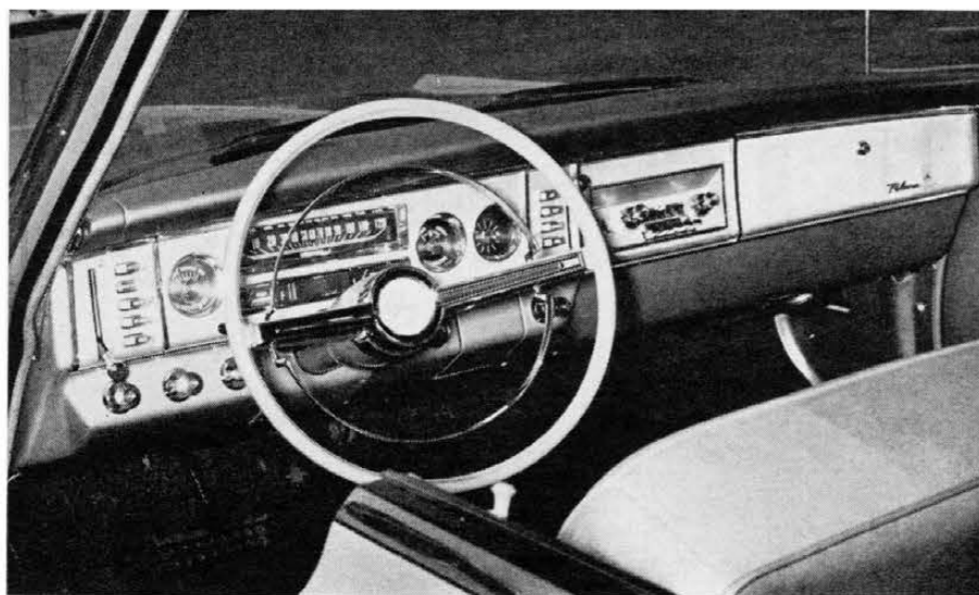
PUSH BUTTONS at left control Dodge's TorqueFlite transmission. Slightly oval-shaped steering wheel permits easier entrance and exit. Fascia panel is ribbed aluminum.

Standard brakes for Dodge V-8s are 10 x 2.5-in. drum types, with 314.2 sq. in. of swept area and a self-energizing action. This Bendix-developed