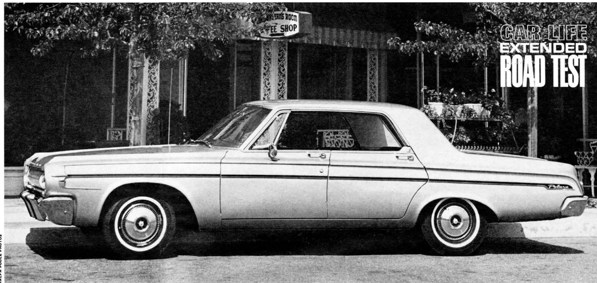
RAISED ROOF of '64 Dodge sedans gives driver and passengers more headroom and an improved outlook. Outside rearview mirror is adjustable from inside the door.

and knee room, which allowed even good-sized adults a medium-sized sprawl. The fold-down armrest in the center of the front seat-back was also a boon to the distance traveler seeking a relaxed position. Too, the front seat rake can be adjusted by clamp bolts under each corner and this helps the driver attain just the right posture. Of the six drivers who sampled and commented on the Dodge, all were pleased by its comfortable quarters.