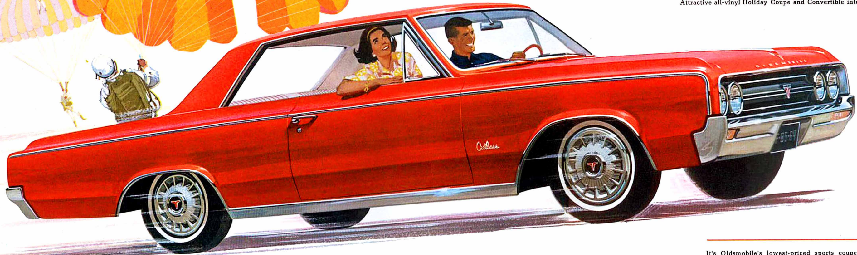
Cutlass Holiday Coupe (Cutlass Sports Coupe also available)

Stepped up in size! Stepped up in performance! All new from the nameplate back!