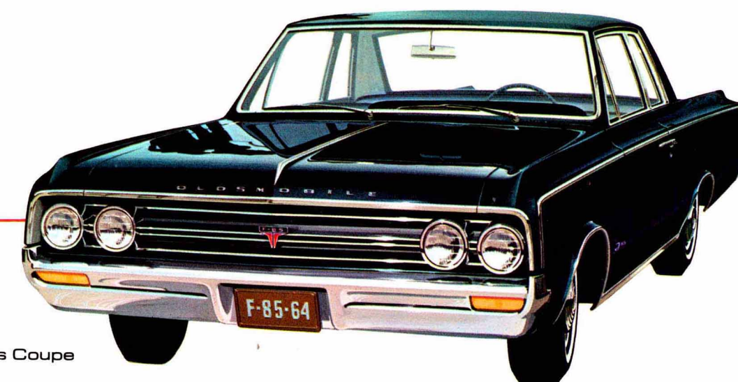
F-85 V-6 Sports Coupe

Even a glance tells you the '64 Cutlass is a whale of a lot of car. But slip into a foam-padded bucket seat and the discoveries come hot and fast. The eager way Cutlass responds to your every command—thanks to a zesty new 260-h.p. Cutlass V-8 (teamed with new optional Jetaway Drive, or 3-speed or fully synchronized 4-speed stick). The sure way Cutlass holds the road—thanks to a three-inch-longer wheelbase and a two-inch-wider tread. And the extra bonus of stretch-out room inside —thanks to Cutlass' ten extra inches outside . This year, you can choose from three Cutlass models—each loaded with looks and ready for action!