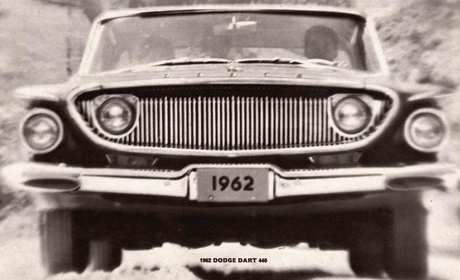
1962 DODGE DART 440