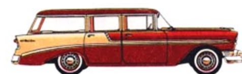
THE BEL AIR BEAUVILLE—Seats nine passengers, or converts quickly to roomy cargo carrier.