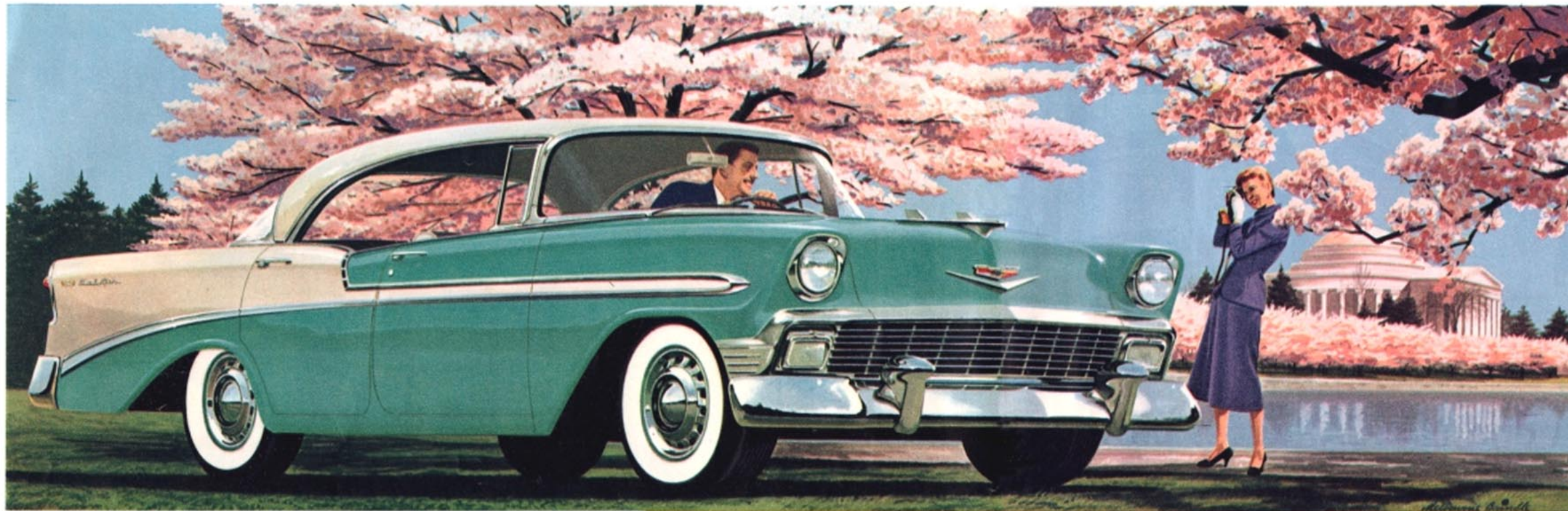
THE BEL AIR SPORT SEDAN—One of Chevrolet's two new 4-door hardtops. Body by Fisher, of course.