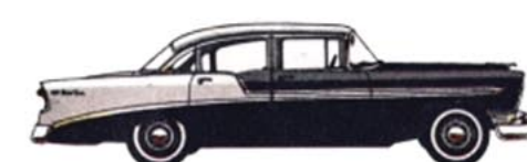
THE BEL AIR 4-DOOR SEDAN—Chevrolet brings you the security of safety door latches in all models!