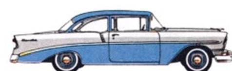
THE "TWO-TEN" 2-DOOR SEDAN—Directional signals are standard in all new Chevrolets.