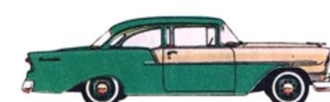
THE "ONE-FIFTY" 2-DOOR SEDAN—Your choice of V8 or 6 power in every new Chevrolet.