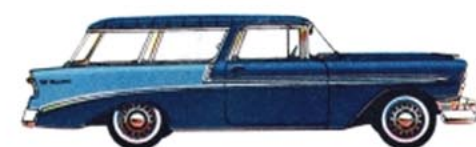
THE BEL AIR NOMAD—Sweet and low. This 6-passenger beauty is Chevrolet's last word in wagons!