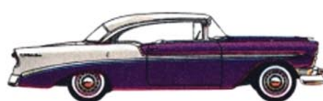
THE BEL AIR SPORT COUPE—Another hardtop honey! With windows down, it's wide open for fun!

In all, Chevrolet offers 19 sure cures for spring fever—all with Body by Fisher and horsepower ranging up to 225 for safer, happier traveling. Your Chevrolet dealer will be happy to fill the prescription. . . . Chevrolet Division of General Motors, Detroit 2, Michigan.