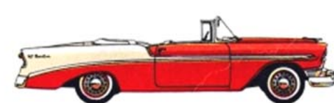
THE BEL AIR CONVERTIBLE—Loves to go—and looks it. Horsepower ranges clear up to 225!