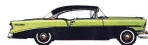
THE "TWO-TEN" SPORT COUPE—Made to have fun with—and it's Chevrolet's lowest priced hardtop!