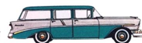
THE "TWO-TEN" TOWNSMAN—Plenty of room for six—plus big load space in this 4-door wagon.