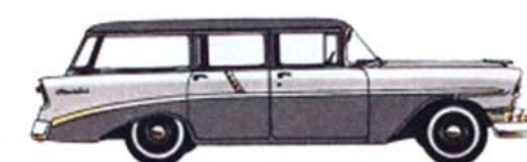
THE "TWO-TEN" BEAUVILLE—This 4-door wagon holds a whole baseball team, or 1/2-ton of cargo.