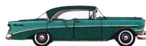
THE "TWO-TEN" SPORT SEDAN—Four doors and no sideposts in this stylish new Chevy.