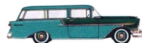
THE "ONE-FIFTY" HANDYMAN—Rear seat folds flat for extra carrying capacity in this 2-door wagon.