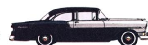
THE "ONE-FIFTY" UTILITY SEDAN—The entire rear compartment is load space.