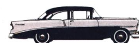
THE "TWO-TEN" DELRAY CLUB COUPE—Its all-vinyl interior thrives on hard use. Washes clean.