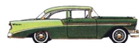
THE BEL AIR 2-DOOR SEDAN—A beautiful thing to handle! Ball-Race steering makes turning easier.