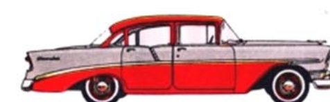
THE "TWO-TEN" 4-DOOR SEDAN—As you can see, the "Two-Ten" series has its own sassy new styling.