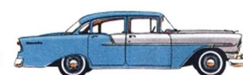
THE "ONE-FIFTY" 4-DOOR SEDAN—Notice the tasteful chrome trim in Chevrolet's lowest priced series!