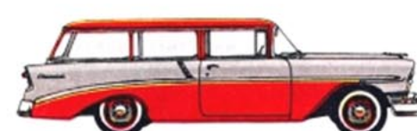
THE "TWO-TEN" HANDYMAN—Looking for a 2-door station wagon that seats six and handles big loads?