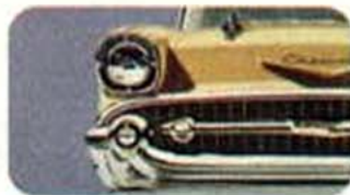
7. DARING NEW FRONT END DESIGN