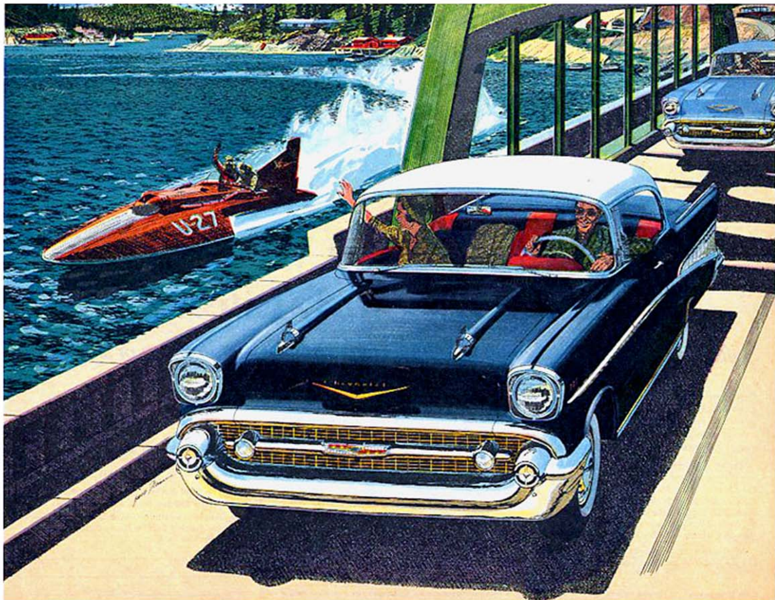
More to be proud of—The Bel Air Sport Coupe with Body by Fisher

sure-footed balance, the eager responsiveness, the solid and gentle ride, the special features, too. The new Positraction rear axle (optional at extra cost), for example, delivers power to the wheel that grips , not the wheel that slips , for still more pleasure in your driving. Better visit your Chevrolet dealer soon! . . . Chevrolet Division of General Motors, Detroit 2, Michigan.