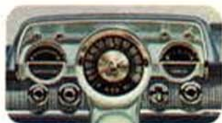
3. COMMAND POST CONTROL PANEL