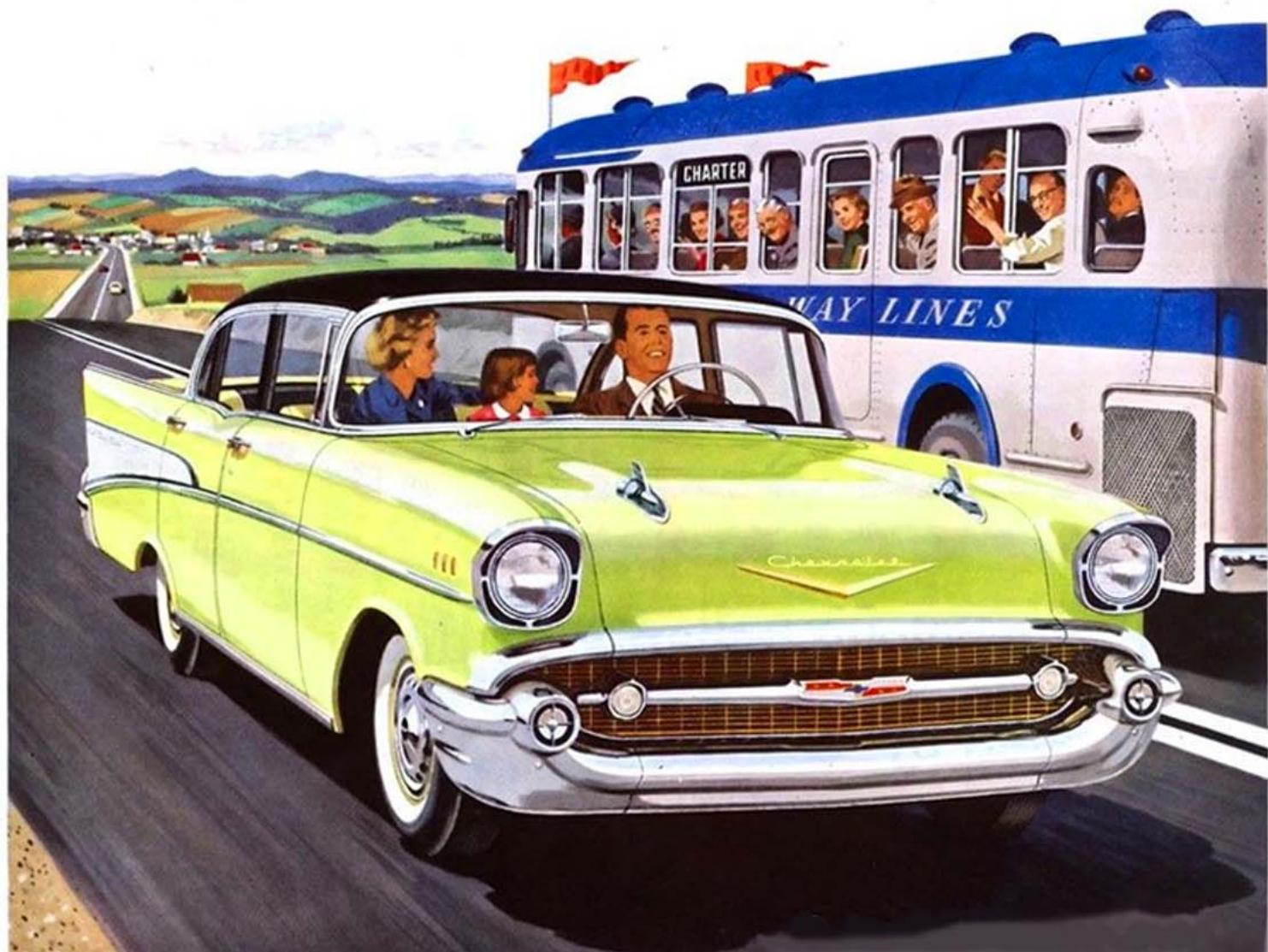
SWEET, SMOOTH AND SASSY! The Bel Air 4-Door Sedan with Body by Fisher—one of 20 new Chevies.

and quick as they come...the '57 Chevrolet!