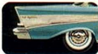
4. LOOKS LONGER . . . AND IT IS!