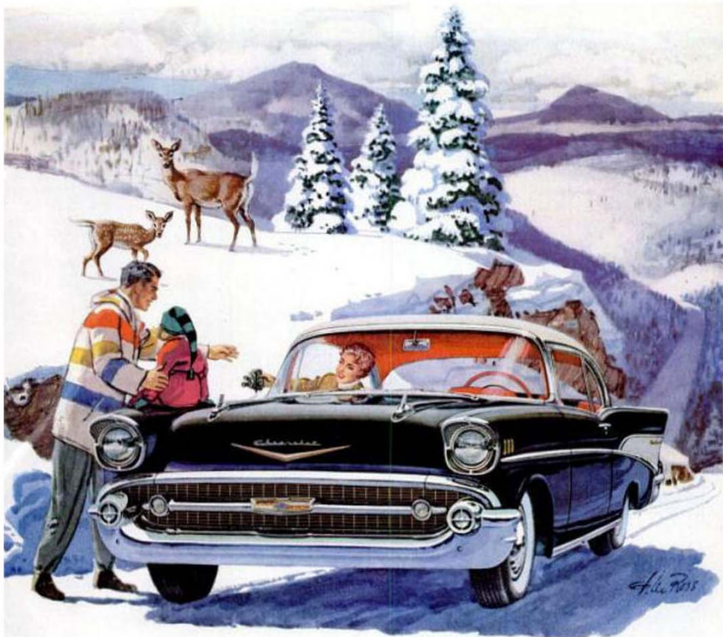
SWIFT, SMOOTH AND SASSY—the beautiful Bel Air Sport Coupe. You can see and feel the solid quality of its Body by Fisher.