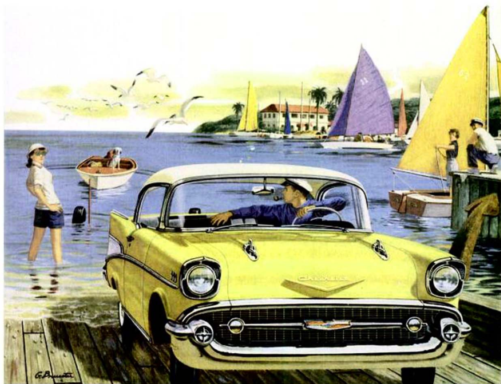
The Bel Air Sport Coupe with Body by Fisher—one of 20 beautiful new Chevrolets.

you'll love Chevrolet's new light-touch driving!