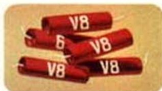
2. PERFORMANCE REACHES NEW HIGHS