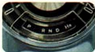
1. NEWEST AUTOMATIC DRIVE OF ALL