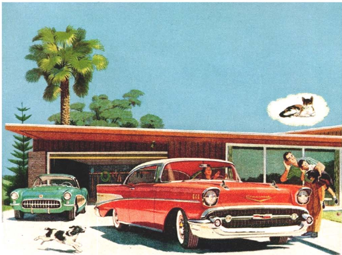
The dashing new Corvette (left) and the Bel Air Sport Coupe.