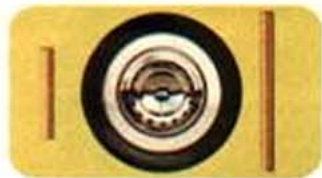
6. NEW SIZE WHEELS AND TIRES