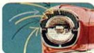
5. HEADLIGHT-HOOD AIR VENTS