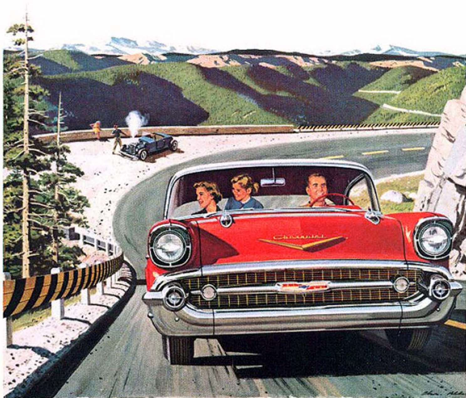
More beautifully built and shows it—the new Chevrolet with Body by Fisher.