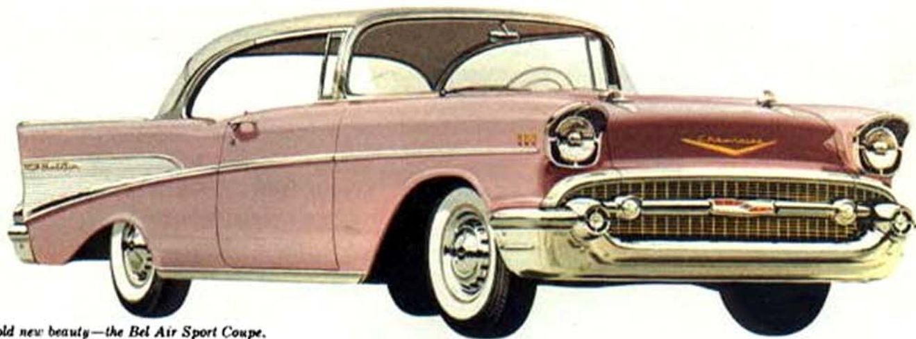
Bold new beauty—the Bel Air Sport Coupe.

The '57 Chevrolet comes up with a daring new departure in design for 1957! Plus new power (even fuel injection!), new Triple-Turbine Turboglide automatic drive, new ideas right down to the wheels. It's Sweet, Smooth and Sassy!