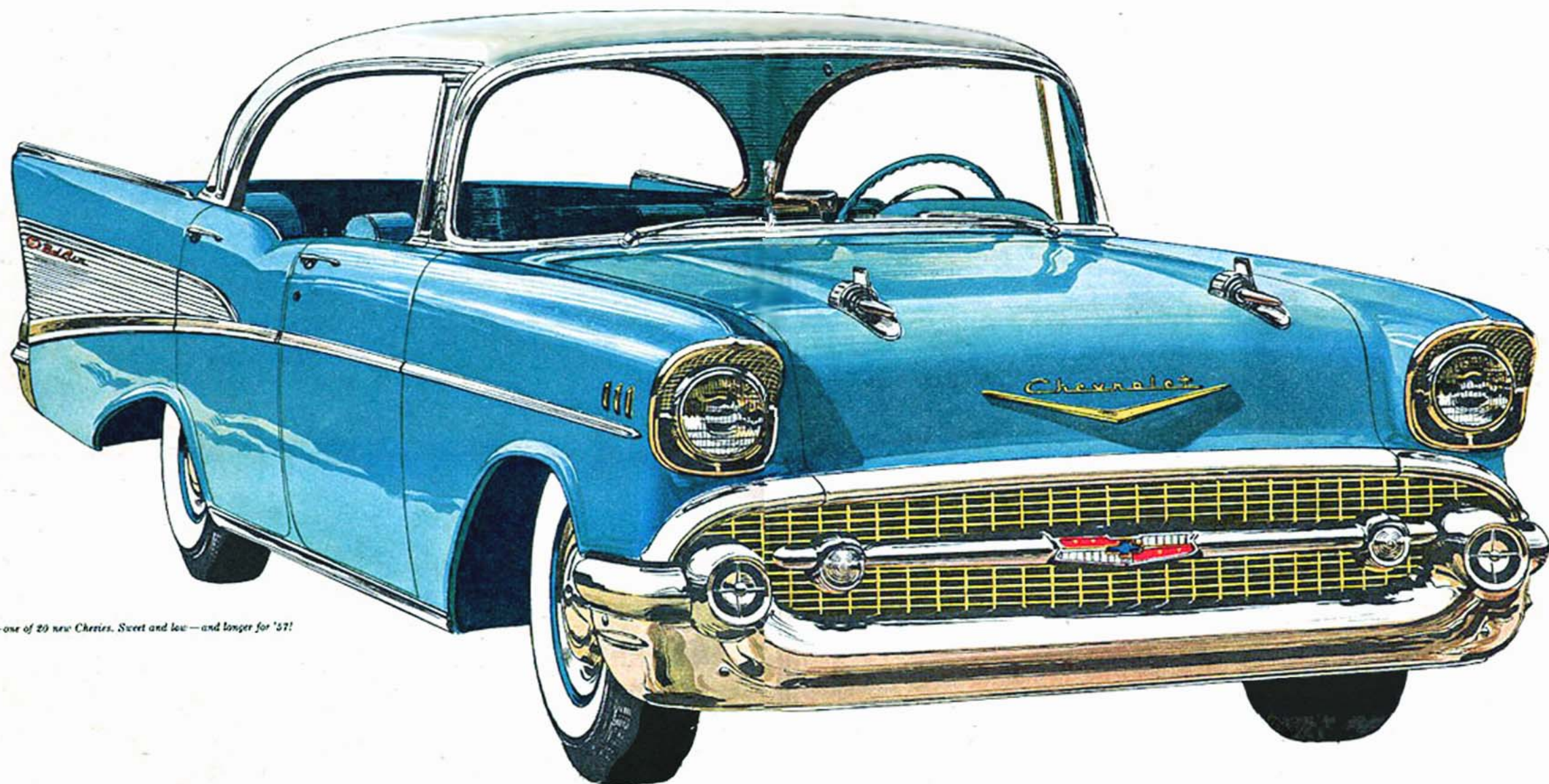
The beautifully new Bel Air Sport Sedan—one of 29 new Chevrolets. Sweet and low—and longer for '57!