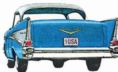
Chevy's new beauty wins going away! Body by Fisher, of course.

Chevy goes 'em all one better for '57 with a daring new departure in design (looks longer and lower, and it is!), exclusive new Turboglide automatic transmission with triple turbines, a new V8 and a bumper crop of new ideas including fuel injection!