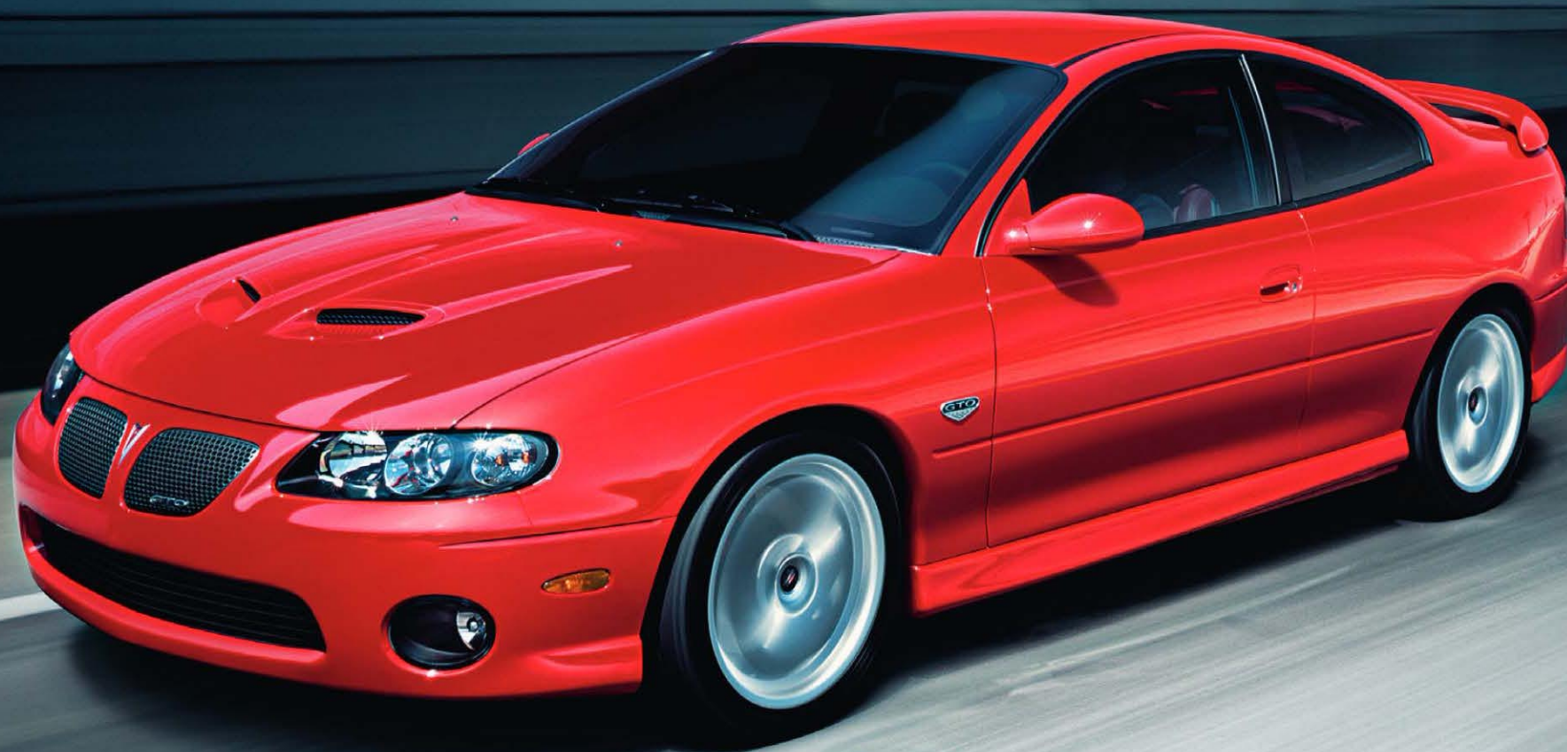
Pontiac GTO in Torrid Red with available features.