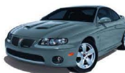
Cyclone Gray Metallic