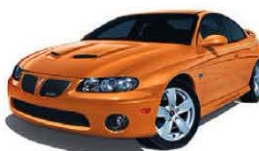
Brazen Orange Metallic