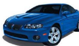
Impulse Blue Metallic