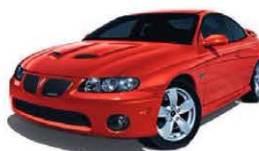
Spice Red Metallic