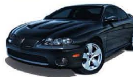
Phantom Black Metallic