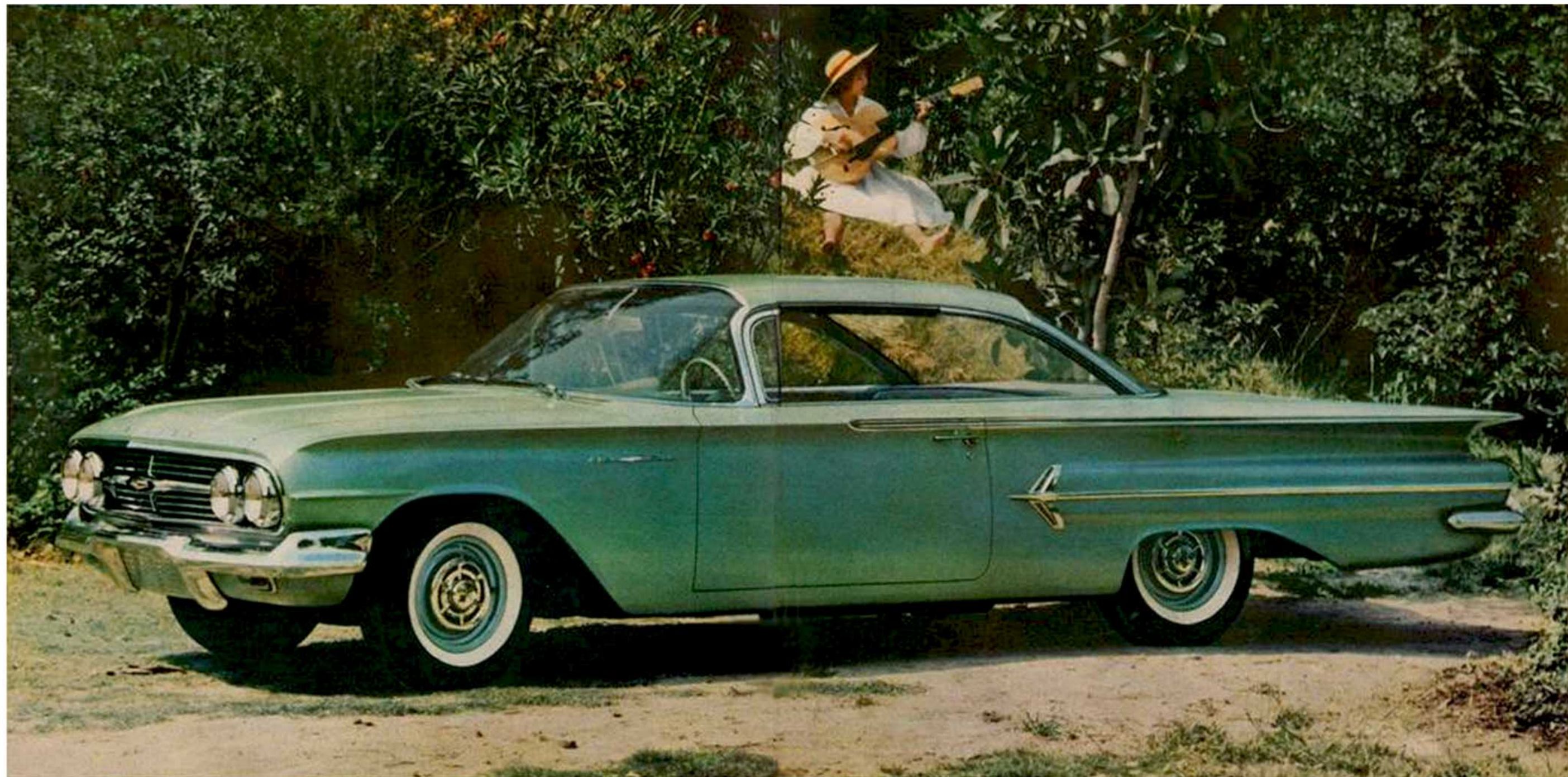
there's no new car like a '60 Chevrolet. This is the Bel Air Sport Coupe. / Air Conditioning—temperatures made to order—for all-weather comfort. Get a demonstration.

Chevrolet Division of General Motors, Detroit 2, Michigan