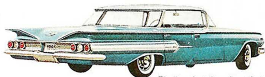
The Impala 4-Door Sport Sedan.

here for the first time anywhere— elegance with economy