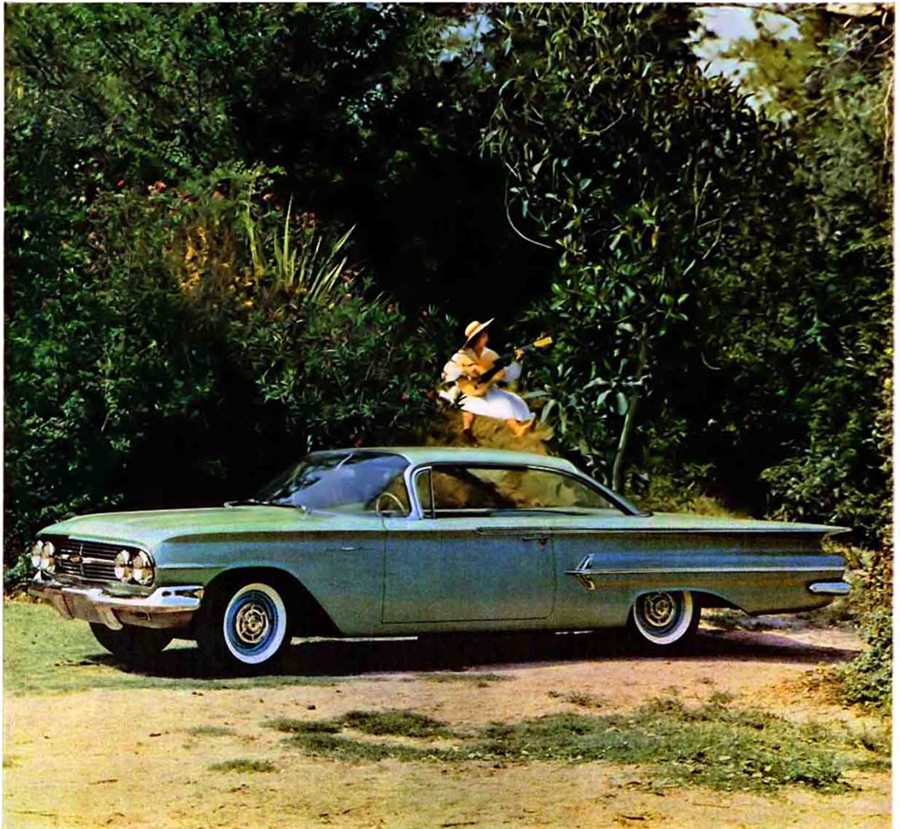
there's nothing like a new car—and no new car like a '60 Chevrolet. The Bel Air Sport Coupe.

Chevrolet Division of General Motors, Detroit 2, Michigan