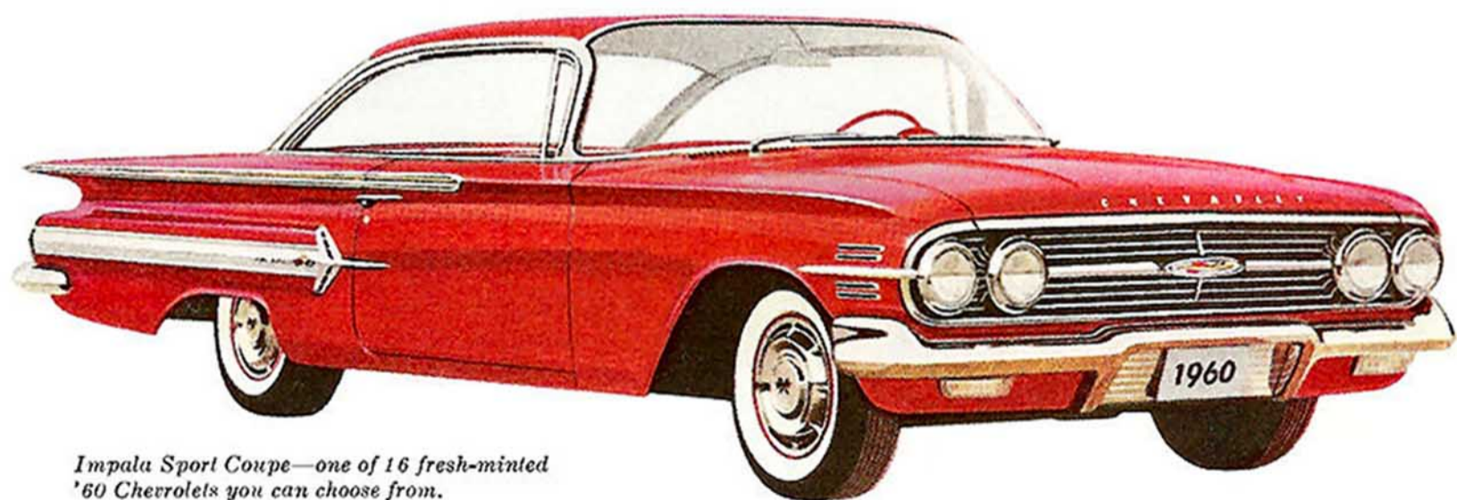
Impala Sport Coupe—one of 16 fresh-minted '60 Chevrolets you can choose from.