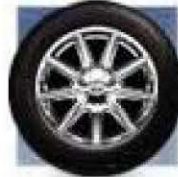
18-inch chrome-clad aluminum wheels standard on 300 Touring AWD, 300 Limited AWD and 300C AWD