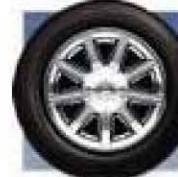
18-inch chrome-clad aluminum wheels standard on 300C