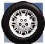
17-inch Bolt-On wheel covers standard on 300