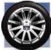
20-inch Ultra-Brite aluminum wheels standard on 300C SRT Design Group