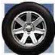
17-inch Machined aluminum wheels standard on 300 Touring