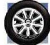
18-inch chrome-clad aluminum wheels standard on 300 Limited

For more information, please visit www.chrysler.com/300