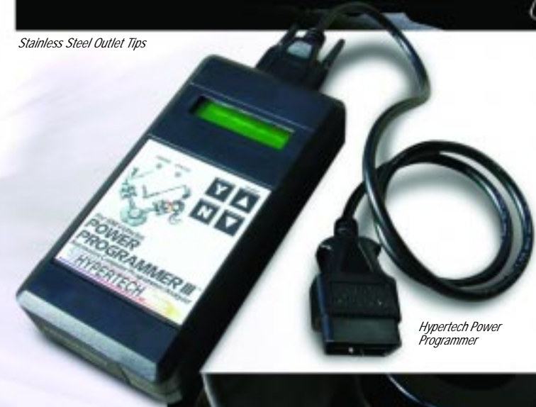
Hypertech Power Programmer