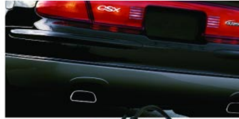
Stainless Steel Outlet Tips