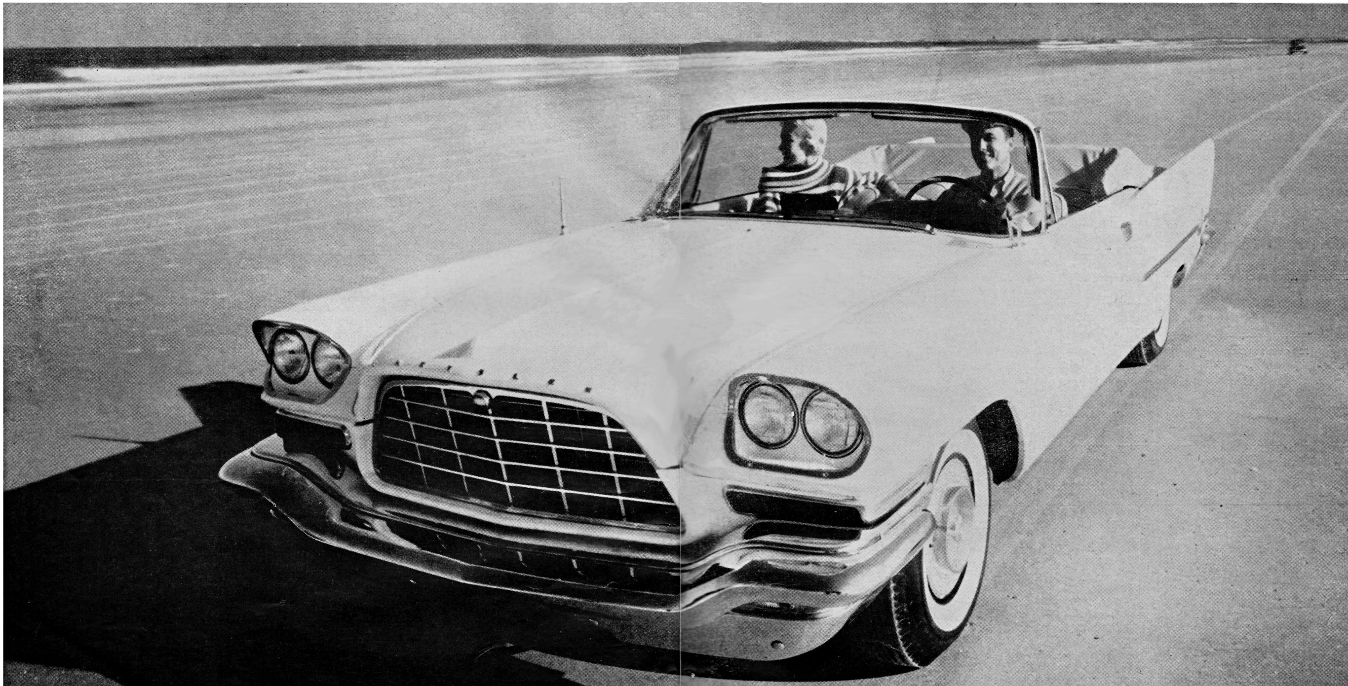
Newest Version of the NASCAR Grand National Champion . . . Chrysler 300-C