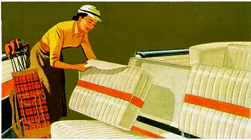
Above — The seats of the Caribbean series cars are reversible and they add a strikingly new note to the beauty of the car's interior. Here, plump, sleek leather fits perfectly into the outdoor sports picture.