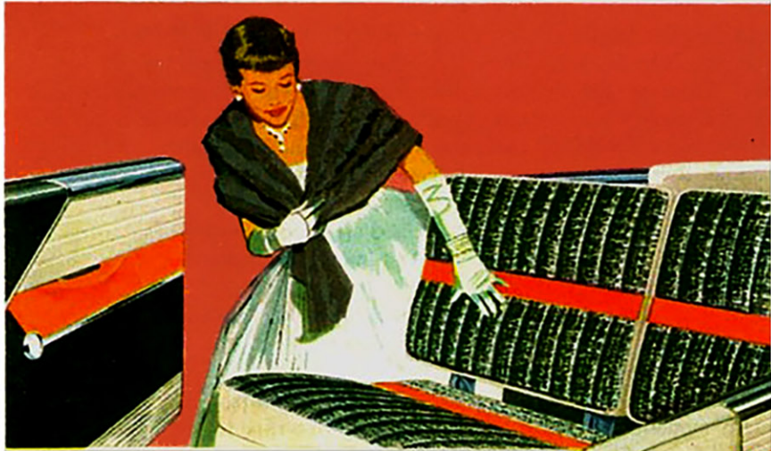
Below — On more formal occasions, the beautiful brocade fabric is especially appropriate. Notice the ingenious and practical separation between the comfort-contoured seat cushions and back rests.