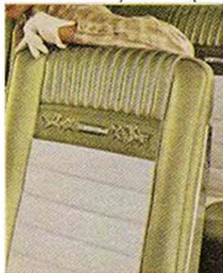
Handsome inserts of embossed vinyl