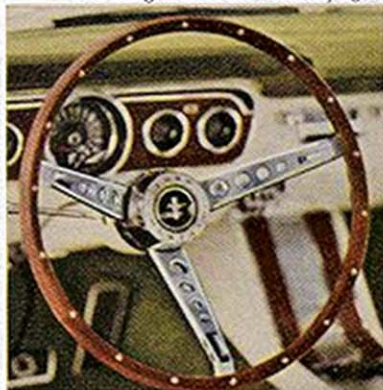
New sports steering wheel