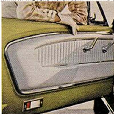
New integral arm rests—courtesy lights