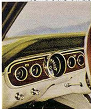
New luxury instrument panel