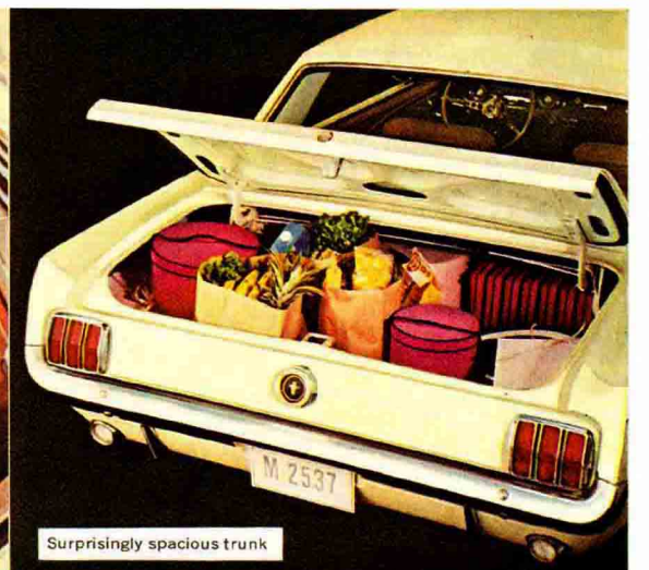
Surprisingly spacious trunk