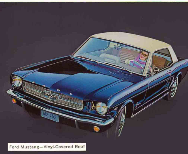
Ford Mustang—Vinyl-Covered Roof