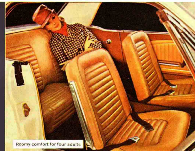
Roomy comfort for four adults