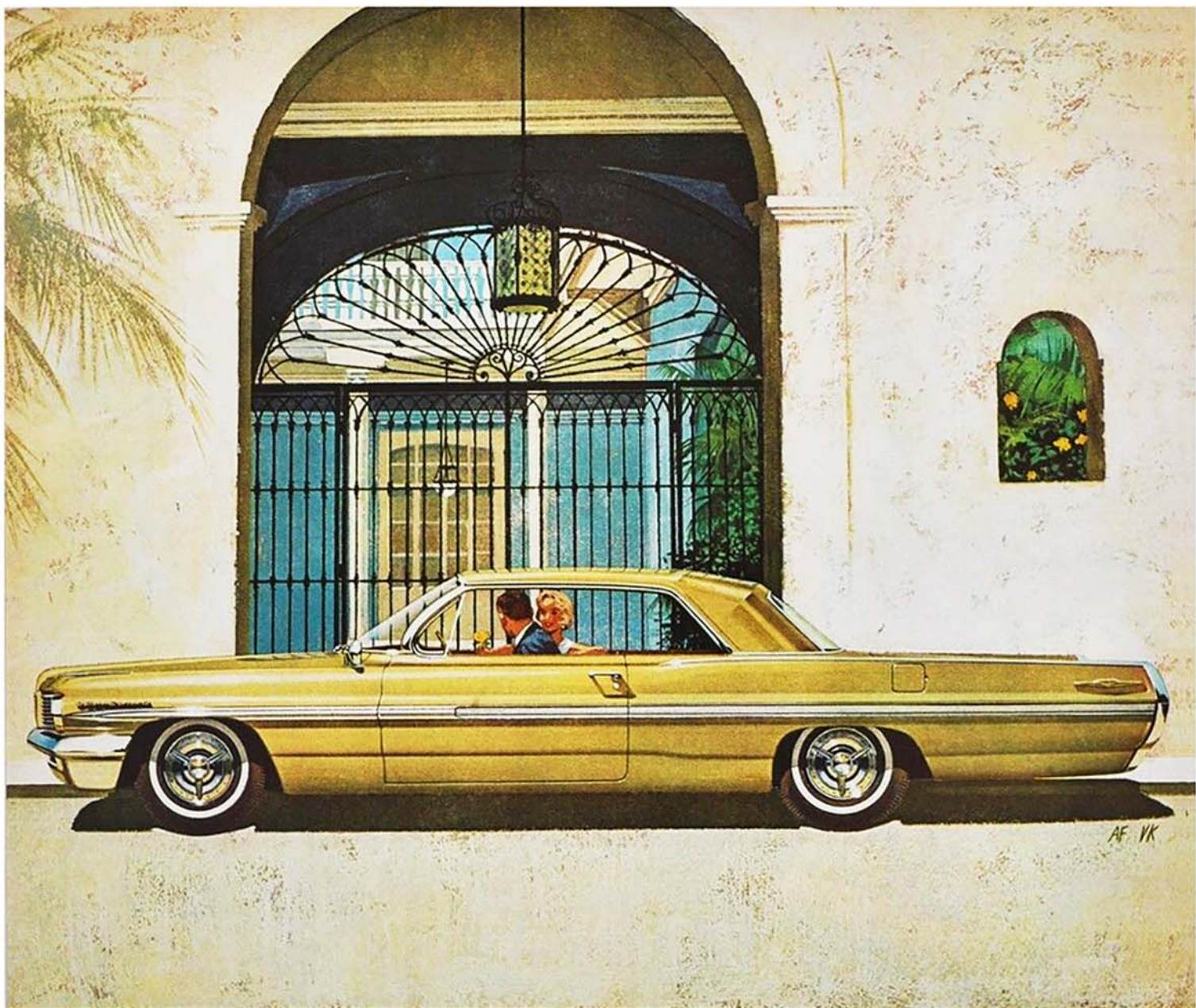
THE BONNEVILLE SPORTS COUPE • PONTIAC MOTOR DIVISION • GENERAL MOTORS CORPORATION