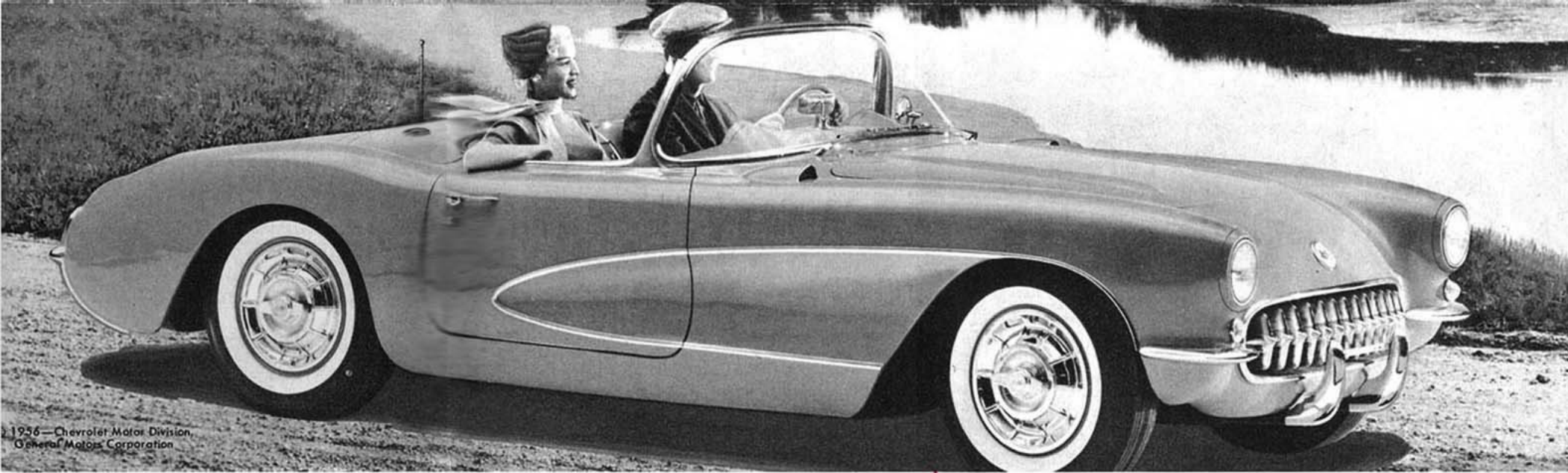
1956—Chevrolet Motor Division, General Motors Corporation

Since its initial introduction in limited volume, the Corvette has commanded the attention of sports car enthusiasts. Now its major new design factors will be welcomed as answers to the needs expressed by this well-informed group. Drivers who scorn the "scaled