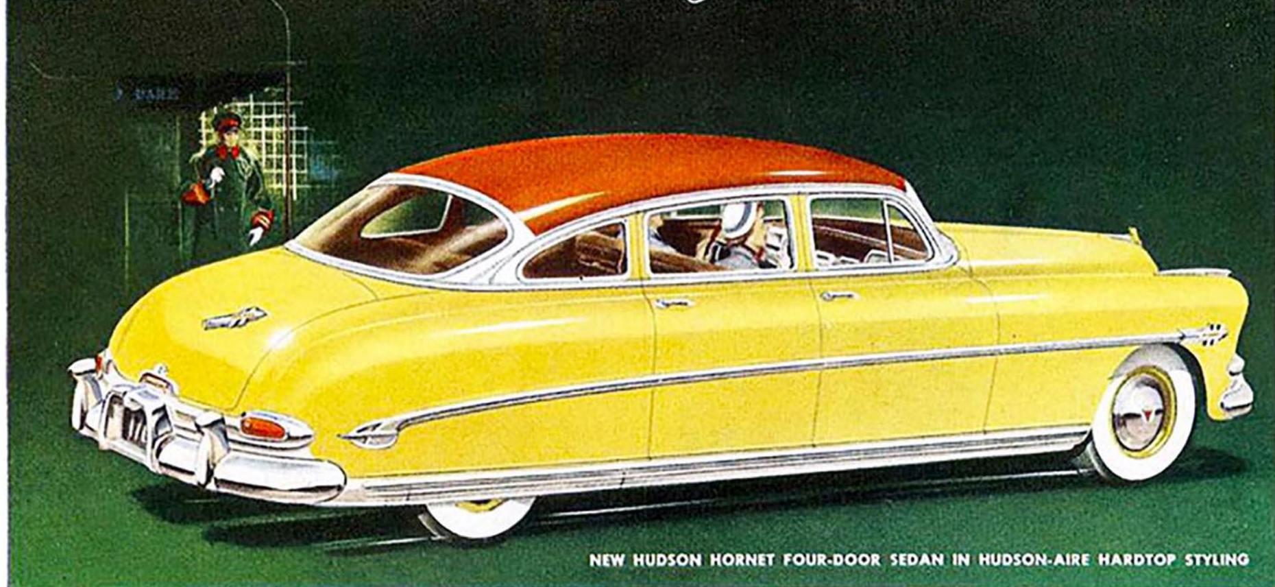
NEW HUDSON HORNET FOUR-DOOR SEDAN IN HUDSON-AIRE HARDTOP STYLING

Year's most beautiful cars powered to out-perform them all!