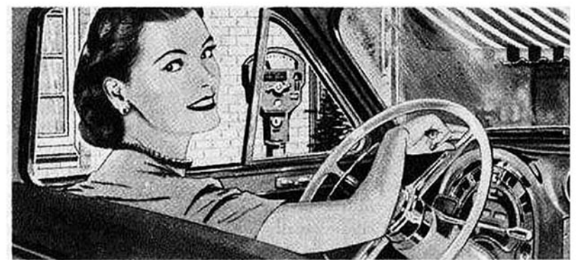
3 HYDRAGUIDE . . . first power steering in any passenger car, does four-fifths of the steering work for you!

new-type Oriflow shock absorbers, also introduced this year by Chrysler, which by actual measurement have more than twice the shock-absorbing power of those on any other car.