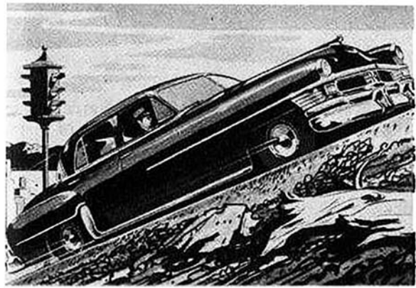
1 FIREPOWER . . . 180 horsepower . . . finest and most powerful performer in any American passenger car today!

In at least three ways, this Chrysler does what no car has ever done before! And each of the three is a noticeable improvement for the man who sits behind its wheel.